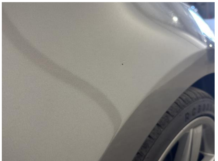
14: Wing osf Chipped 1 To 5