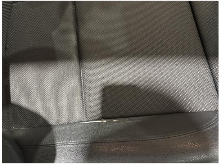
16: Seat Back Cover of Scuffed Over 25mm