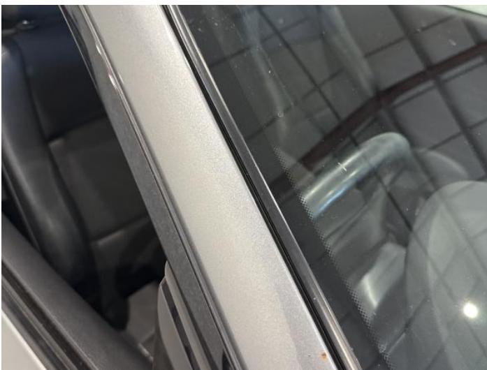
13: A Post os Chipped 1 To 5