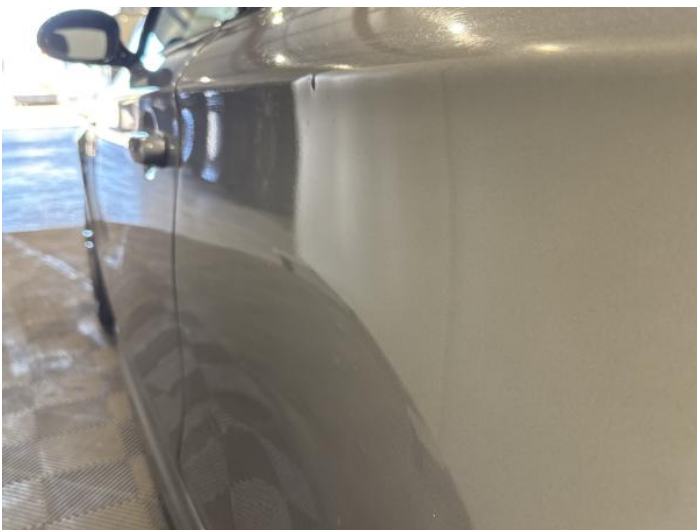
7: Qtr Panel nsr Dented Over 30mm