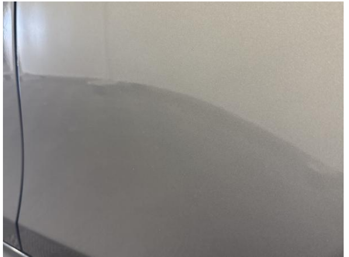
6: Qtr Panel nsr Chipped 1 To 5