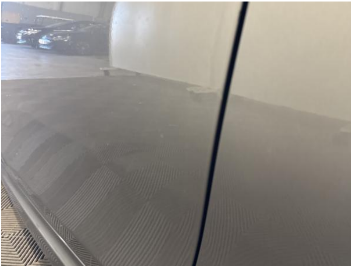
5: Door nsf Chipped 1 To 5