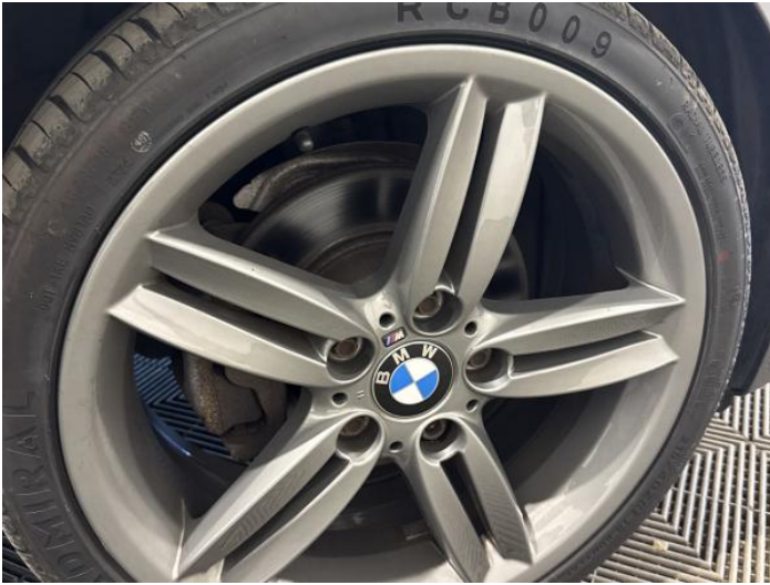
15: Wheel of Scratched Up To 50mm