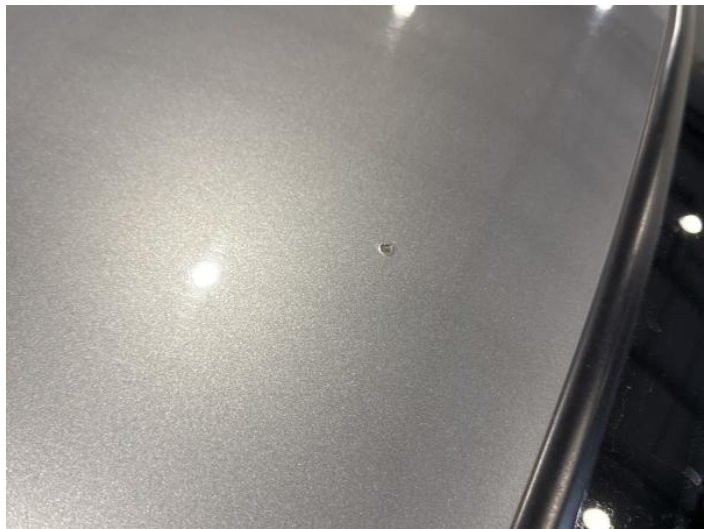
12: Roof Chipped Over 5mm