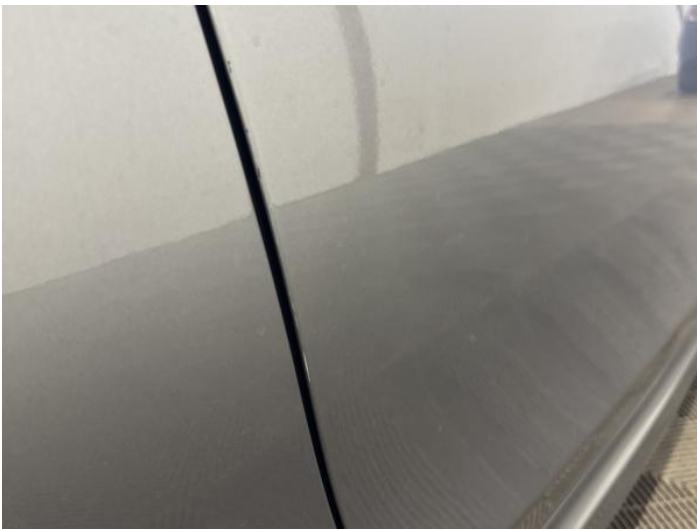
11: Door osf Chipped Edge Chip