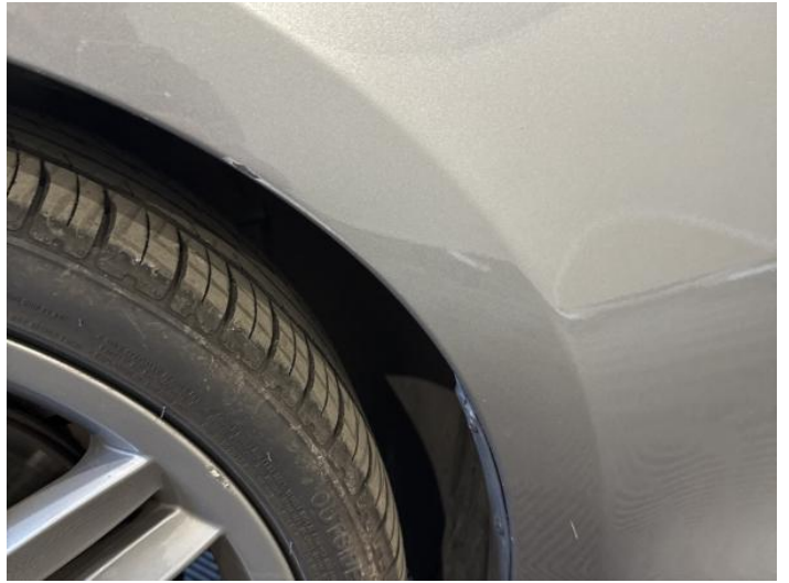
4: Wing nsf Scratched Over 25mm Thru Paint