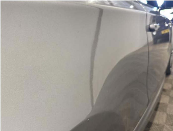
9: Qtr Panel osr Dented Between 10mm + 30mm