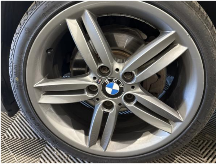
3: Wheel nsf Scratched Up To 50mm