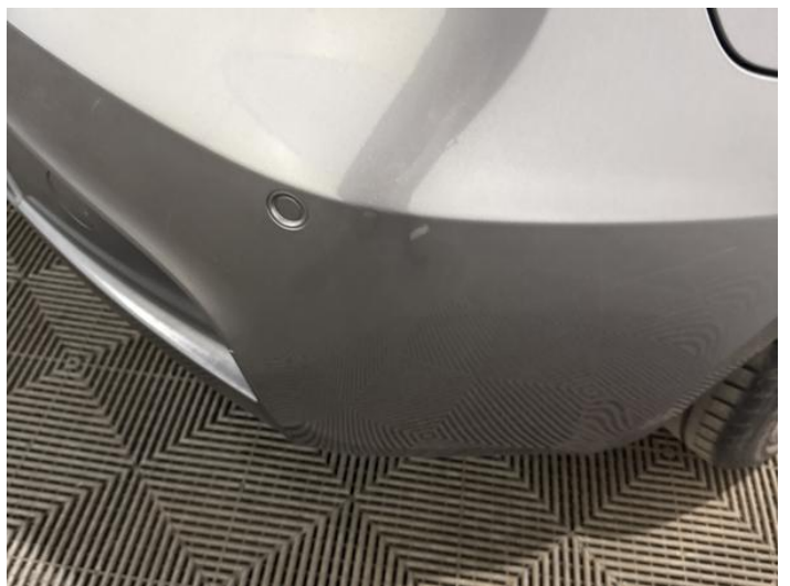
8: Bumper Rear Scratched 25 to 100mm Thru Paint