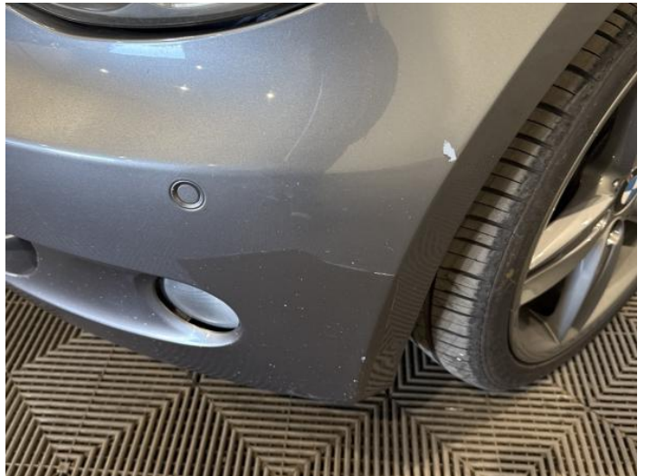
2: Bumper Front Poor Previous Repair Paint Flake