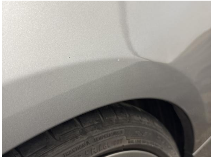
10: Qtr Panel osr Chipped 1 To 5