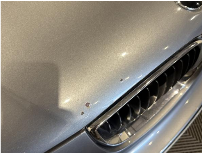
1: Bonnet Chipped Over 5mm