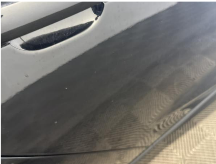
5: Door osr Scratched Over 25mm Thru Paint