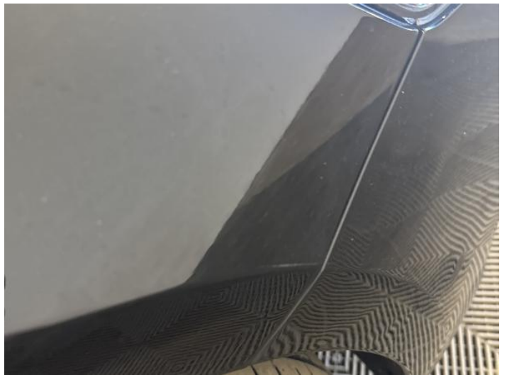
6: Wing osf Scratched UpTo 25mm Thru Paint