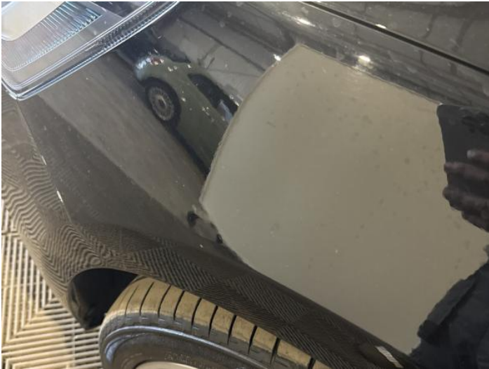
3: Wing nsf Chipped 1 To 5