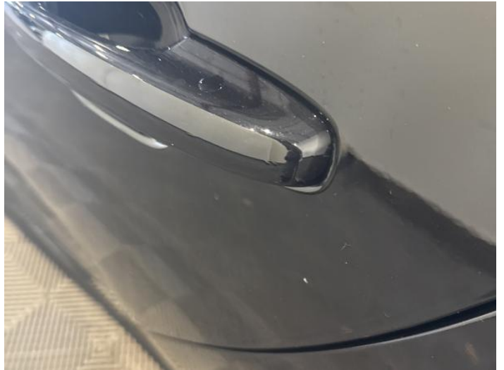
4: Door nsr Chipped 1 To 5