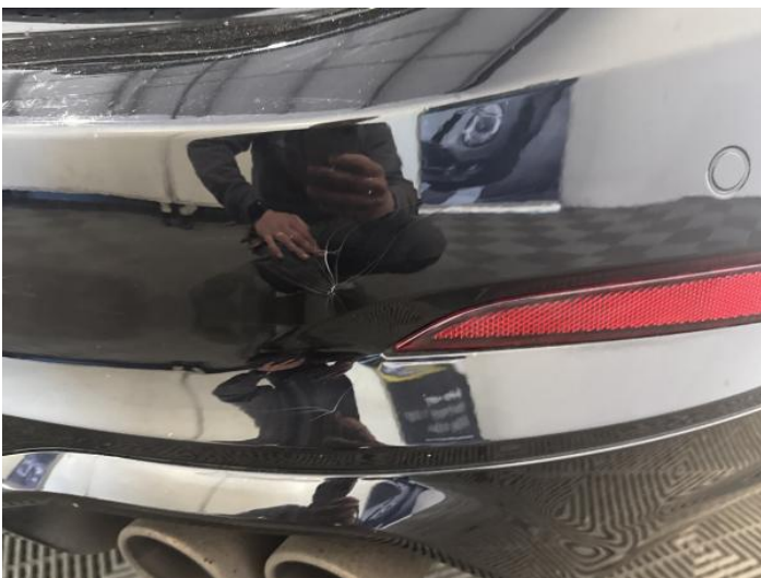
7: Bumper Rear Dented With Paint Damage