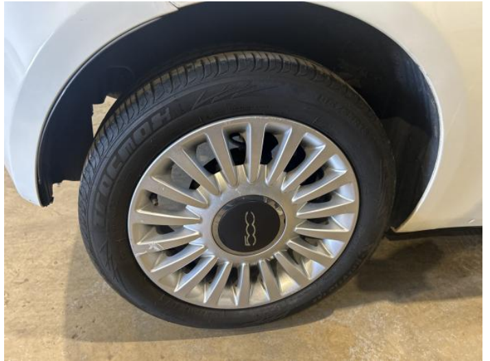
4: Wheel osr Scratched Over 50mm