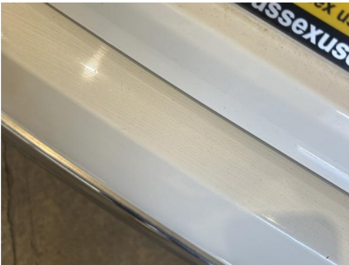
5: Bumper Rear Scratched Over 100mm Thru Paint