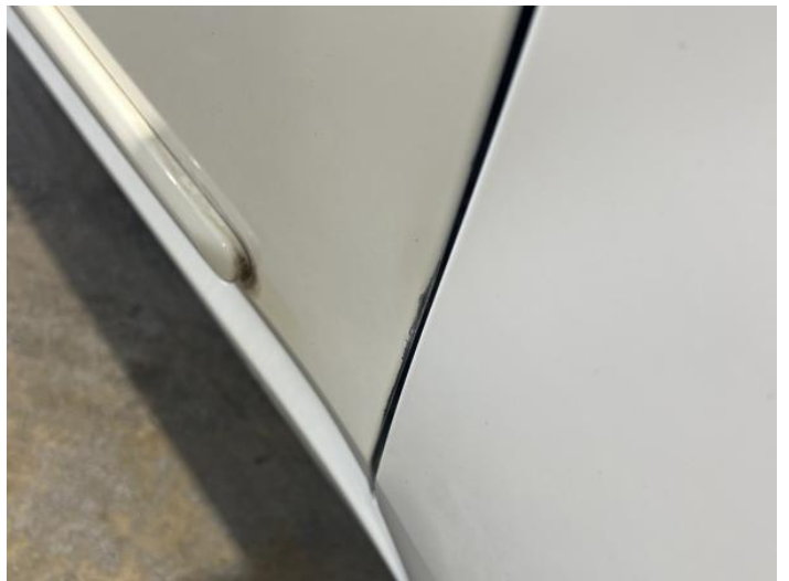
2: Door osf Chipped Edge Chip