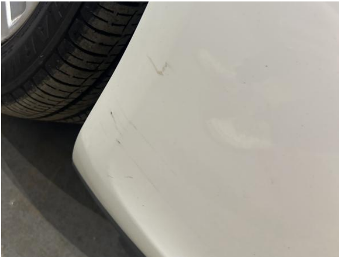
11: Bumper Front Scratched 25 to 100mm Thru Paint