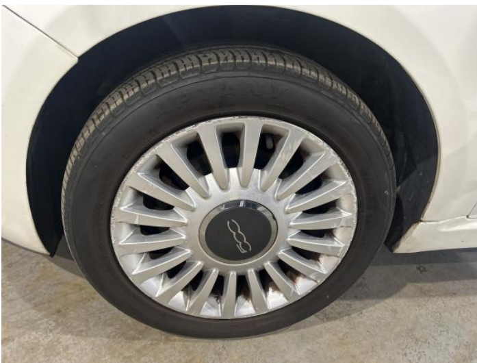
7: Wheel nsf Scratched Over 50mm