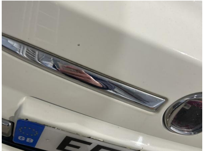
10: Bumper Front Chipped Multiple Chips