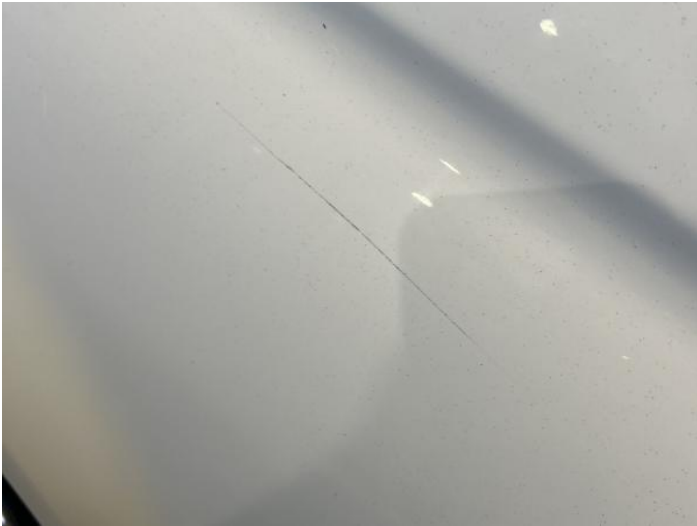
3: Qtr Panel osr Scratched Over 25mm Thru Paint