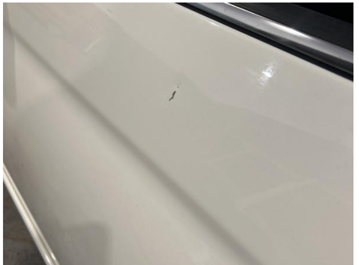
6: Door nsf Dented With Paint Damage