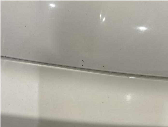
9: Bonnet Chipped 1 To 5