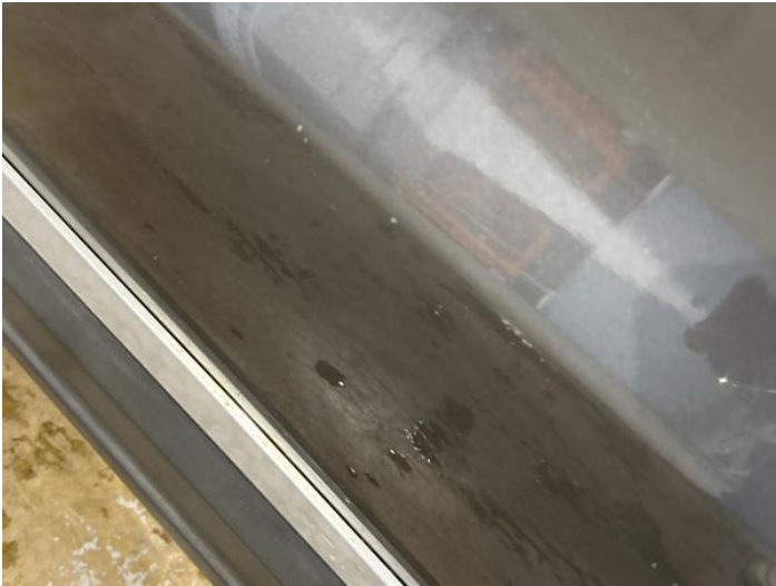
3: Door osf Chipped 1 To 5