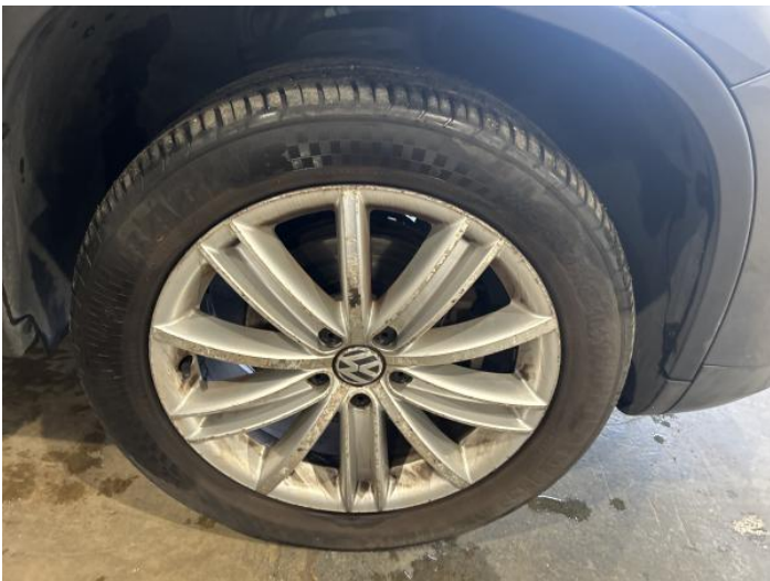
1: Wheel osf Corroded Light