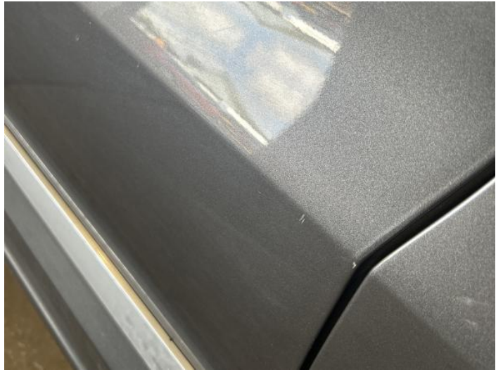
10: Door nsf Chipped 1 To 5