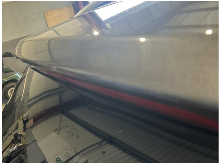
6: Boot Lid Dented Between 10mm + 30mm