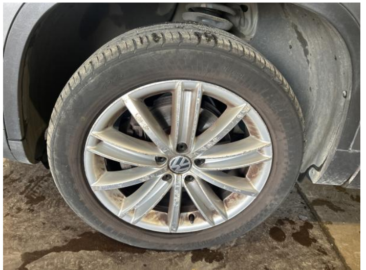
12: Wheel nsf Corroded Light