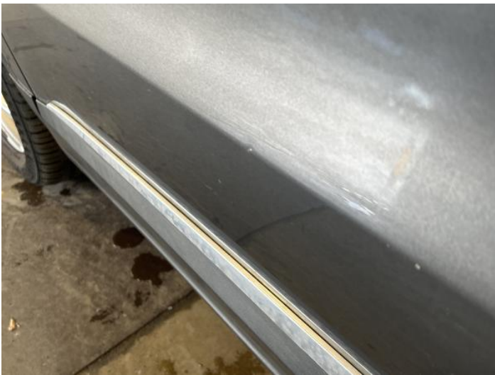
11: Door nsr Dented 2 Or Less UpTo 10mm