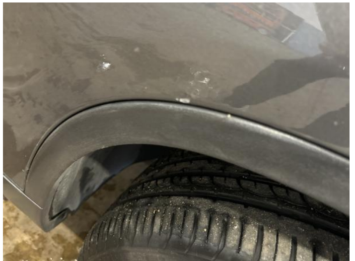
2: Wing osf Chipped 1 To 5