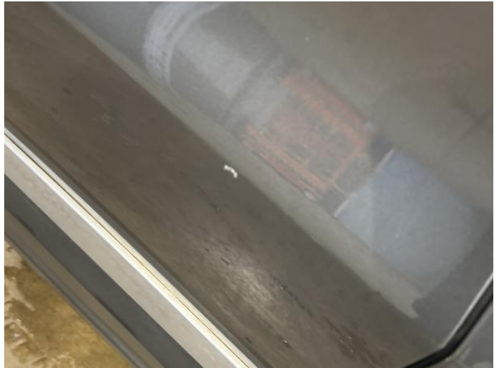
4: Door osr Chipped 1 To 5