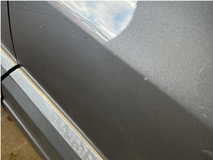
9: Door nsr Chipped 1 To 5