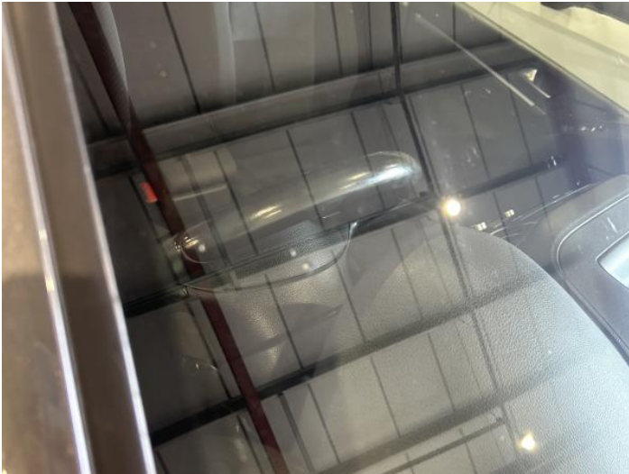
15: Screen Front Chipped UpTo 10mm