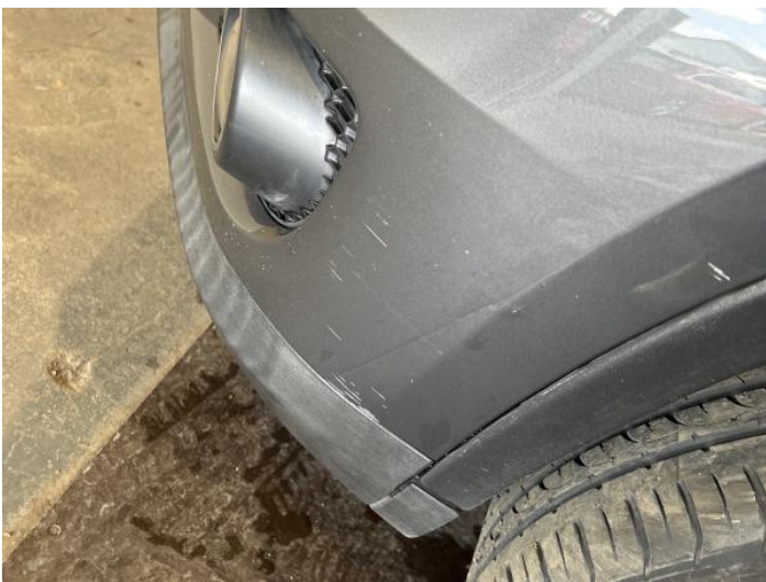
13: Bumper Front Scratched 25 to 100mm Thru Paint