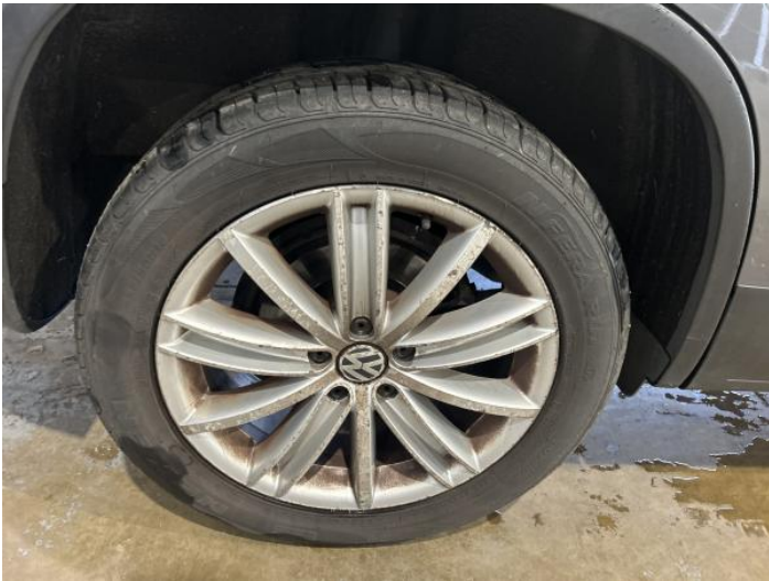
5: Wheel osr Corroded Light