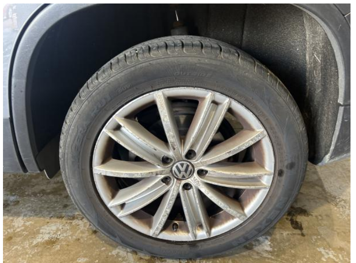
8: Wheel nsr Corroded Light