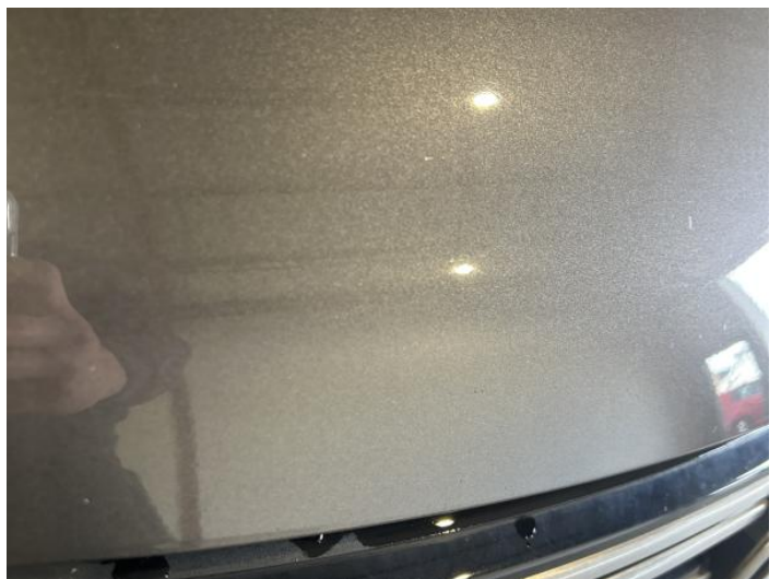
14: Bonnet Chipped 1 To 5