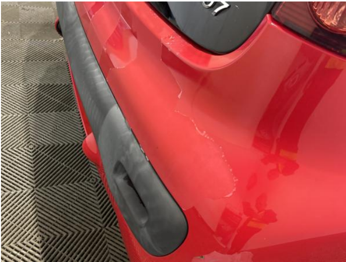
5: Bumper Rear Poor Previous Repair Paint Flake