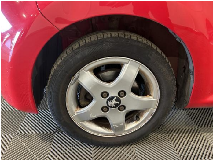
9: Wheel nsf Scratched Over 50mm