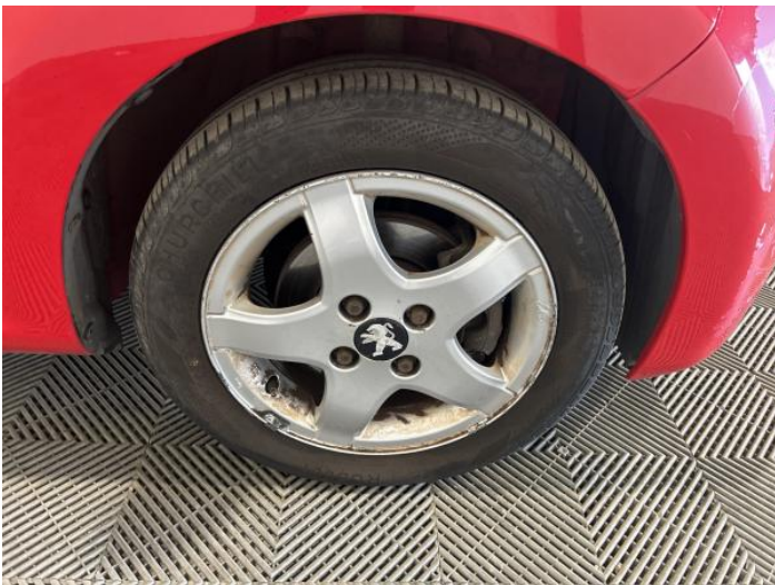
1: Wheel of Scratched Over 50mm