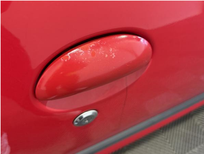
3: Other N/A N/A