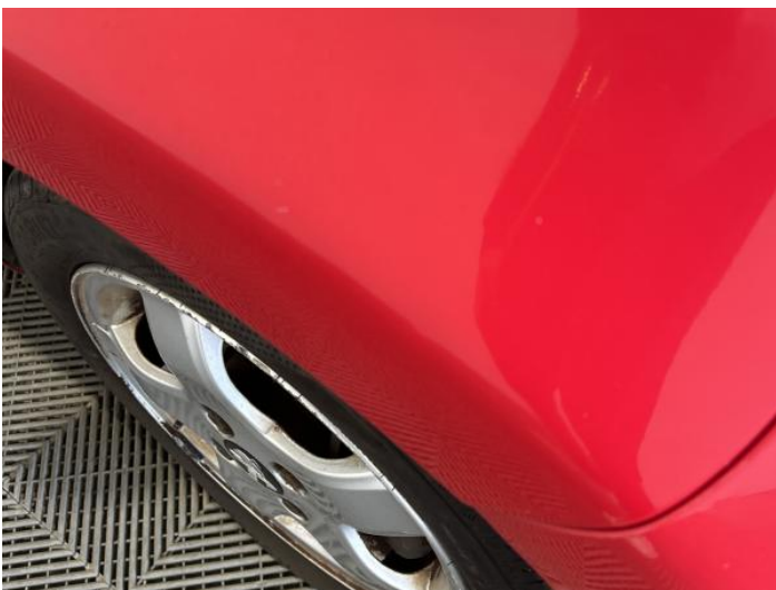
13: Wing osf Dented 2 Or Less UpTo 10mm