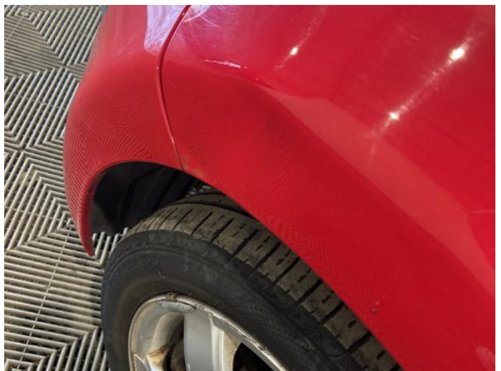
8: Wing nsf Dented Over 30mm