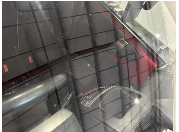
12: Screen Front Chipped UpTo 10mm