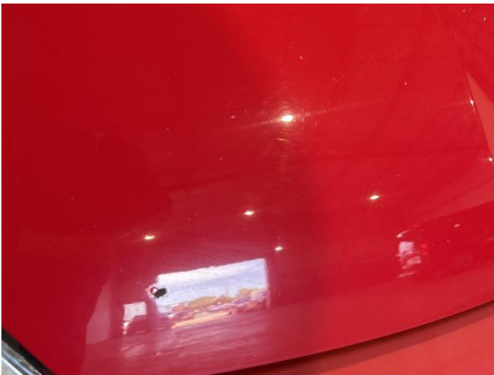
11: Bonnet Chipped Multiple Chips