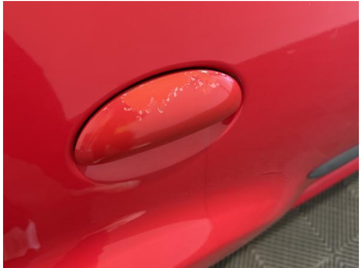
4: Other N/A N/A