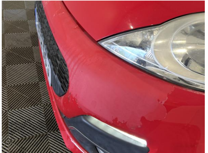
10: Bumper Front Poor Previous Repair Paint Flake