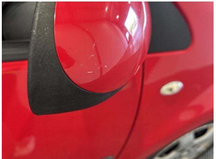
2: Door Mirror Assy of Scratched (Painted) Up To 25mm Thru Paint