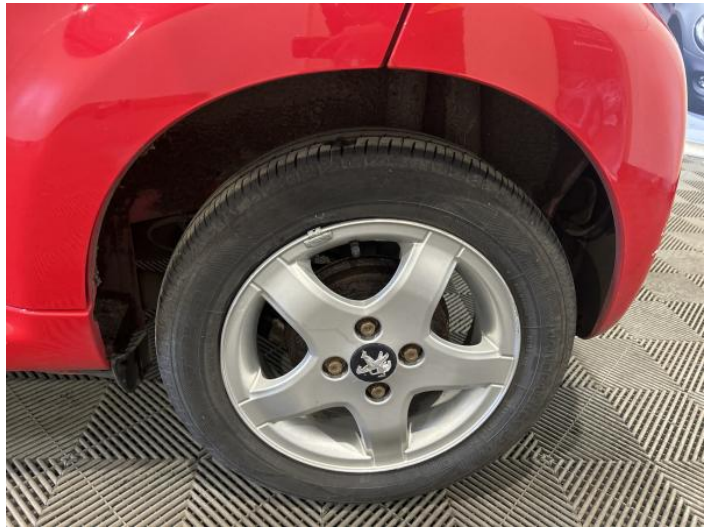
6: Wheel nsr Scratched Up To 50mm