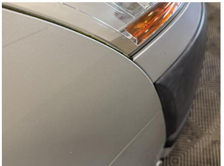
14: Wing osf Chipped 1 To 5