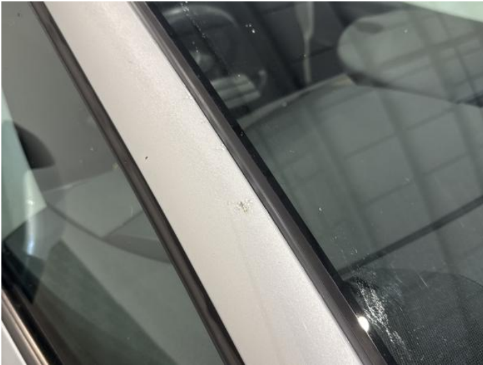
15: A Post os Rusted Over 5mm