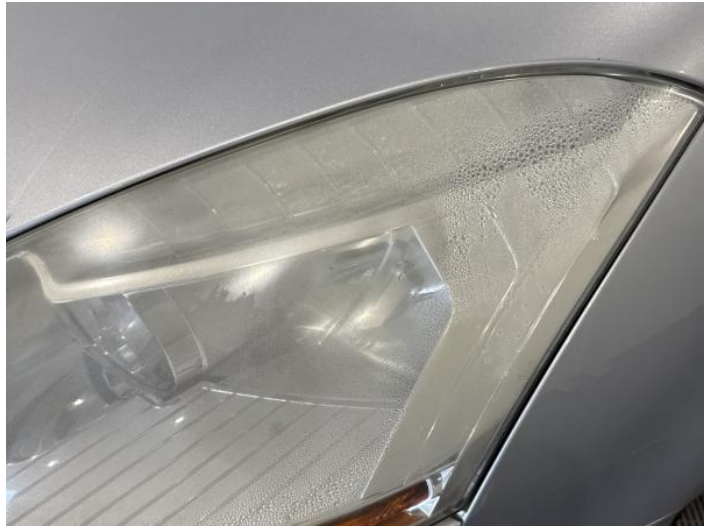
4: Other N/A N/A