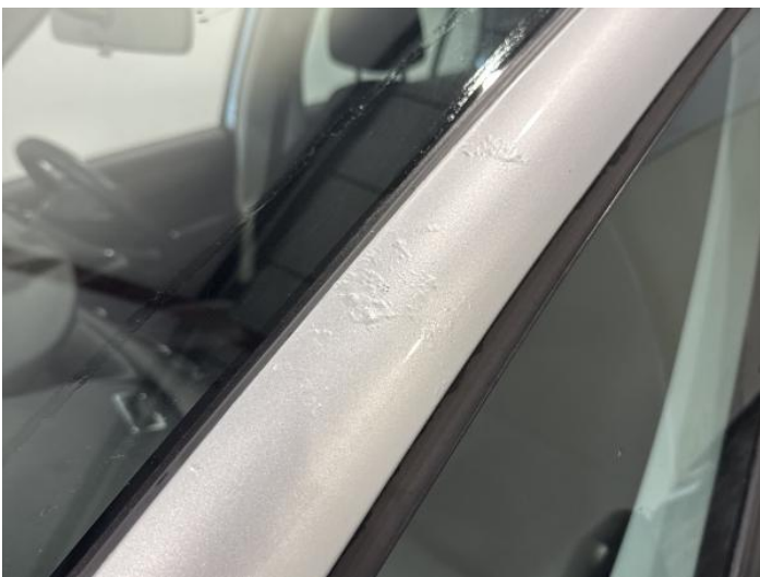
7: A Post ns Rusted Over 5mm