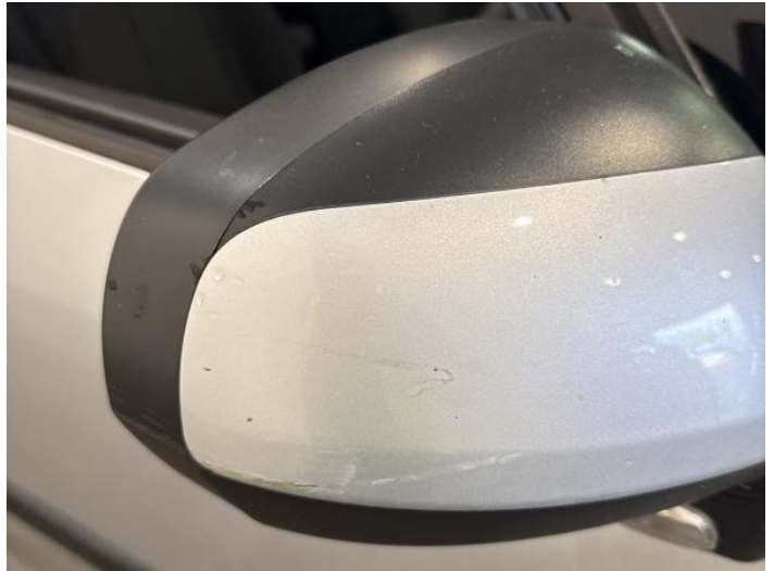
16: Door Mirror Assy osf Scratched (Painted) Over 25mm Thru Paint