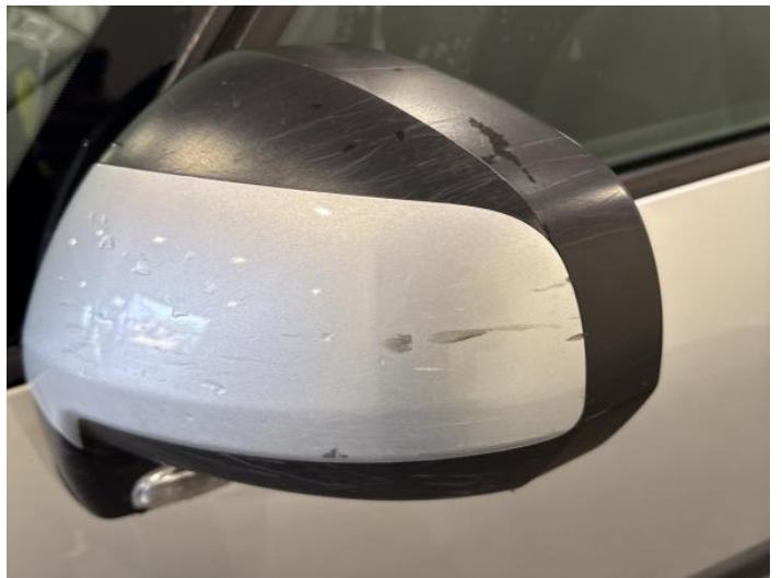
6: Door Mirror Assy nsf Scratched (Painted) Over 25mm Thru Paint