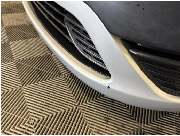
3: Bumper Front Scratched Over 100mm Thru Paint