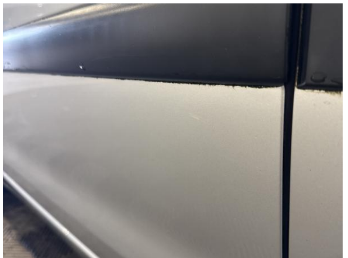
8: Door nsf Scratched UpTo 25mm Thru Paint