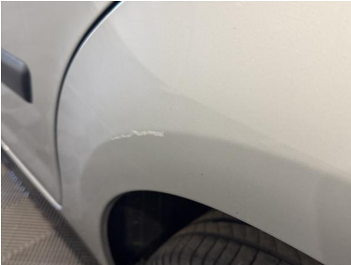
9: Qtr Panel nsr Scratched Over 25mm Thru Paint