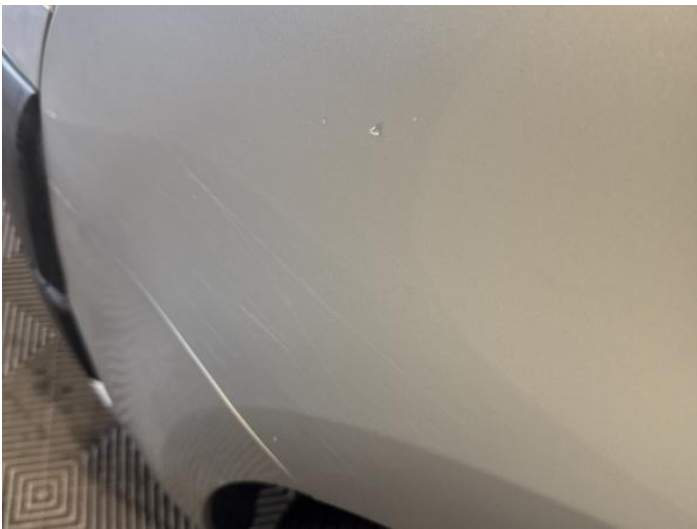
5: Wing nsf Scratched Over 25mm Thru Paint