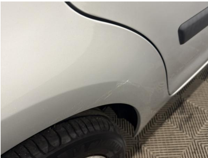
11: Qtr Panel osr Scratched Over 25mm Thru Paint