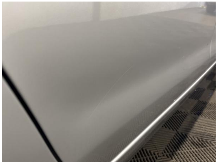
12: Door osr Scratched Over 25mm Thru Paint