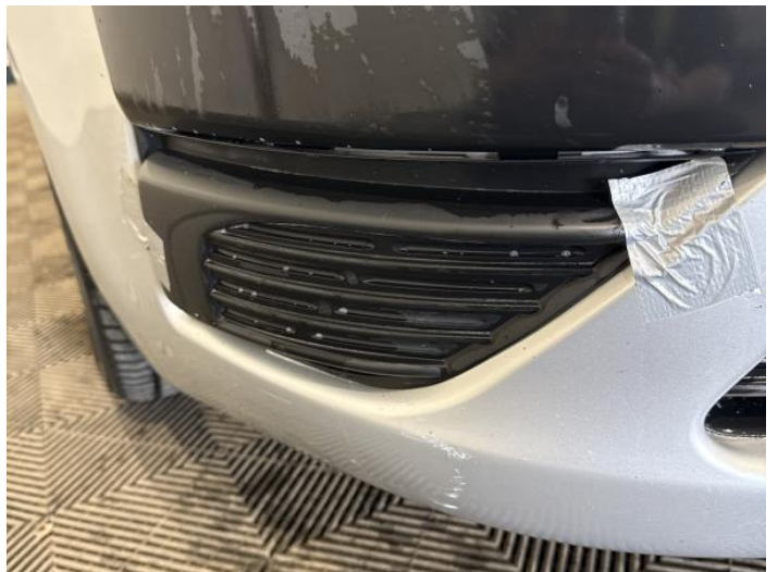
2: Bumper Front Moulding Broken Replace