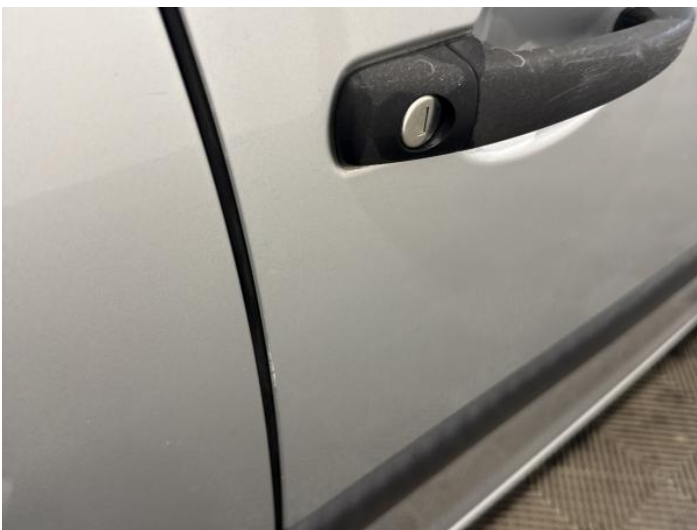
13: Door osf Chipped Edge Chip