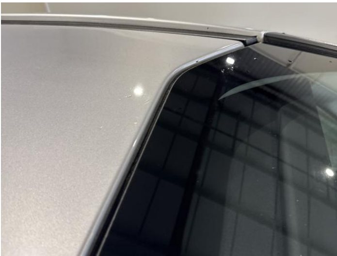
17: Roof Chipped Edge Chip