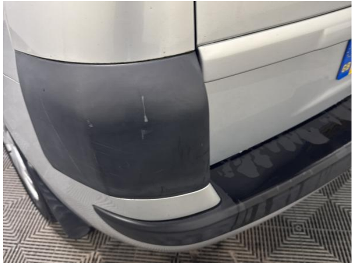
10: Bumper Rear Moulding Scuffed (Unpainted) UpTo 100mm