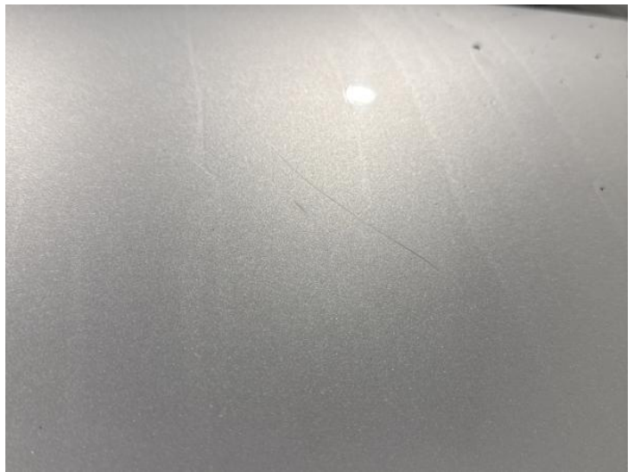
18: Tailgate Scratched Over 25mm Thru Paint