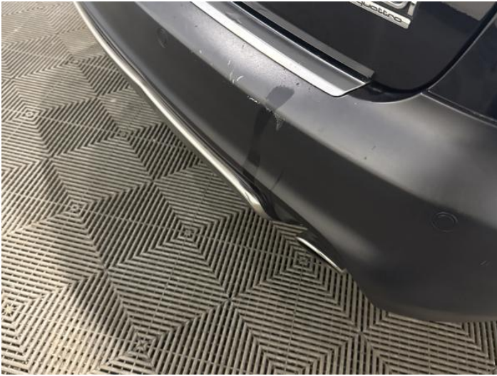
9: Bumper Rear Scratched Over 100mm Thru Paint