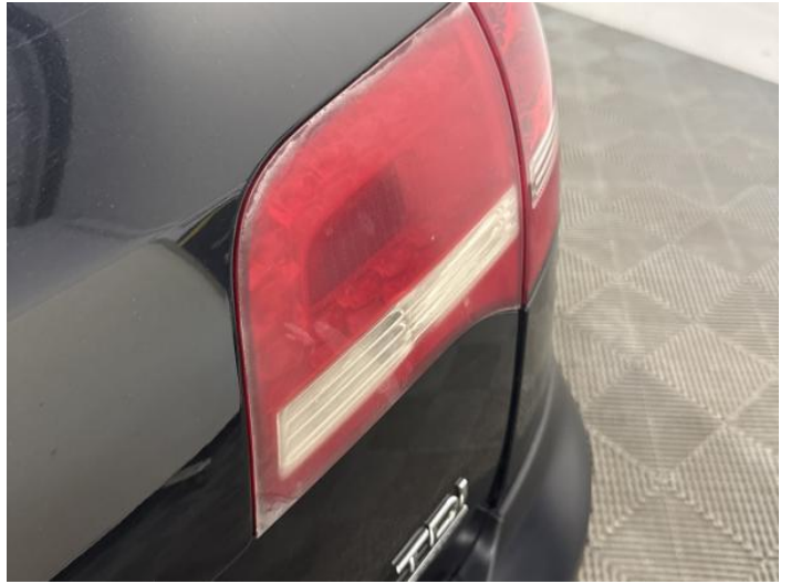
10: Other N/A N/A