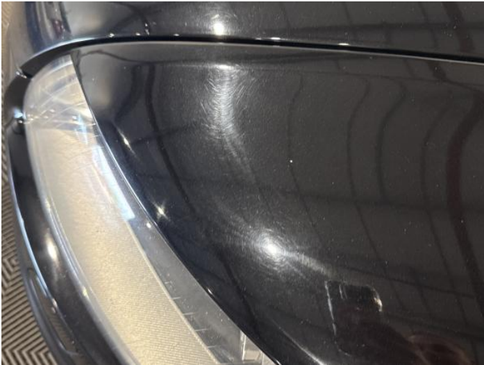
3: Wing nsf Chipped 1 To 5