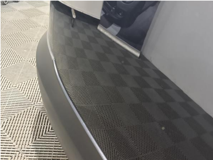
15: Qtr Panel osr Scratched UpTo 25mm Thru Paint