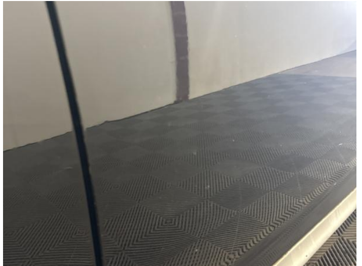
16: Door osf Chipped 1 To 5