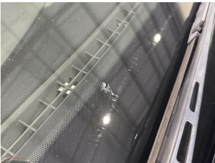
19: Screen Front Cracked Replace