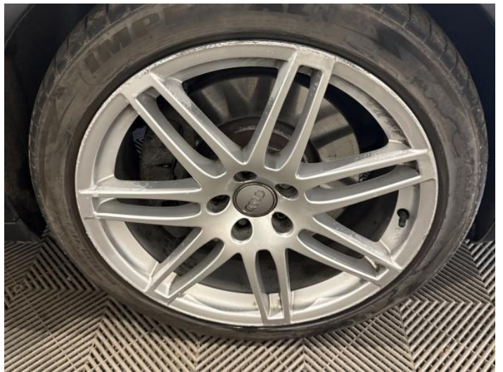
18: Wheel osf Scratched Over 50mm