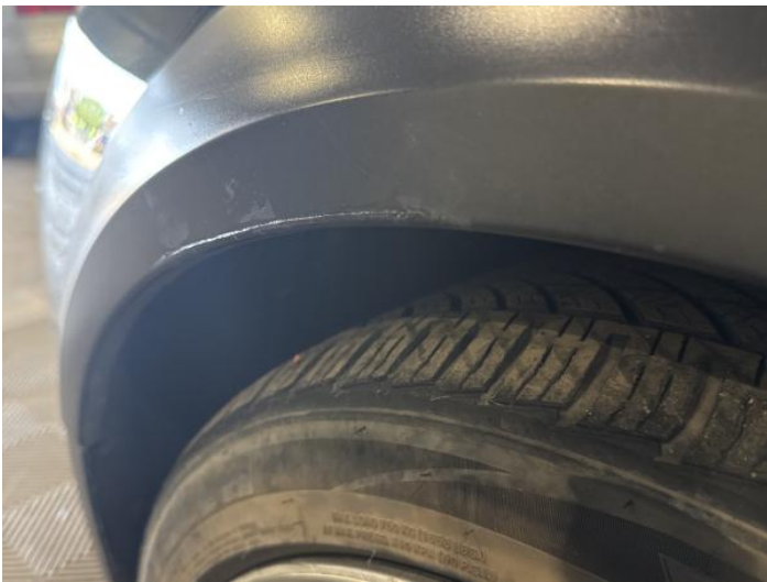
5: Wing Front Arch Extension ns Scuffed (Unpainted) Over 100mm