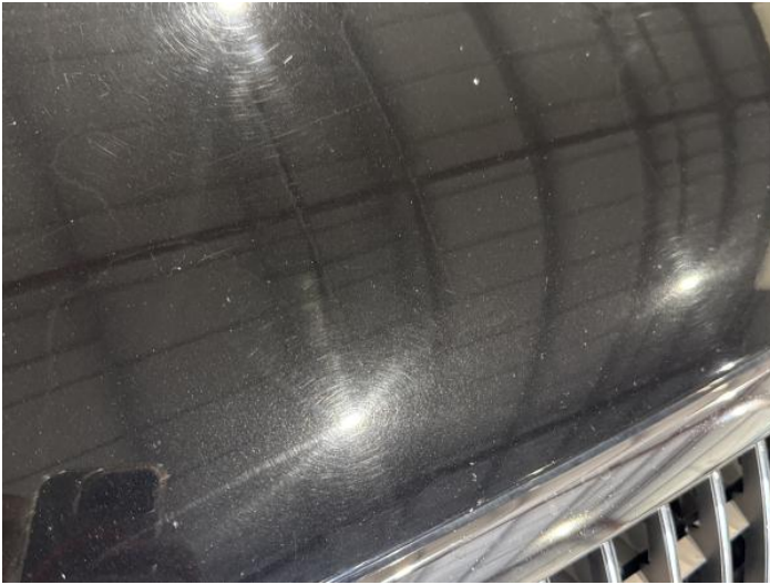
21: Bonnet Dented Between 10mm + 30mm