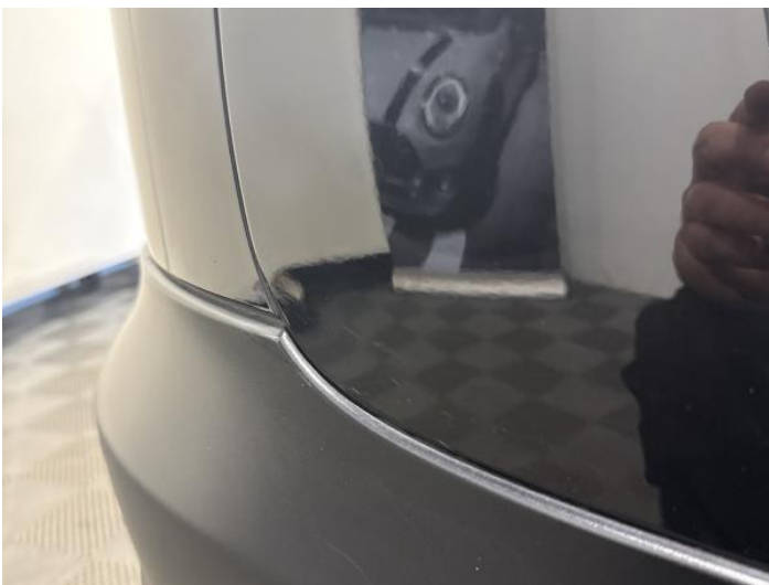
13: Qtr Panel osr Dented Between 10mm + 30mm