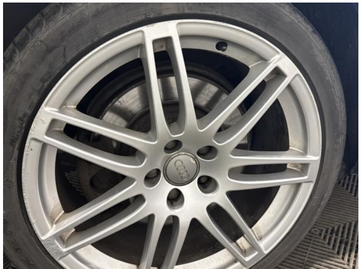
12: Wheel osr Scratched Over 50mm