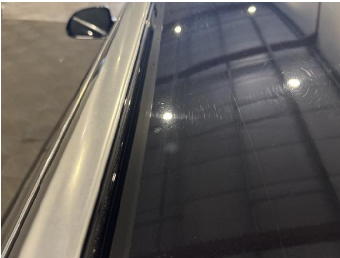
11: Roof Dented Between 10mm + 30mm