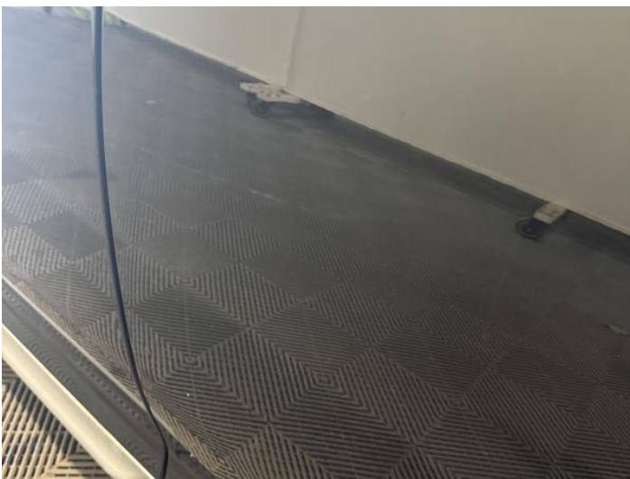
7: Door nsr Scratched Over 25mm Thru Paint