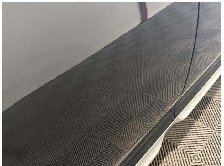
14: Door osr Chipped 1 To 5