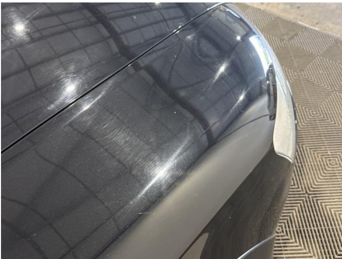
17: Wing osf Chipped Multiple Chips