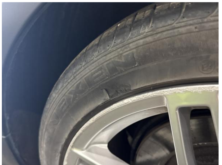
20: Tyre nsr Damaged Replace