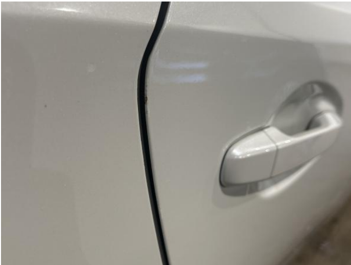
1: Door osr Chipped Edge Chip