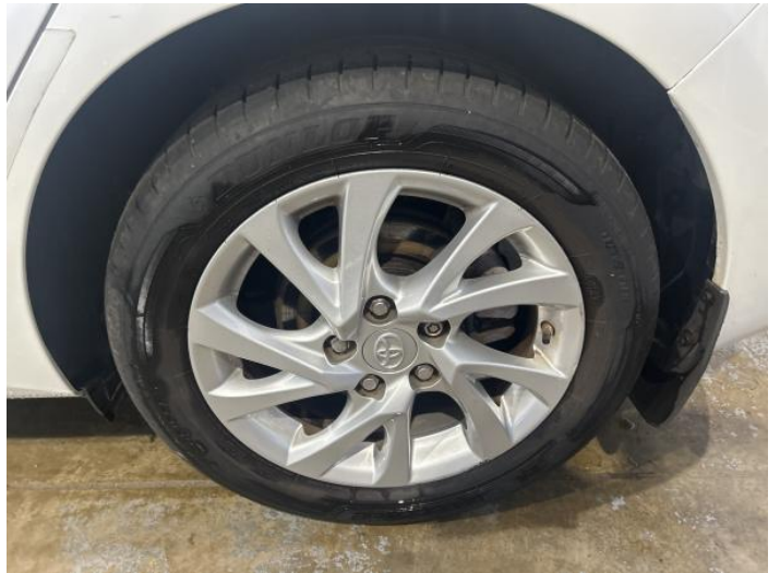
2: Wheel nsr Scratched Over 50mm