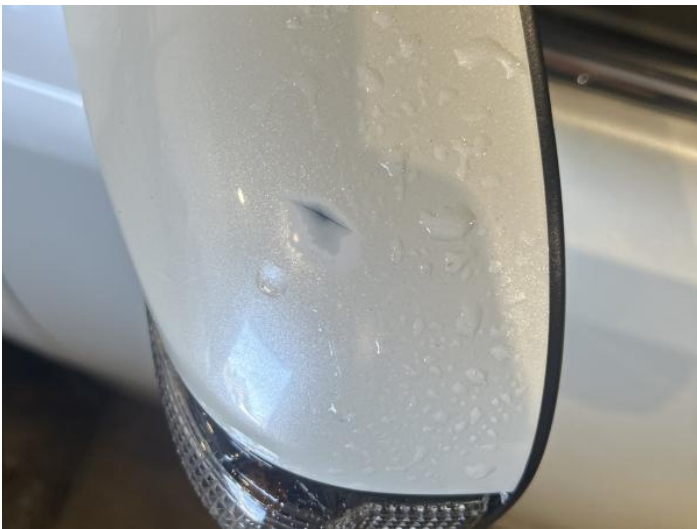
5: Door Mirror Assy nsf Scratched (Painted) UpTo 25mm Thru Paint