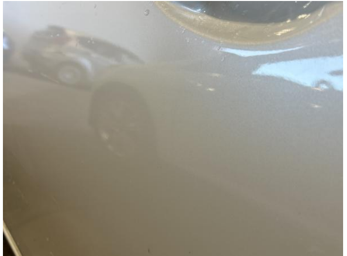
4: Door nsf Poor Previous Repair Poor Paint