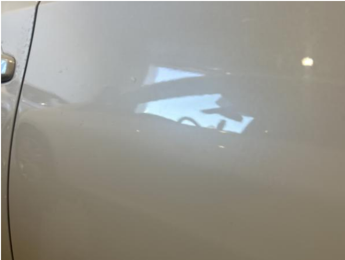
3: Door nsr Poor Previous Repair Poor Paint