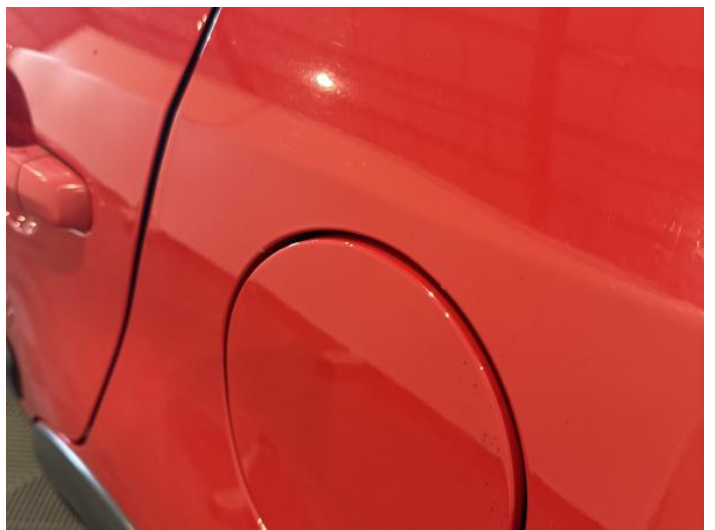
8: Qtr Panel nsr Chipped 1 To 5