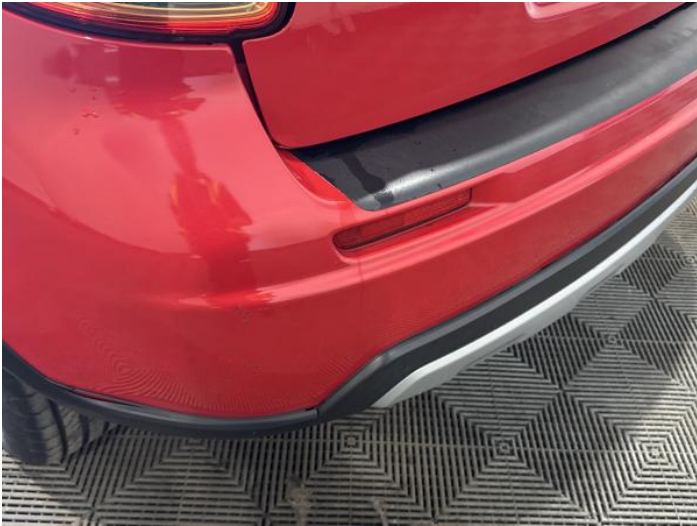
9: Bumper Rear Scratched 25 to 100mm Thru Paint