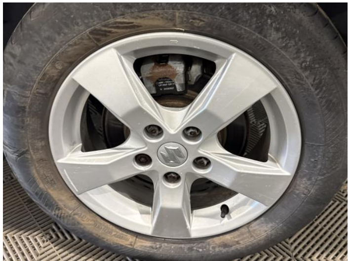
6: Wheel nsr Scratched Over 50mm