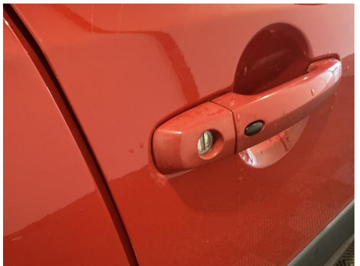
14: Door osf Scratched Over 25mm Thru Paint