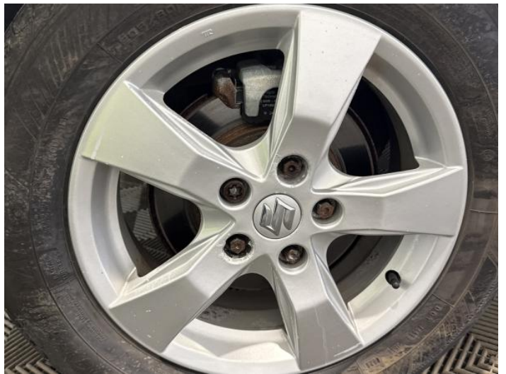
12: Wheel osr Scratched Over 50mm