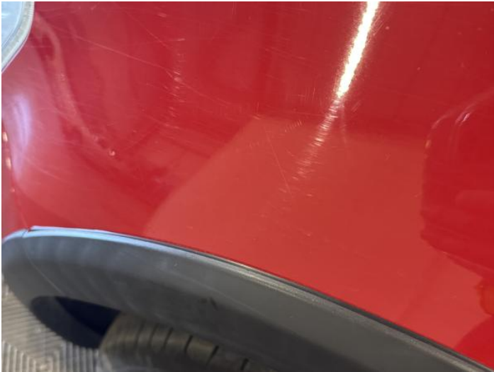
3: Wing nsf Scratched Over 25mm Thru Paint