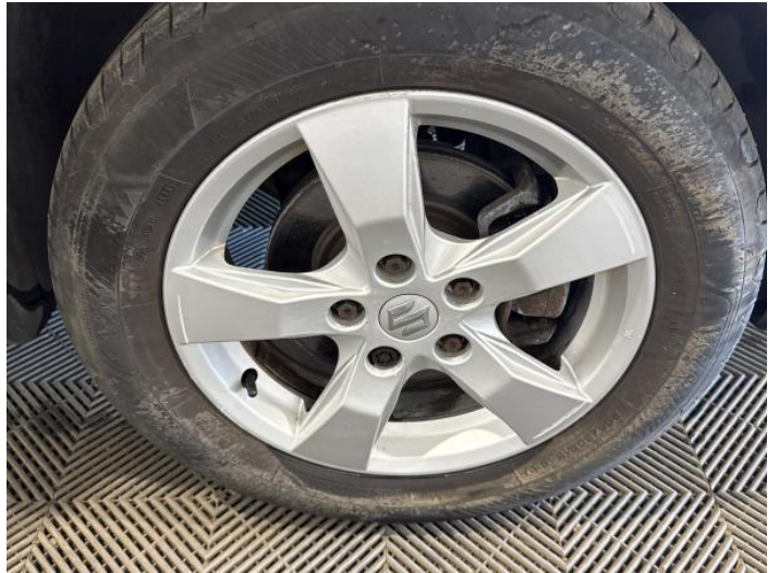
15: Wing of Chipped 1 To 5