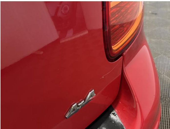
11: Tailgate Scratched Over 25mm Thru Paint