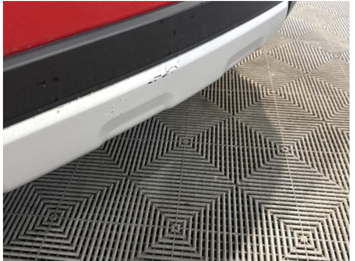
10: Bumper Rear Moulding Scratched (Painted) Over 25mm Thru Paint