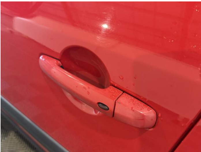
5: Handle Outer nsf Scratched (Painted) UpTo 25mm Thru Paint