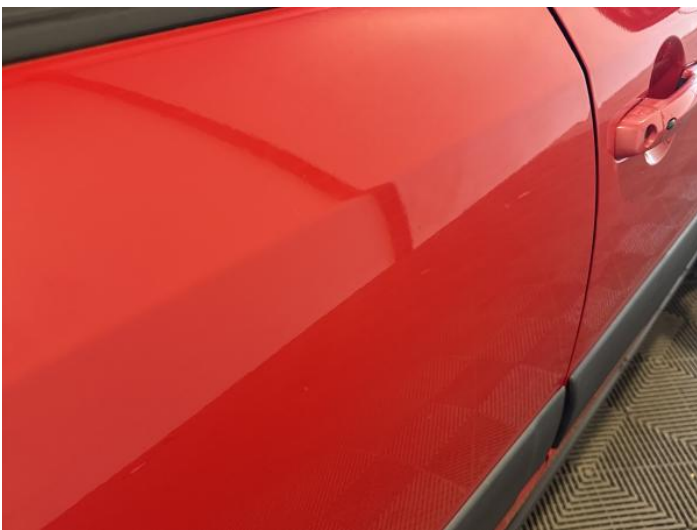
13: Door osr Dented Between 10mm + 30mm