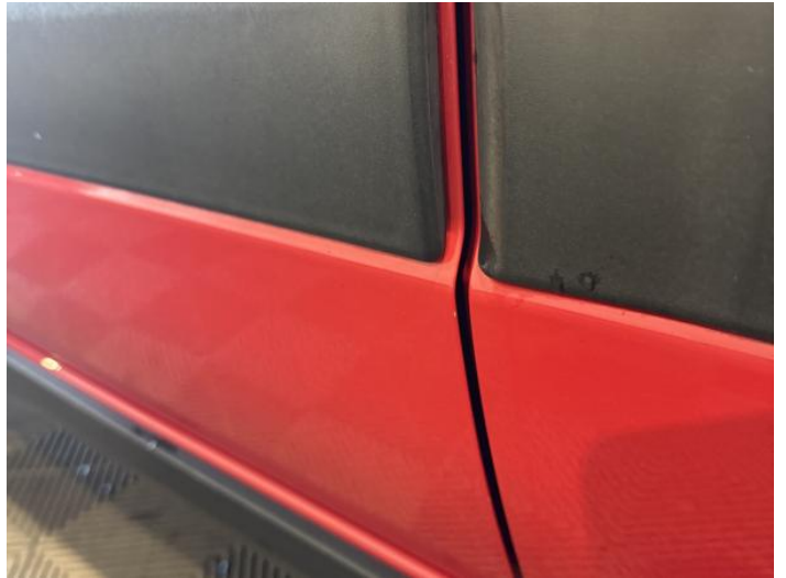
4: Door nsf Chipped Edge Chip