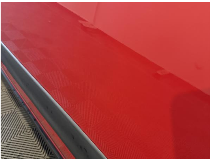
7: Door nsr Chipped 1 To 5