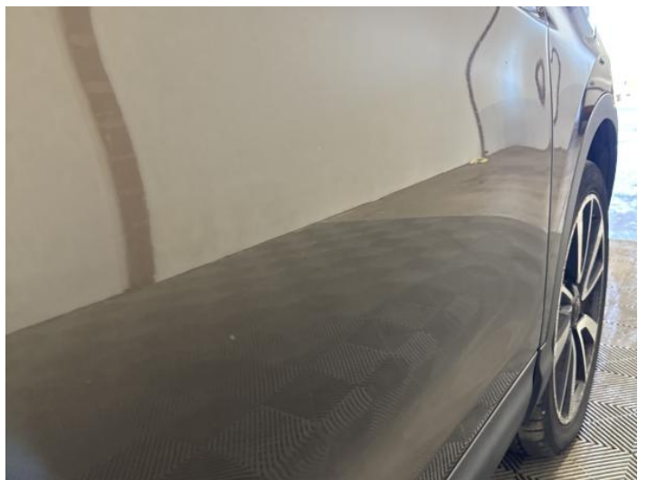
14: Door osf Dented Between 10mm + 30mm