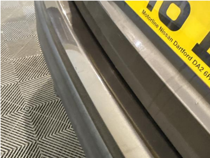
9: Bumper Rear Scratched 25 to 100mm Thru Paint