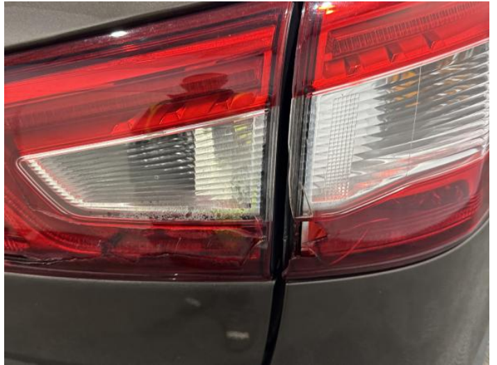
10: Lamp osr Broken Replace