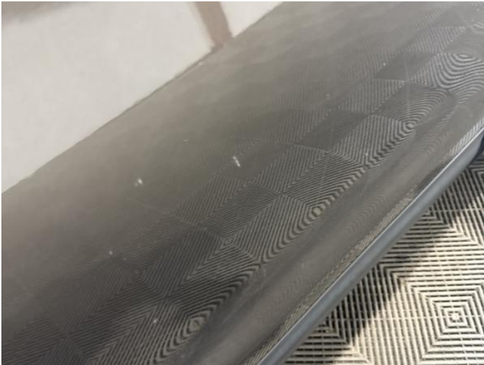
15: Door osf Scratched UpTo 25mm Thru Paint