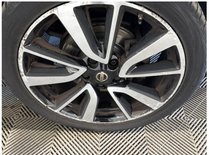
18: Wheel osf Scratched Over 50mm