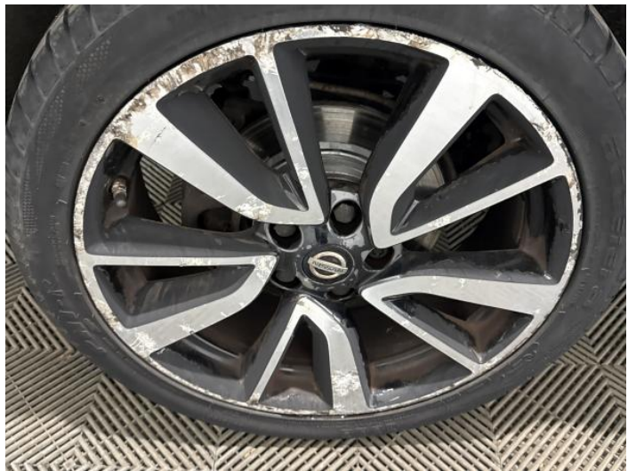
12: Wheel osr Scratched Over 50mm