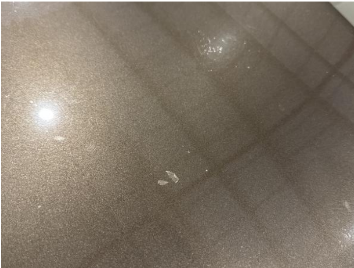
1: Bonnet Scratched Over 25mm Thru Paint