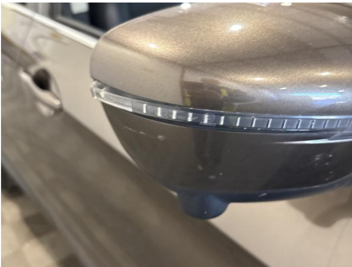
17: Door Mirror Assy osf Scratched (Painted) UpTo 25mm Thru Paint