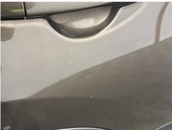
13: Door osr Chipped Multiple Chips