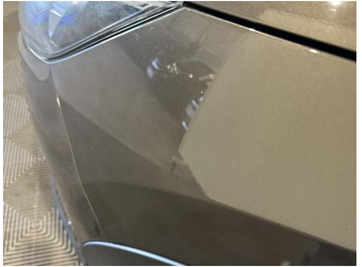
4: Wing nsf Chipped 1 To 5