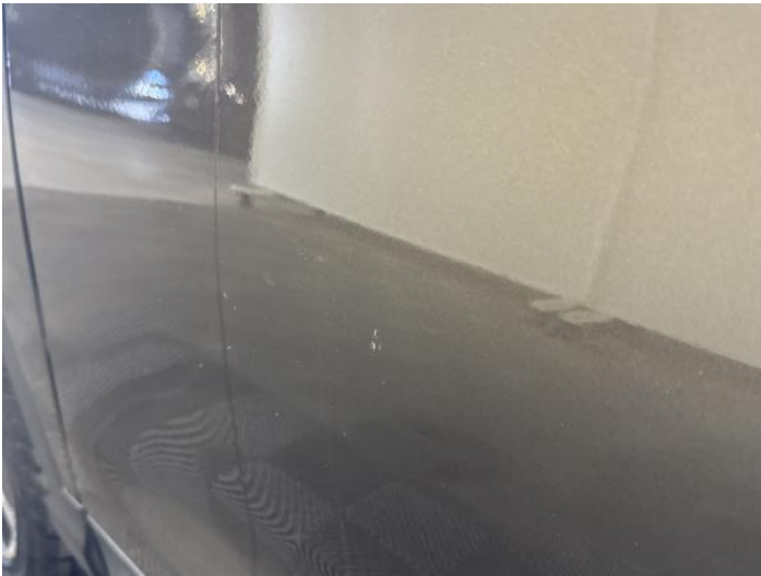
5: Door nsf Scratched Up To 25mm Thru Paint