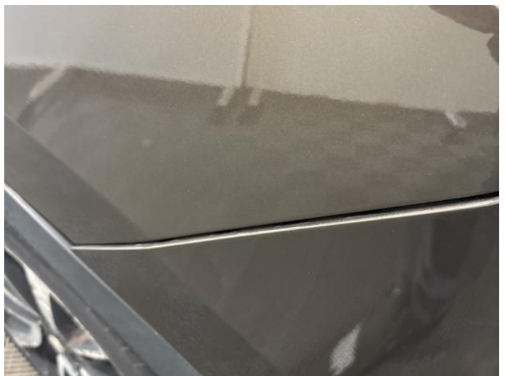
8: Bumper Rear Insecure Action Required