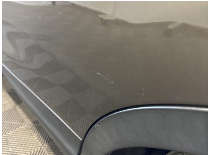
6: Door nsr Scratched Over 25mm Thru Paint