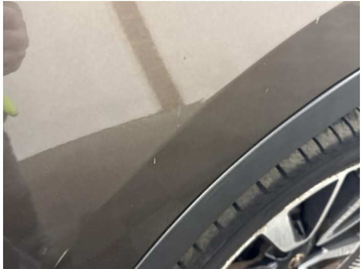
16: Wing osf Scratched UpTo 25mm Thru Paint