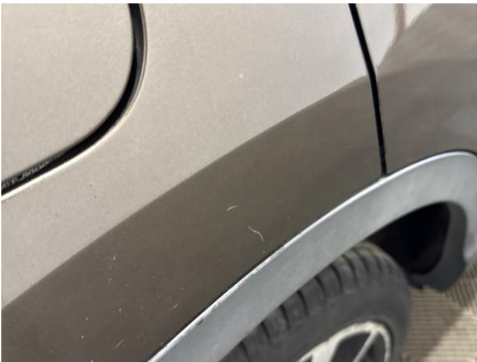
11: Qtr Panel osr Scratched UpTo 25mm Thru Paint