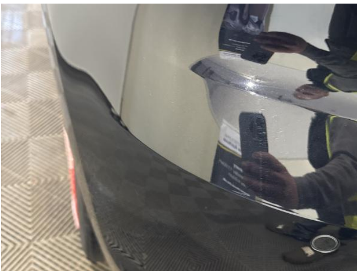
7: Bumper Rear Scratched 25 to 100mm Thru Paint