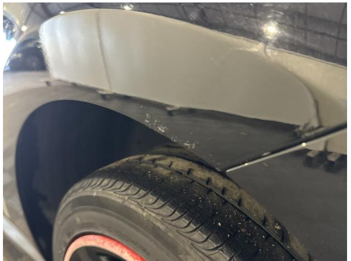
6: Qtr Panel nsr Rusted Over 5mm