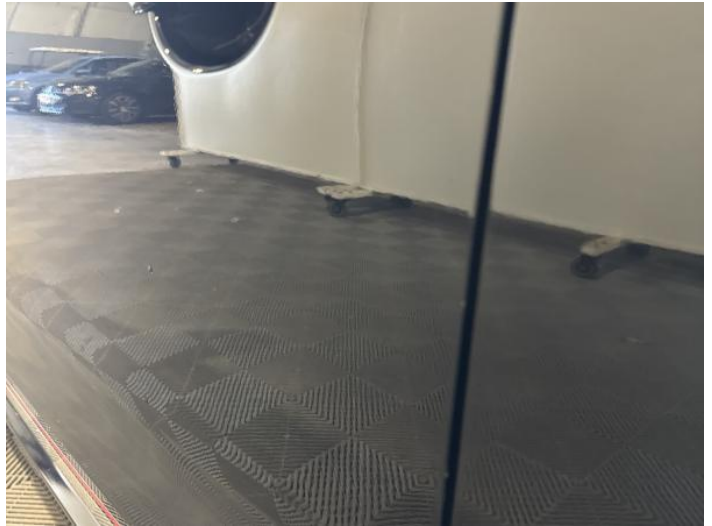
4: Door nsf Chipped Edge Chip