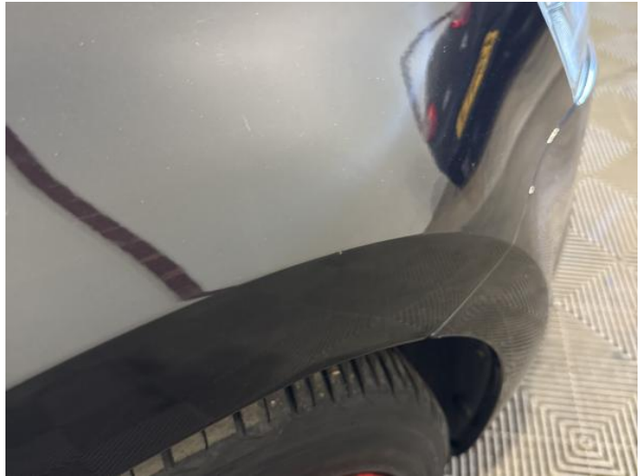
9: Door osf Scratched Over 25mm Thru Paint