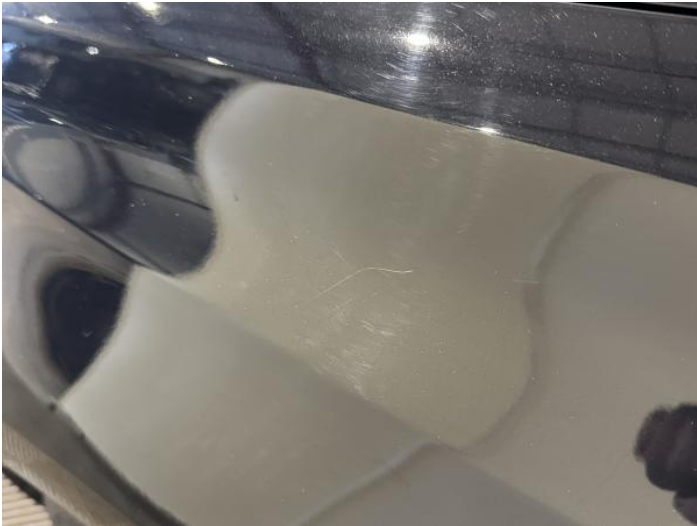
3: Wing nsf Scratched UpTo 25mm Thru Paint