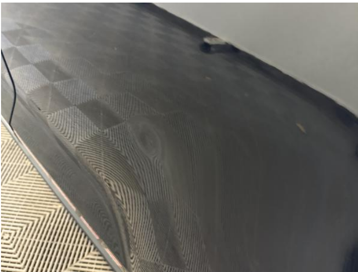
5: Qtr Panel nsr Dented Over 30mm