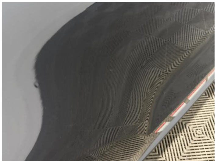
8: Qtr Panel osr Scratched UpTo 25mm Thru Paint