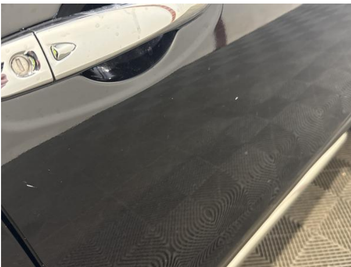
13: Door osf Chipped 1 To 5