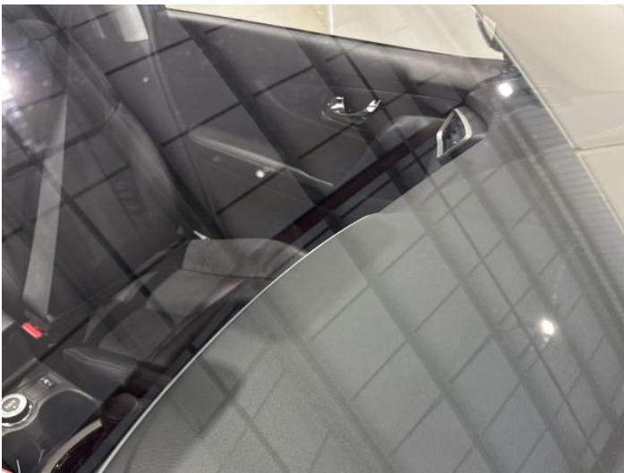
17: Screen Front Chipped Up To 10mm