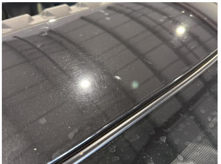
14: Roof Chipped 1 To 5