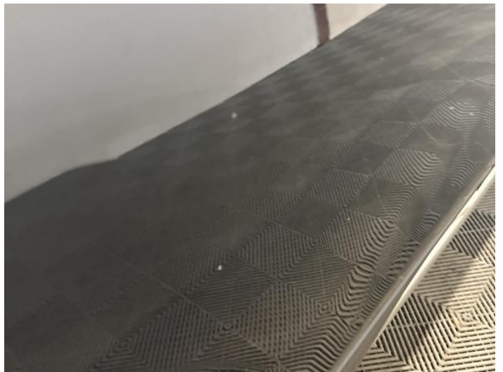
12: Door osr Chipped 1 To 5