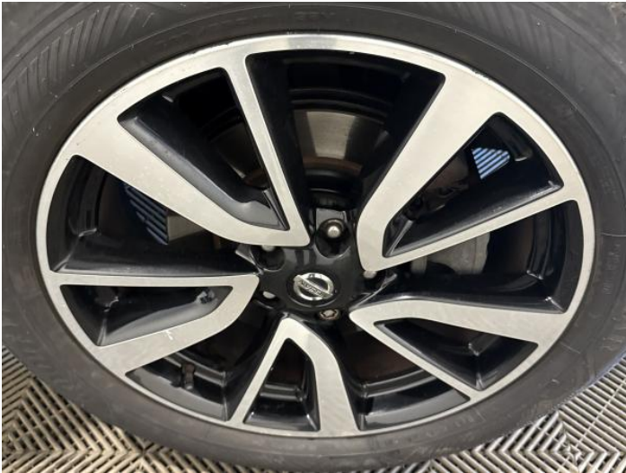
15: Wheel of Scratched Up To 50mm