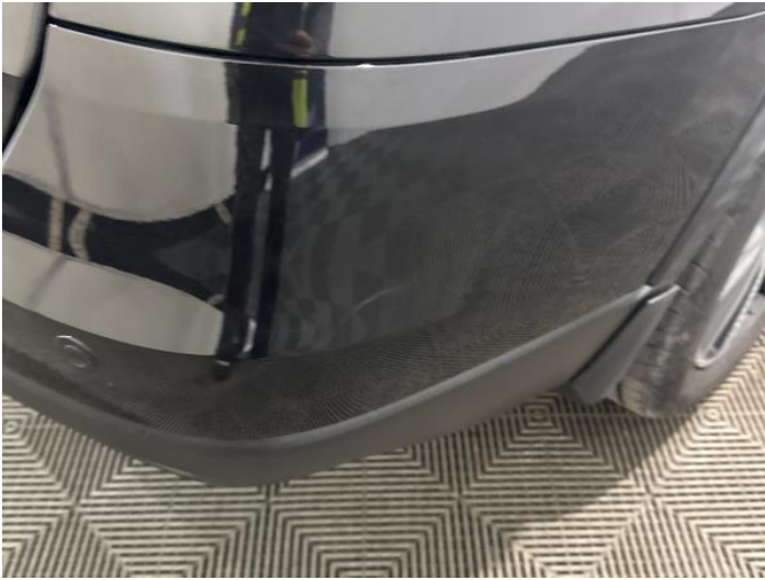
9: Bumper Rear Scratched 25 to 100mm Thru Paint