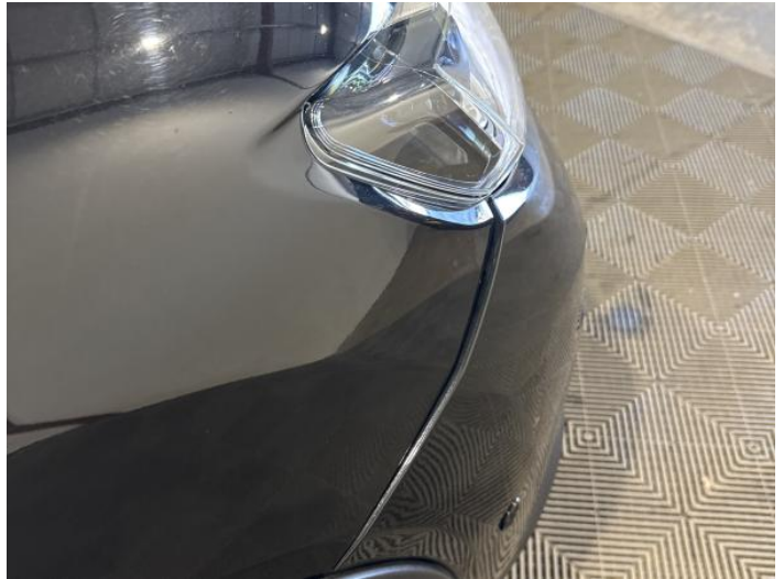
16: Bumper Front Insecure Action Required