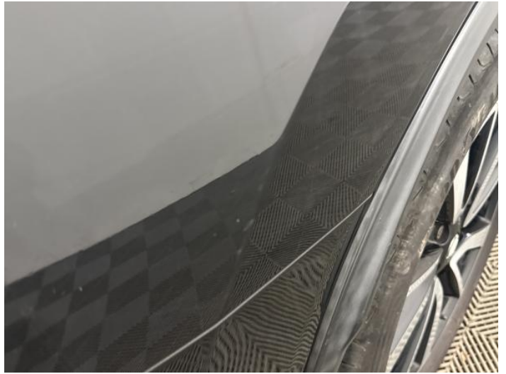
10: Qtr Panel osr Scratched UpTo 25mm Thru Paint