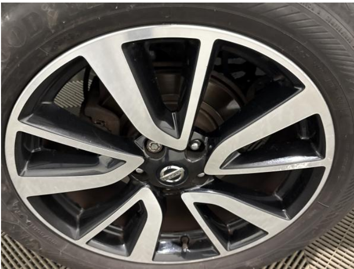
11: Wheel osr Scratched Over 50mm