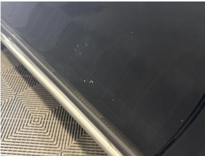
5: Door nsf Scratched Over 25mm Thru Paint