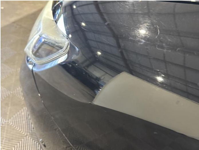
3: Wing nsf Chipped 1 To 5