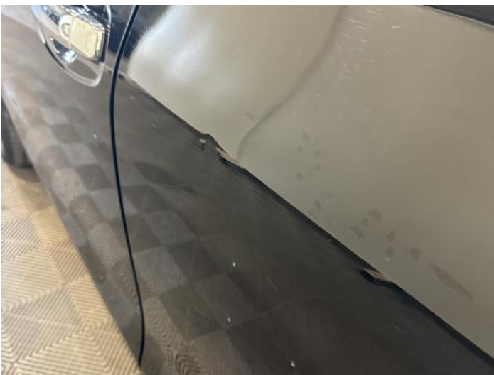
7: Door nsr Dented Over 30mm