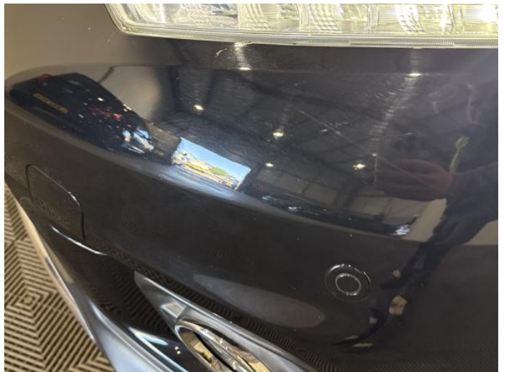
2: Bumper Front Chipped 1 To 5