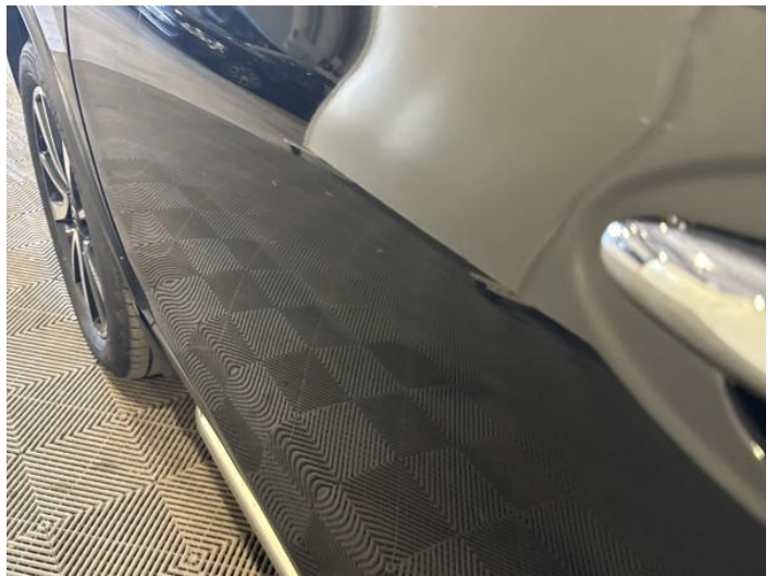
6: Door nsf Dented Between 10mm + 30mm