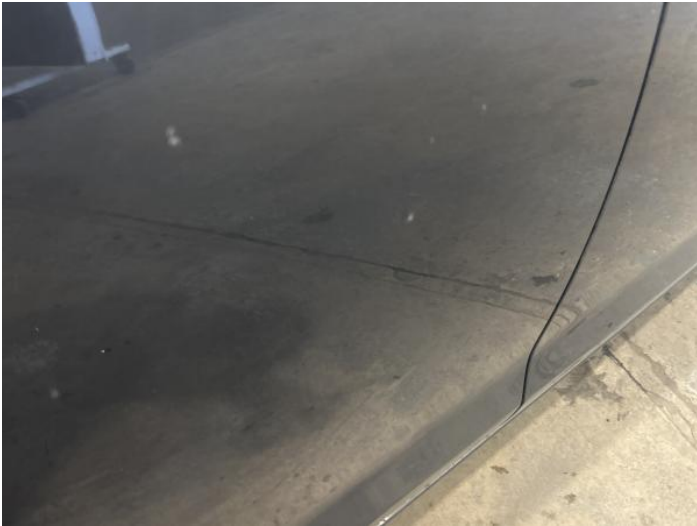
3: Door osr Chipped 1 To 5