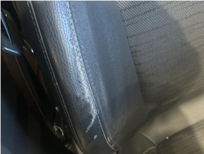
15: Seat Back Cover of Scuffed Over 25mm