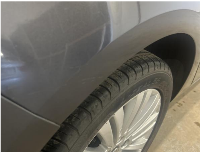
5: Qtr Panel osr Poor Previous Repair Poor Paint