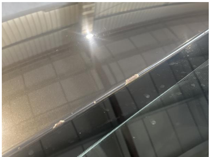
14: Roof Poor Previous Repair Paint Flake