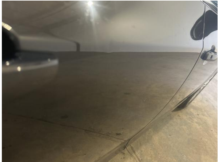
4: Door osr Dented 2 Or Less UpTo 10mm