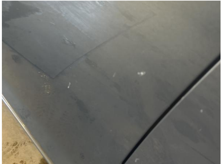
10: Door nsf Chipped 1 To 5