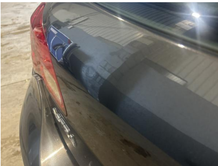
7: Tailgate Dented 2 Or Less UpTo 10mm