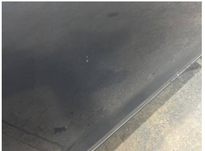
2: Door osf Chipped 1 To 5