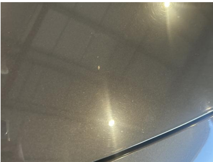
13: Bonnet Chipped 1 To 5