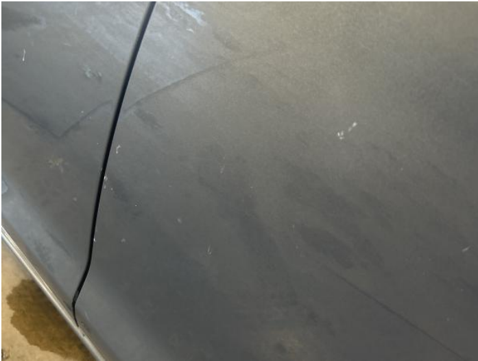
9: Door nsr Chipped Multiple Chips