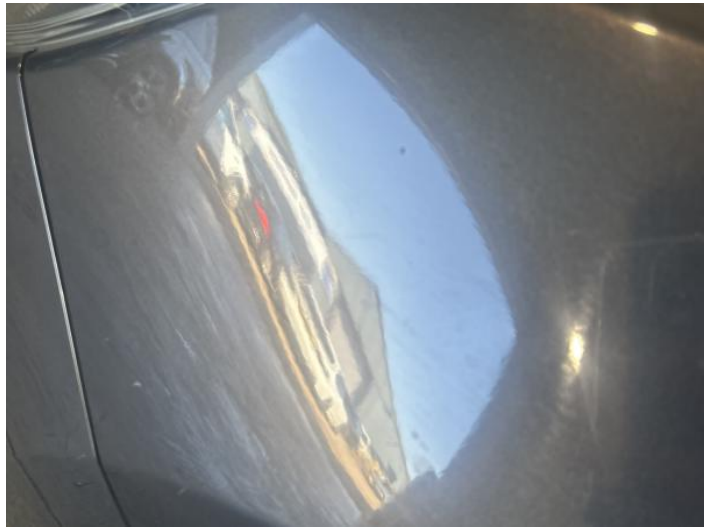
12: Wing nsf Chipped 1 To 5