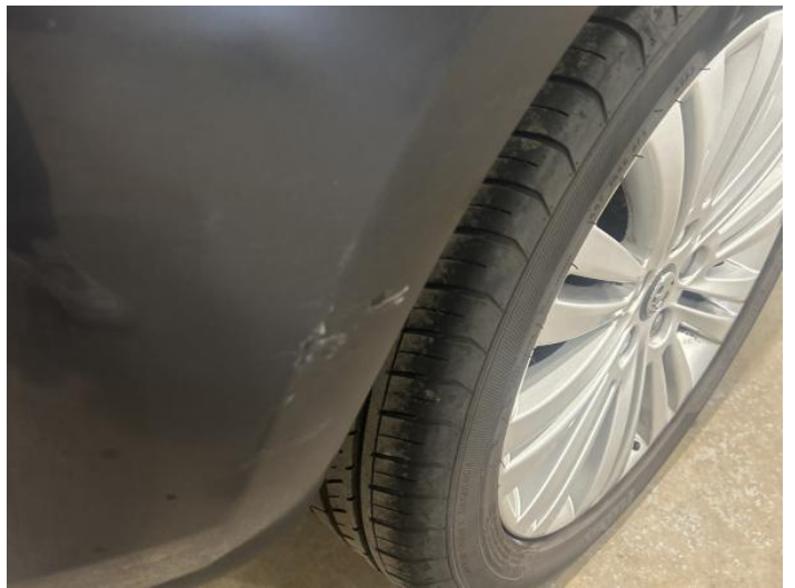
6: Bumper Rear Poor Previous Repair Poor Paint