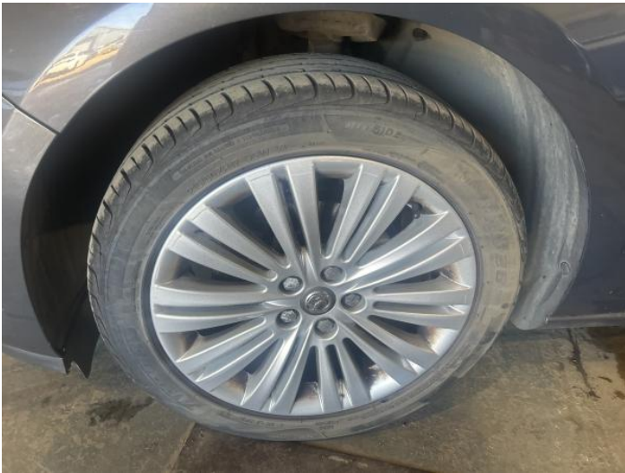
11: Wheel nsf Scratched Over 50mm