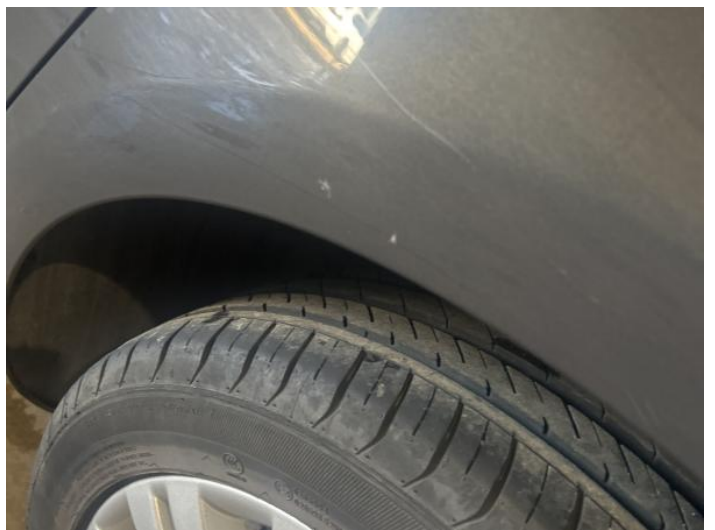
8: Qtr Panel nsr Chipped 1 To 5