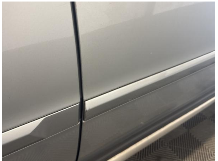
12: Door osf Chipped Edge Chip