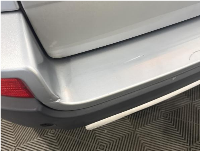
9: Bumper Rear Dented With Paint Damage