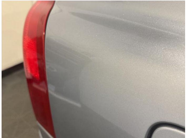
10: Qtr Panel osr Scratched Over 25mm Thru Paint