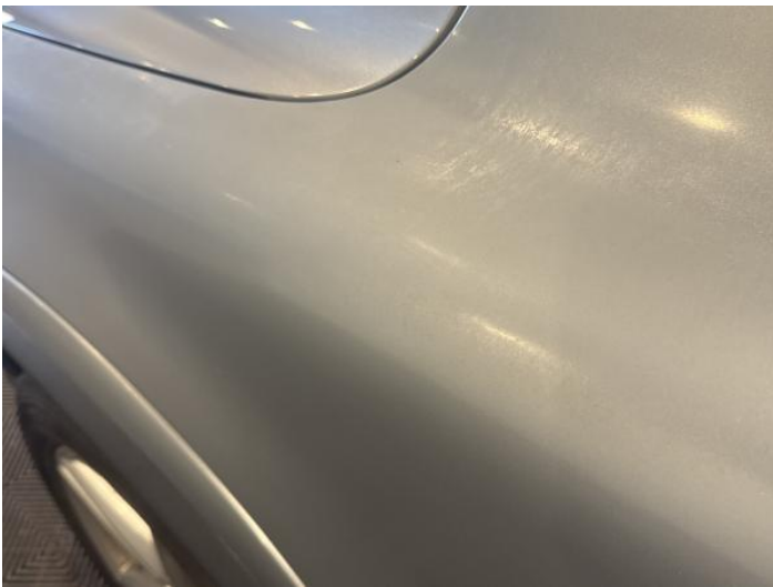
5: Wing nsf Scratched Over 25mm Thru Paint