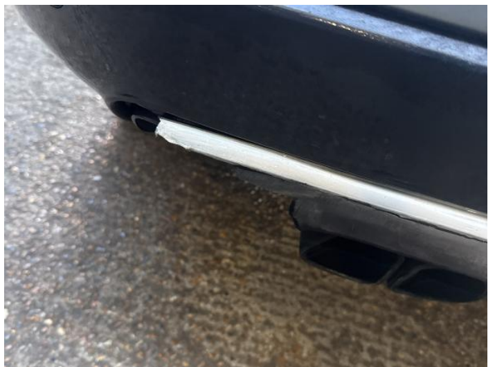
14: Bumper Rear Moulding Broken Replace