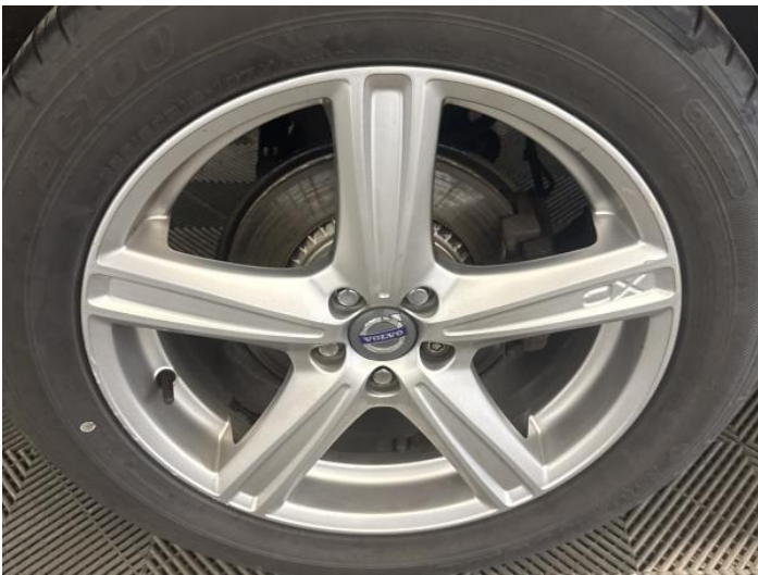
11: Wheel osr Scratched Over 50mm