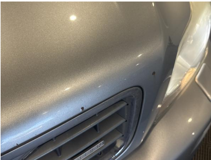
1: Bonnet Rusted Over 5mm