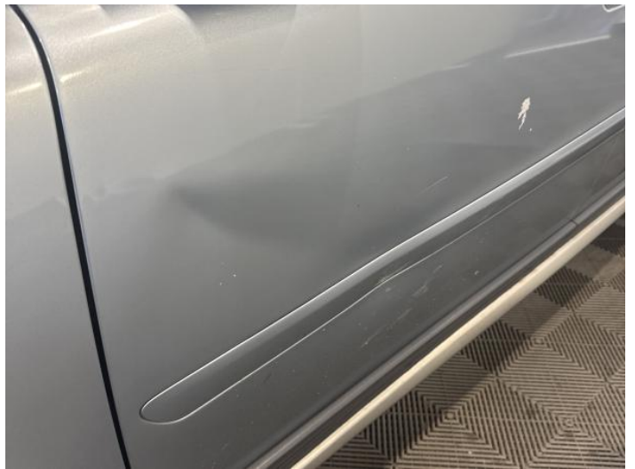
6: Door nsf Dented With Paint Damage