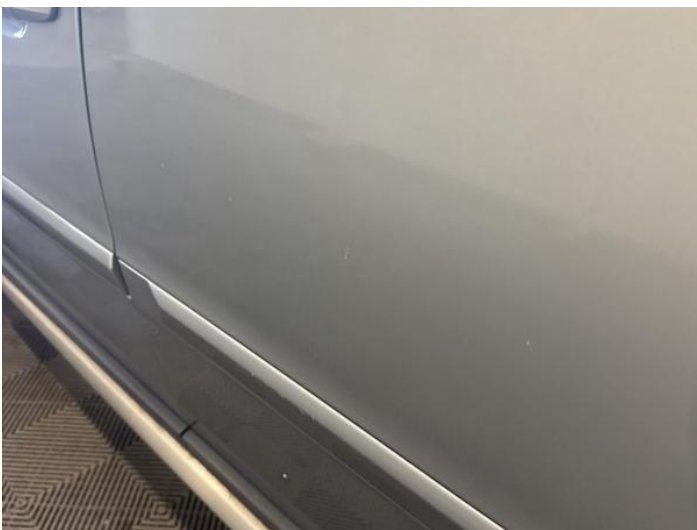
7: Door nsr Chipped Multiple Chips