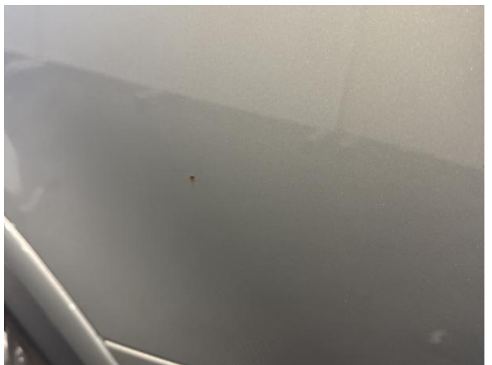
8: Qtr Panel nsr Chipped 1 To 5