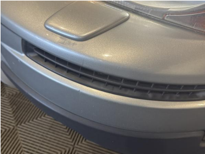
3: Bumper Front Scratched 25 to 100mm Thru Paint