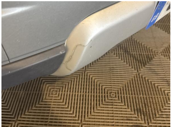
2: Bumper Front Moulding Broken Replace