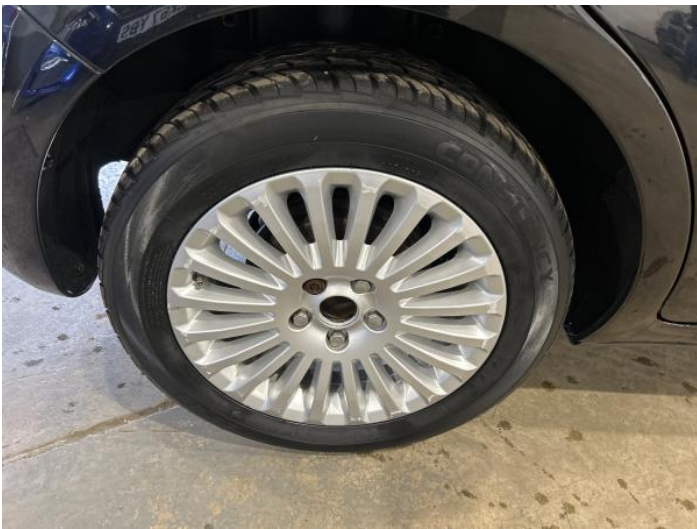
5: Wheel osr Scratched Over 50mm