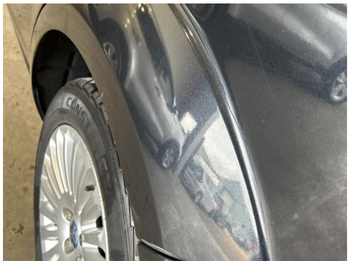
8: Qtr Panel nsr Poor Previous Repair Poor Paint