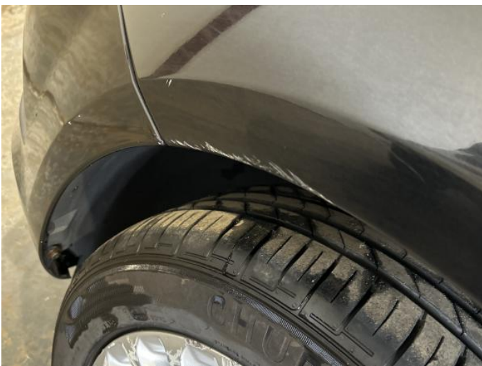
13: Wing nsf Scratched Over 25mm Thru Paint