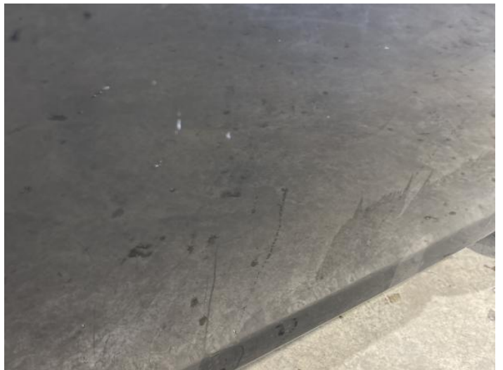
2: Door osf Chipped 1 To 5