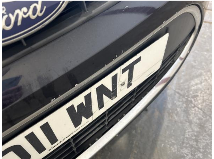
16: Bumper Front Chipped Multiple Chips