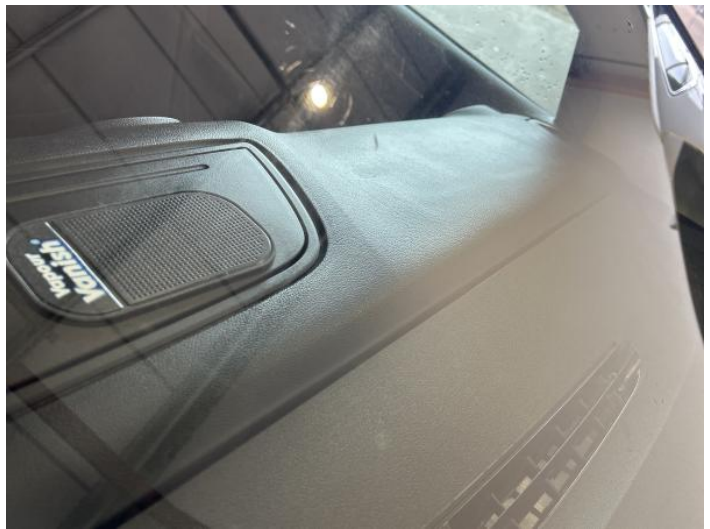
18: Screen Front Chipped UpTo 10mm