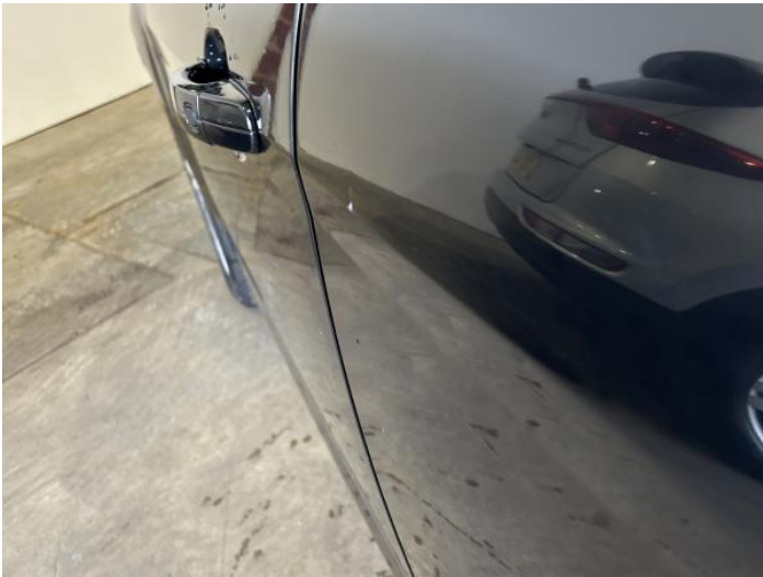
11: Door nsr Dented 2 Or Less UpTo 10mm