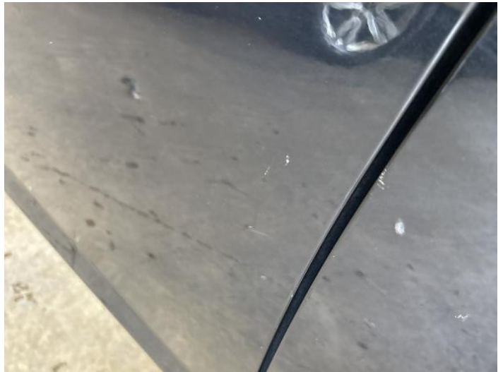
12: Door nsf Chipped 1 To 5