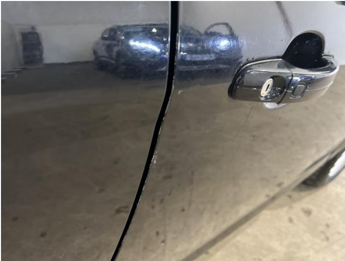
3: Door osf Chipped Edge Chip