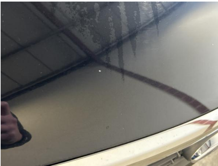
17: Bonnet Chipped 1 To 5