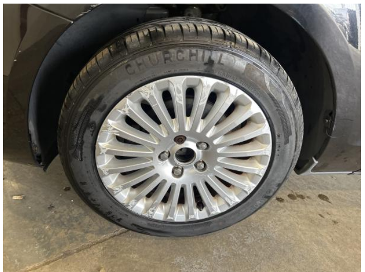
14: Wheel nsf Scratched Over 50mm