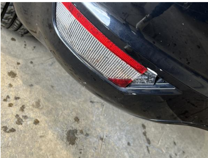
7: Reflector nsr Broken Replace