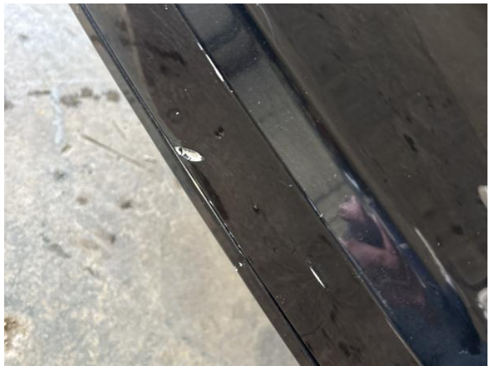
6: Bumper Rear Dented With Paint Damage