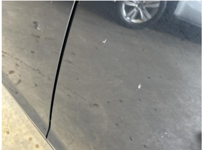
10: Door nsr Chipped 1 To 5