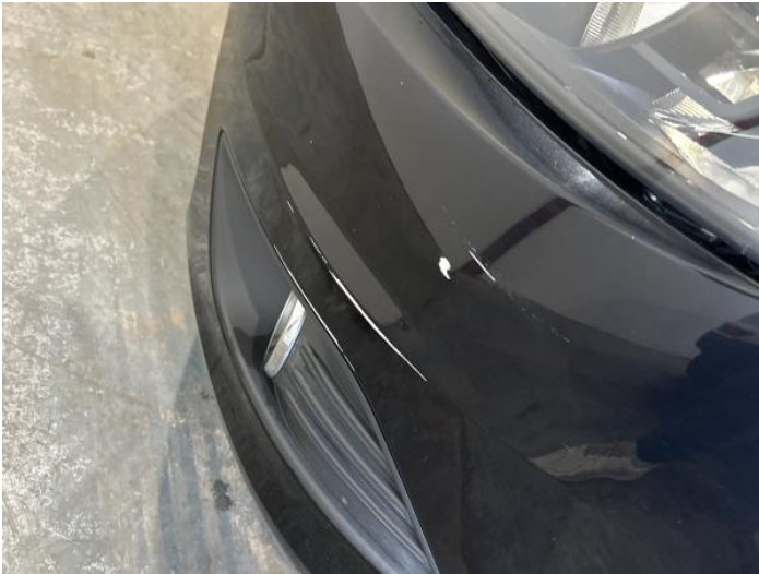
15: Bumper Front Scratched 25 to 100mm Thru Paint