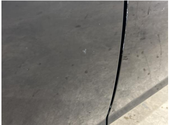
4: Door osr Chipped 1 To 5