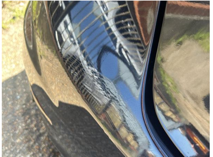
4: Bumper Rear Poor Previous Repair Poor Paint