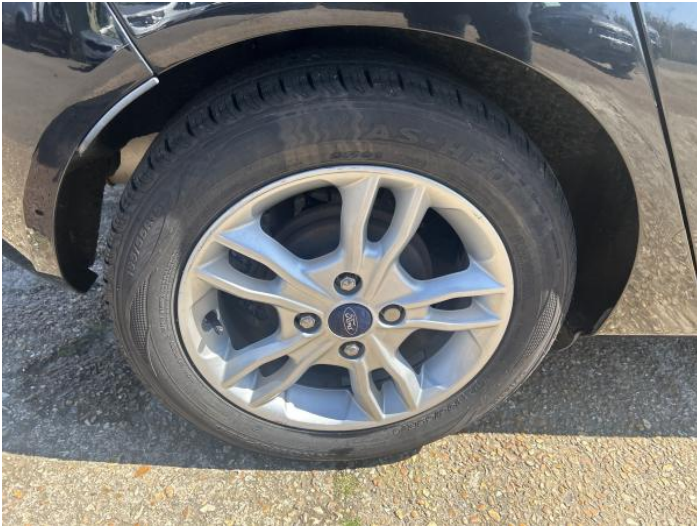
3: Wheel osr Scratched Over 50mm