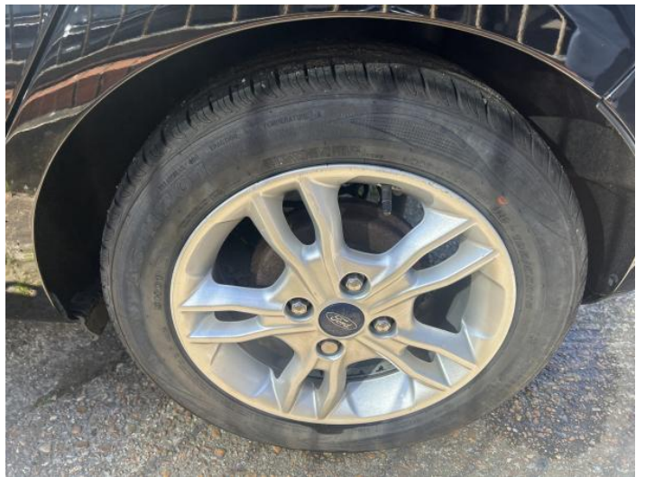
6: Wheel nsr Scratched Over 50mm