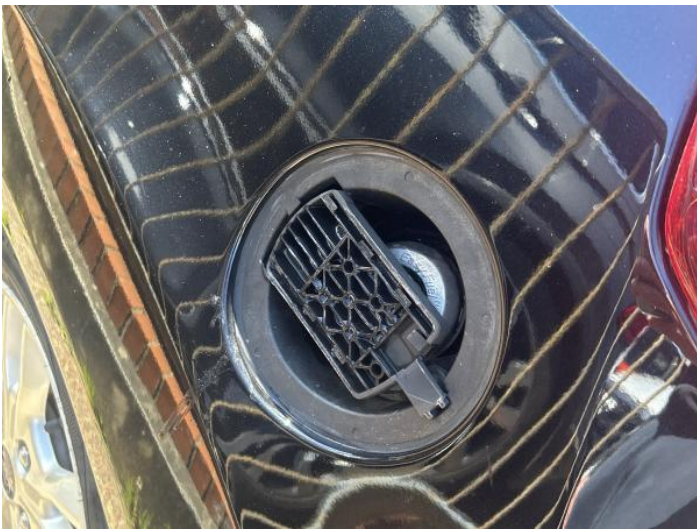
5: Fuel Flap Missing Replace