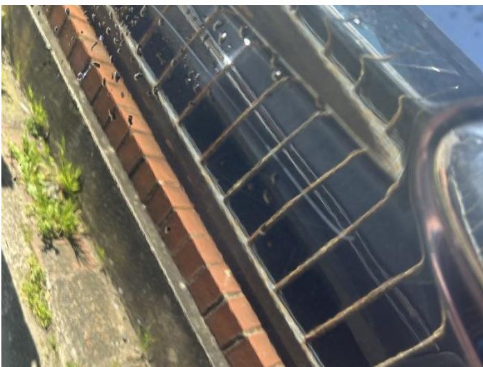
7: Door nsr Scratched Over 25mm Thru Paint