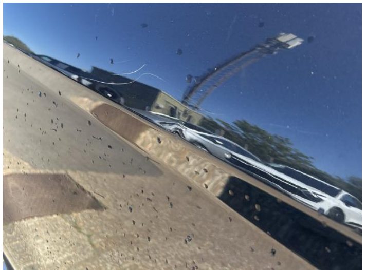
2: Door osr Dented With Paint Damage