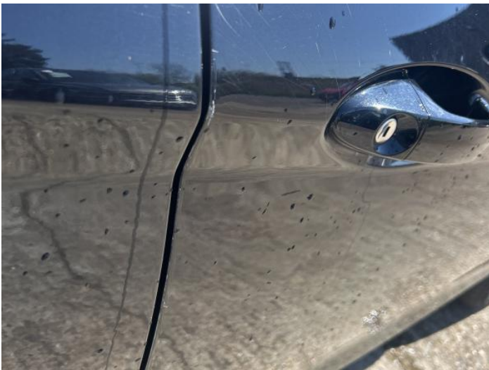
1: Door osf Chipped Edge Chip