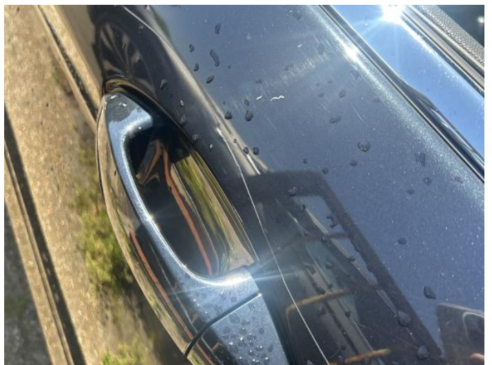
8: Door nsf Scratched Over 25mm Thru Paint