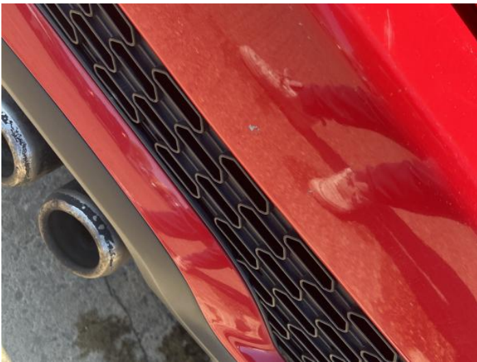
5: Bumper Rear Chipped 1 To 5