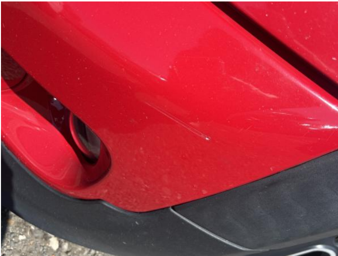
11: Bumper Front Scratched 25 to 100mm Thru Paint