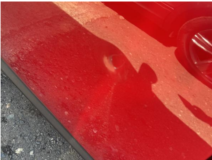
1: Door osf Dented With Paint Damage