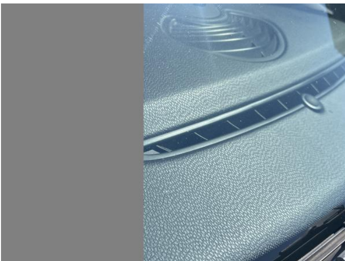
13: Screen Front Chipped Up To 10mm