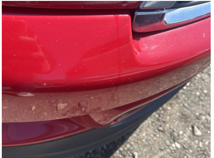
12: Bumper Front Chipped Multiple Chips