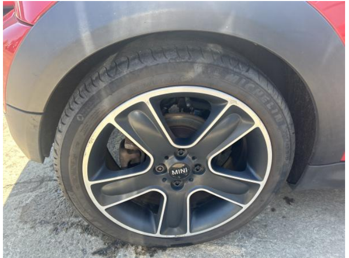
4: Wheel osr Corroded Light