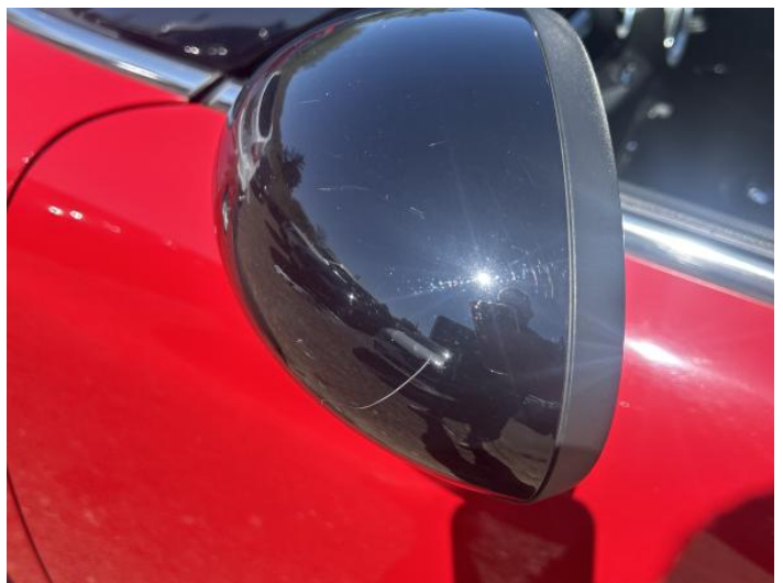
8: Door Mirror Assy nsf Scratched (Painted) Over 25mm Thru Paint