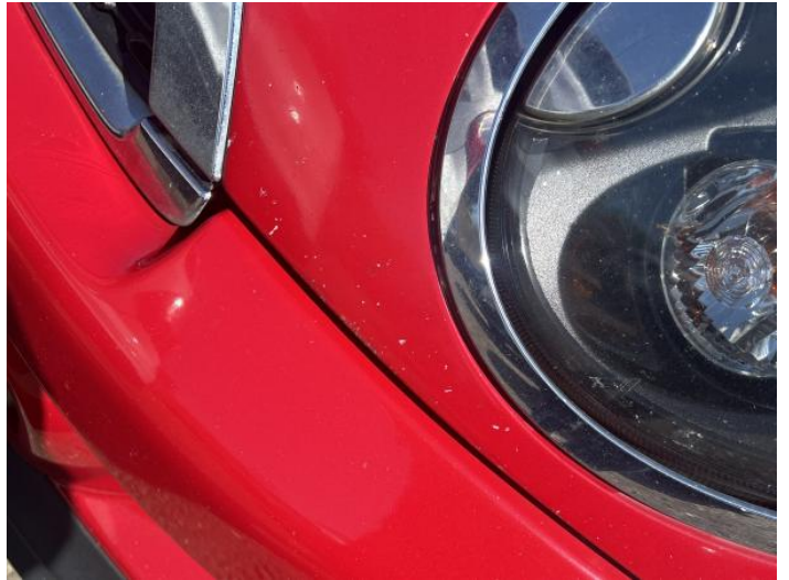
10: Bonnet Chipped Multiple Chips