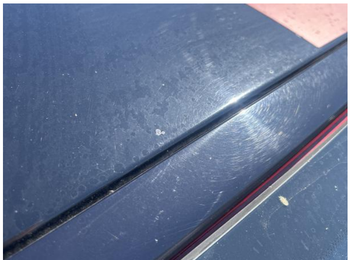
14: Roof Chipped 1 To 5