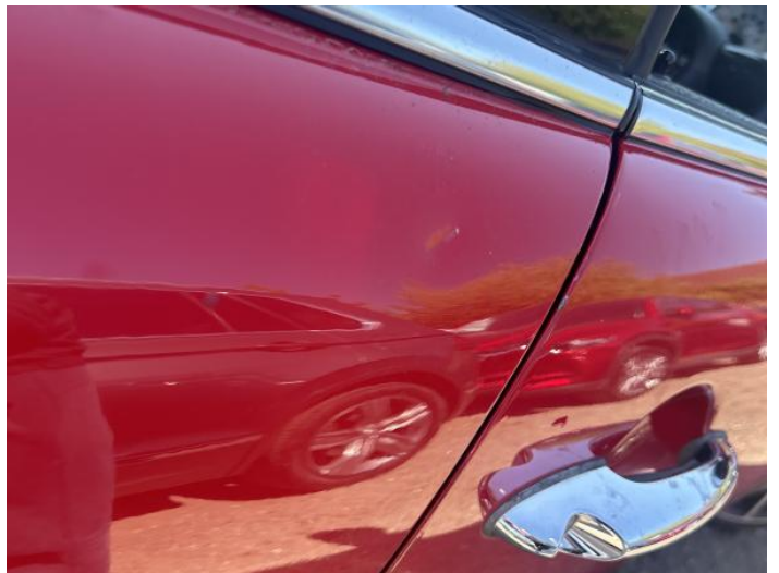
2: Qtr Panel osr Dented 2 Or Less UpTo 10mm