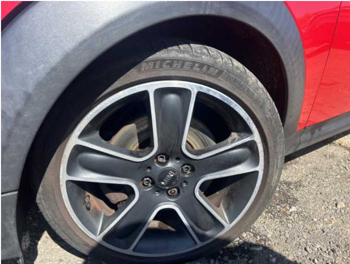
9: Wheel nsf Scratched Over 50mm