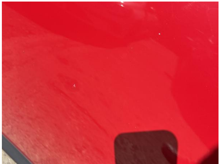
6: Qtr Panel nsr Chipped 1 To 5