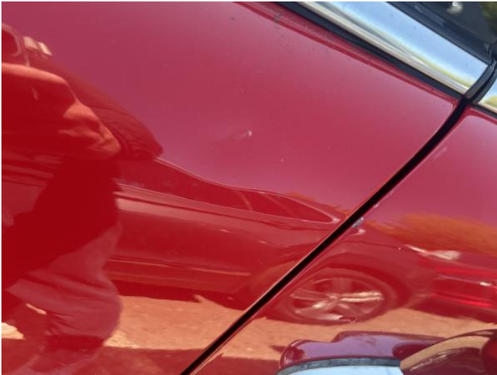
3: Qtr Panel osr Chipped 1 To 5