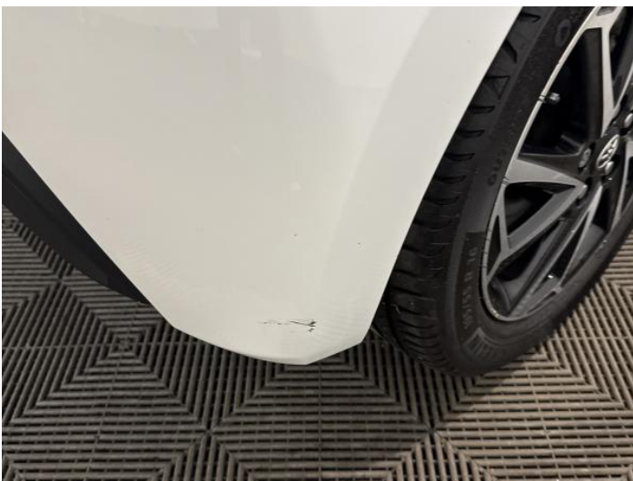
7: Bumper Rear Scratched 25 to 100mm Thru Paint