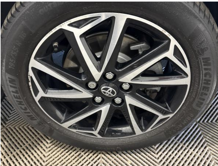
11: Wheel osf Scratched Over 50mm