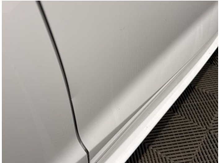
10: Door osf Dented Between 10mm + 30mm