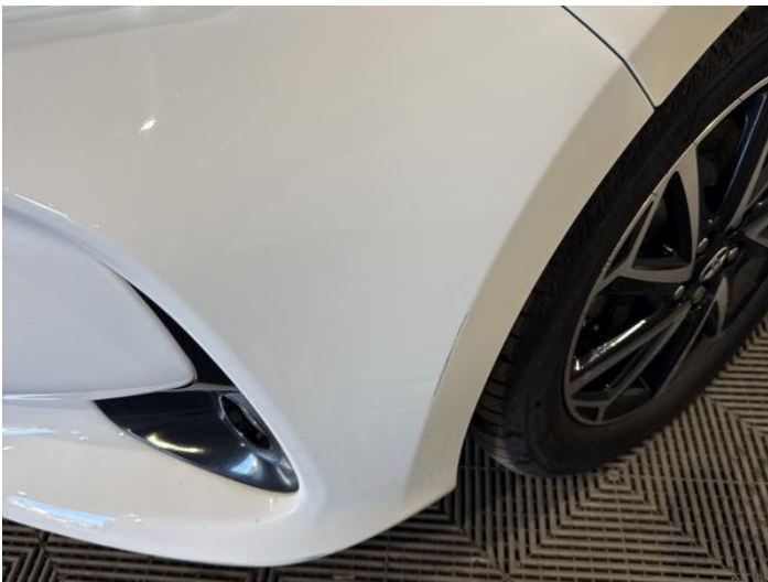
1: Bumper Front Scratched 25 to 100mm Thru Paint