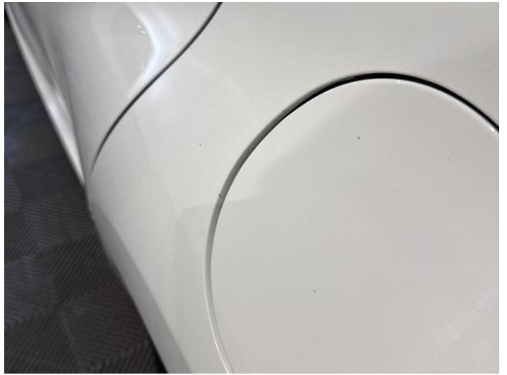
6: Qtr Panel nsr Chipped 1 To 5