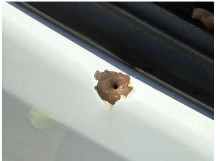
12: Door osr Hole Over 10mm