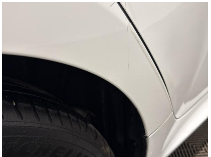
8: Qtr Panel osr Scratched Over 25mm Thru Paint