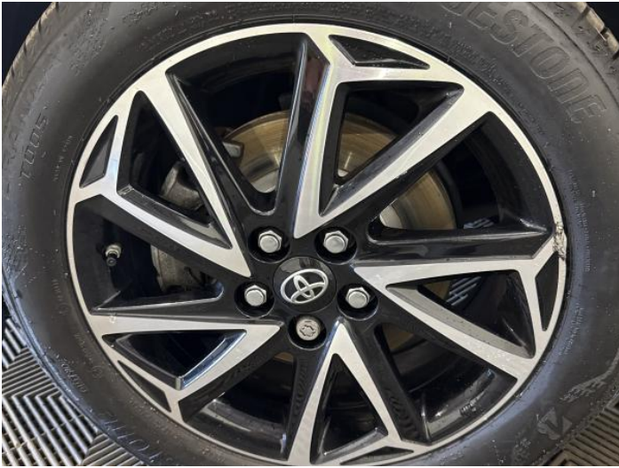
3: Wheel nsf Dented UpTo 30mm (Alloy)