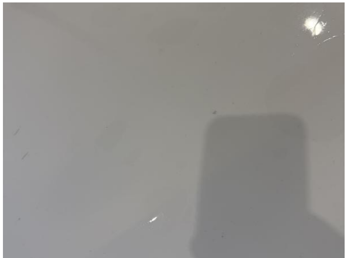
2: Bumper Front Chipped 1 To 5