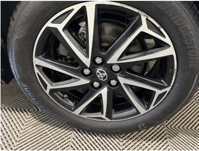
5: Wheel nsr Scratched Over 50mm