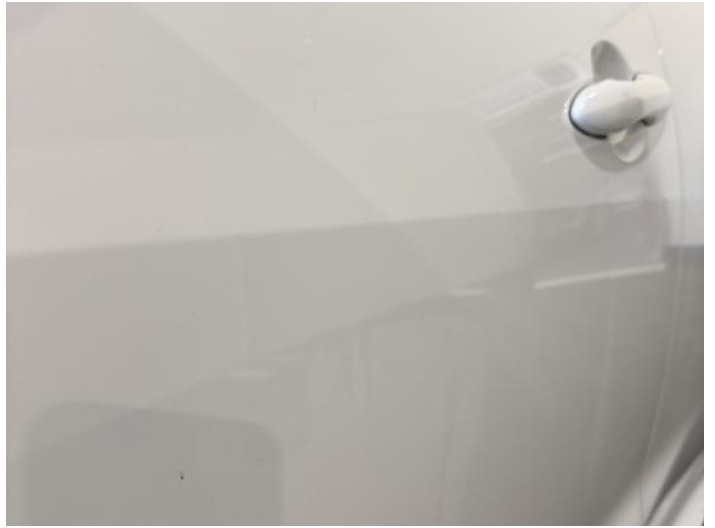
4: Door nsf Dented Between 10mm + 30mm