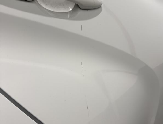
9: Door osr Scratched Over 25mm Thru Paint