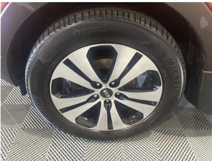
7: Wheel nsf Corroded Light