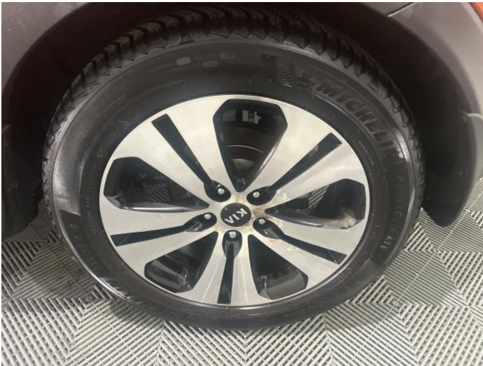
5: Wheel nsr Corroded Light