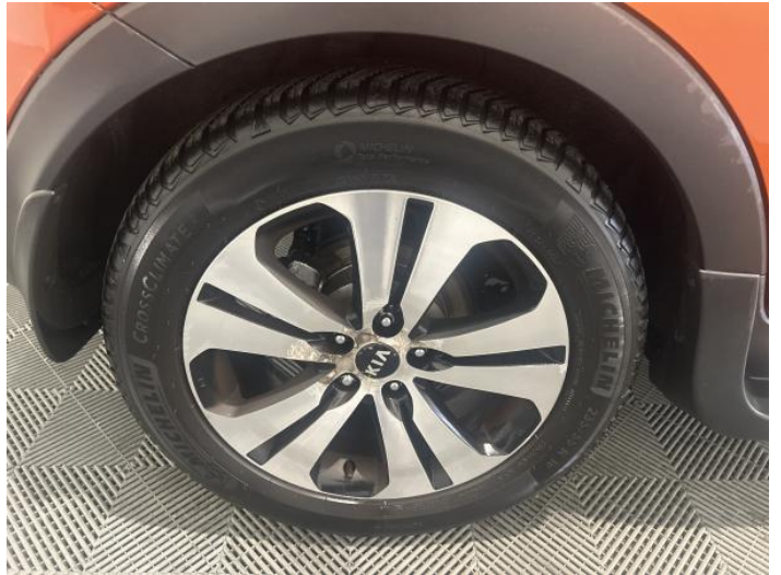
4: Wheel osr Corroded Light