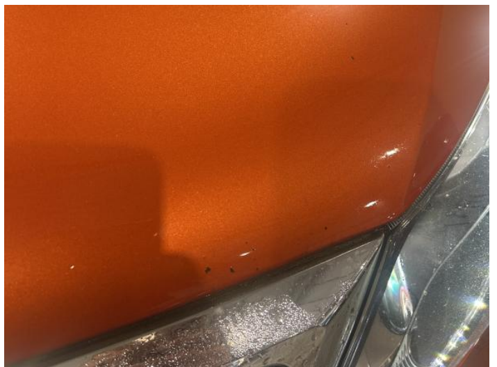
8: Bonnet Chipped 1 To 5