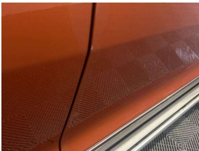
1: Door osf Chipped Edge Chip