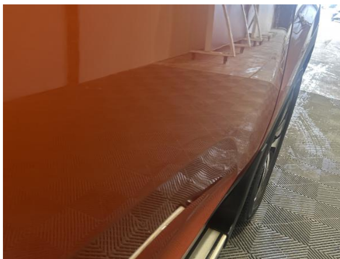
2: Door osf Dented 2 Or Less UpTo 10mm