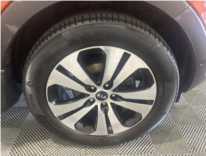
3: Wheel osf Corroded Light