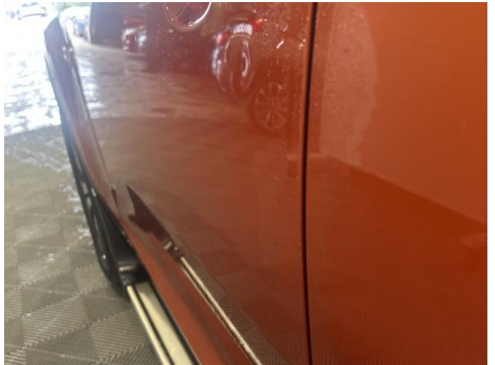
6: Door nsf Dented Between 10mm + 30mm