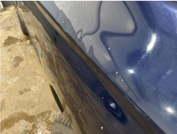
1: Wing osf Dented With Paint Damage