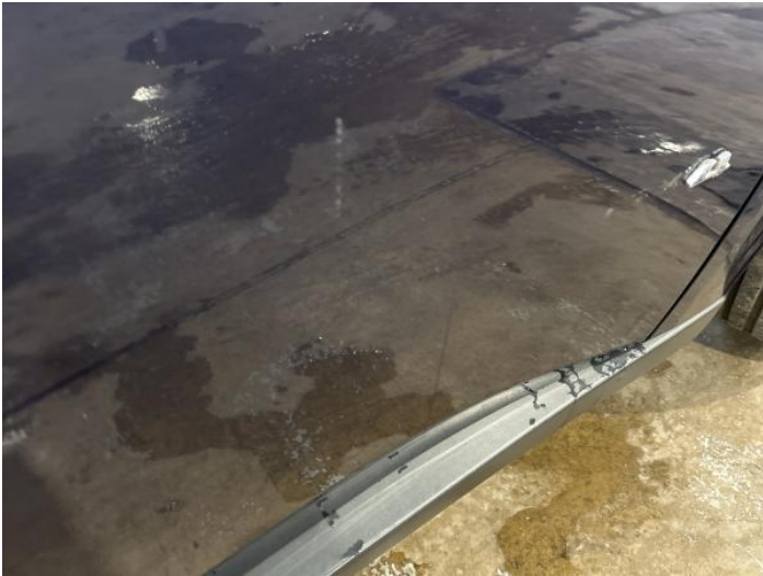
3: Door osf Scratched Up To 25mm Thru Paint