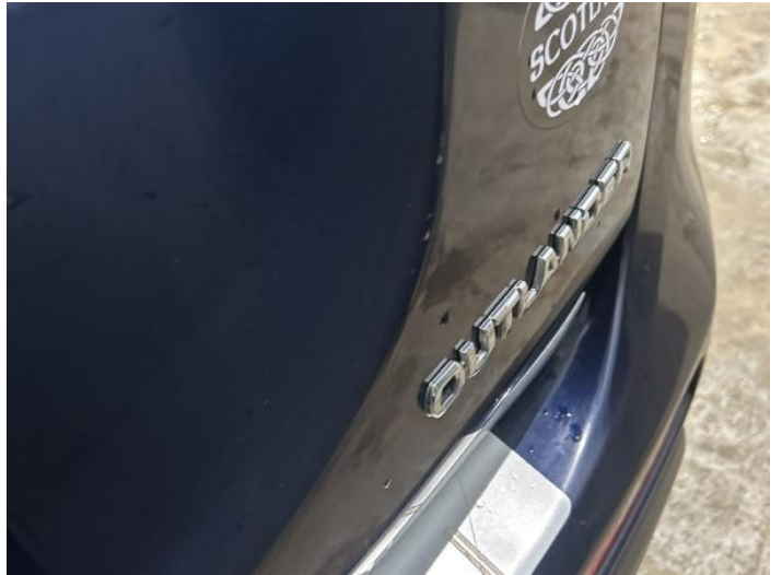
10: Tailgate Chipped 1 To 5