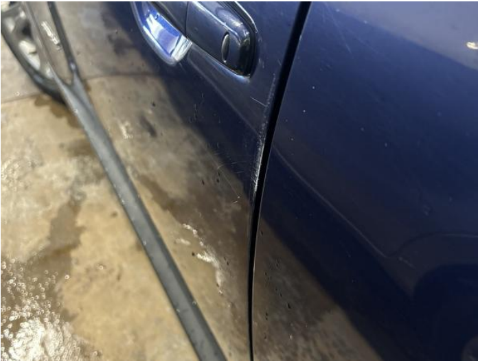
15: Door nsf Chipped Edge Chip