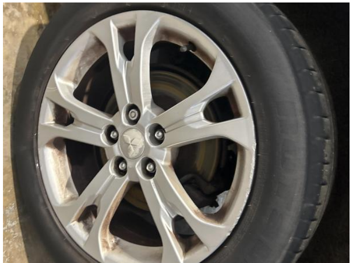
12: Wheel nsr Scratched Over 50mm