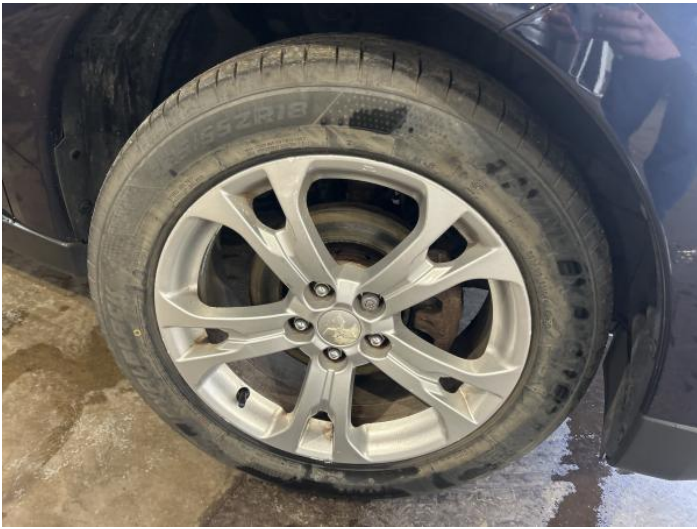
23: Wheel ofsf Scratched Over 50mm