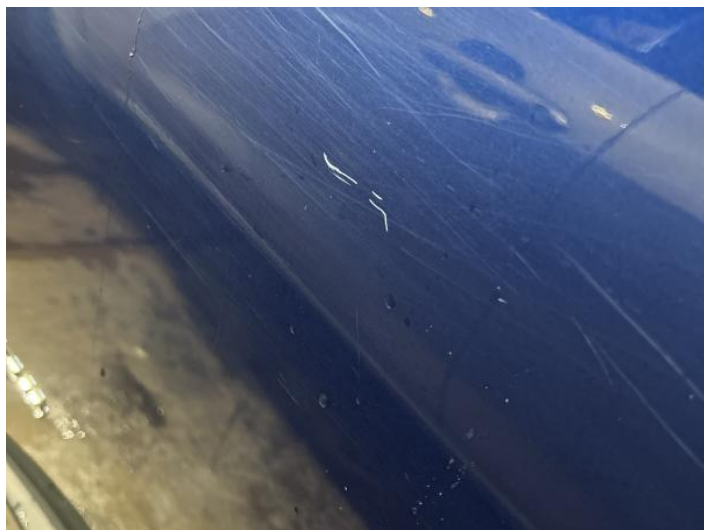
14: Door nsf Scratched Up To 25mm Thru Paint