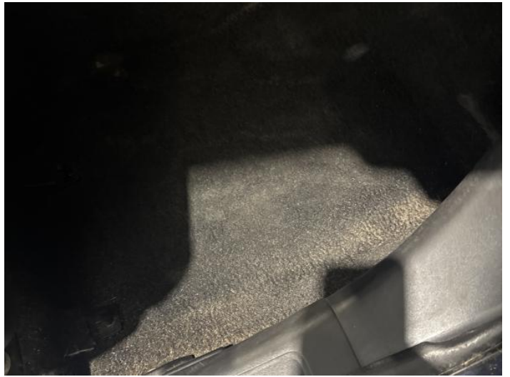
24: Carpets Front Soiled Light