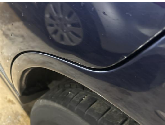
13: Door nsr Dented With Paint Damage