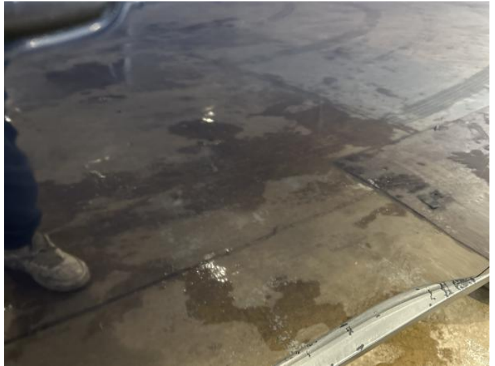
4: Door osf Chipped 1 To 5