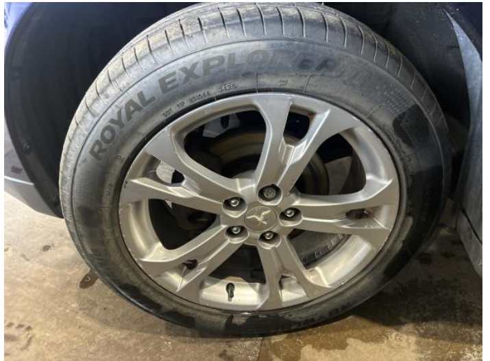
18: Wheel nsf Scratched Over 50mm