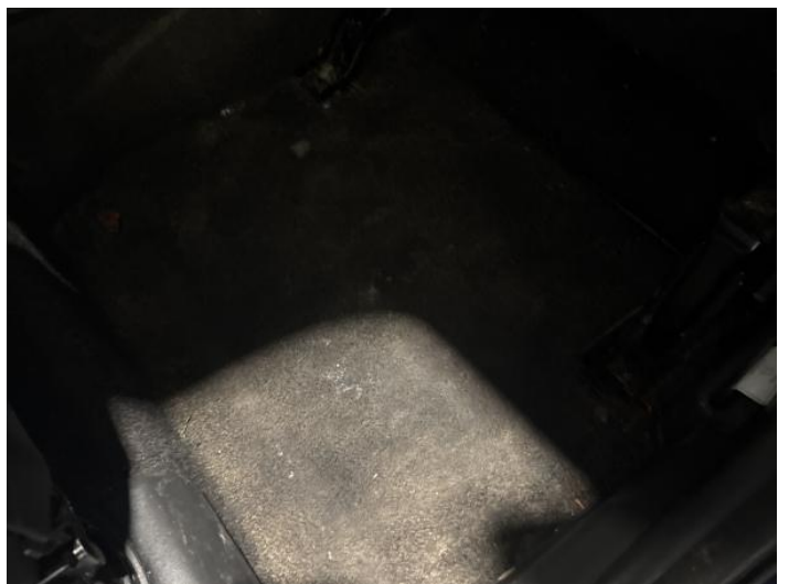
26: Carpets Rear Soiled Heavy