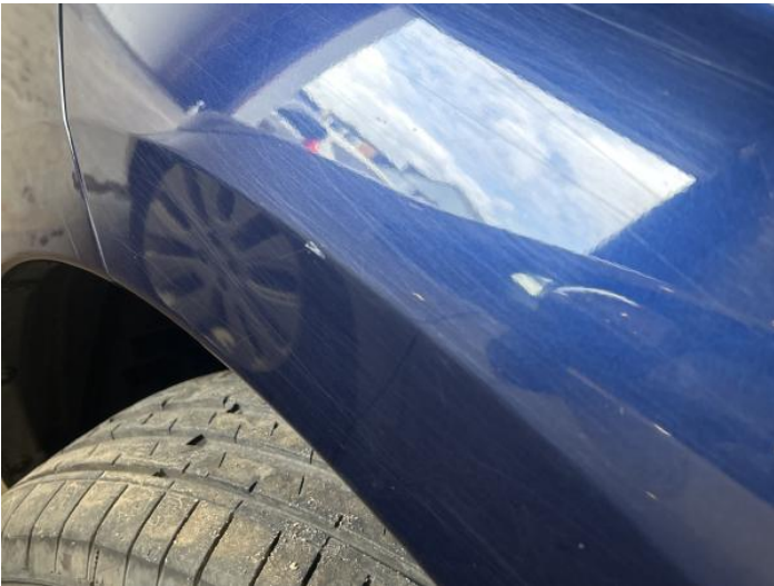
17: Wing nsf Chipped 1 To 5