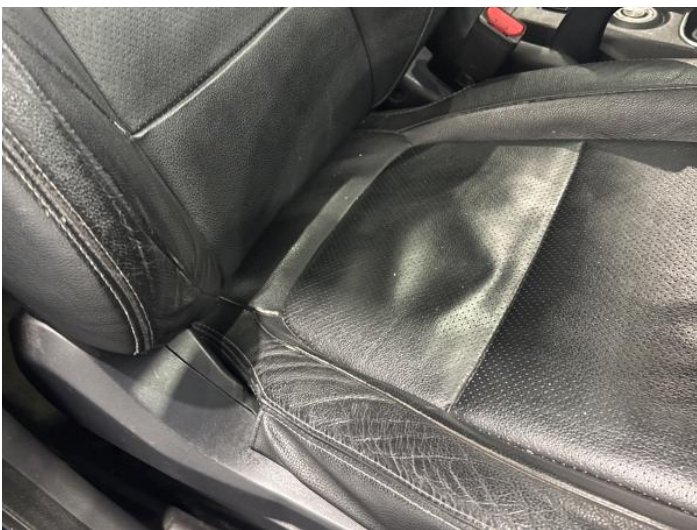
25: Seat Back Cover ofsf Scuffed Over 25mm