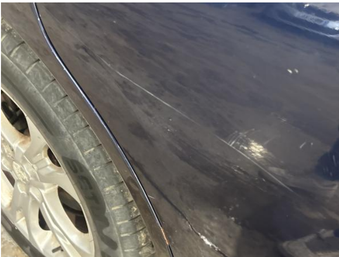
5: Door osr Dented With Paint Damage