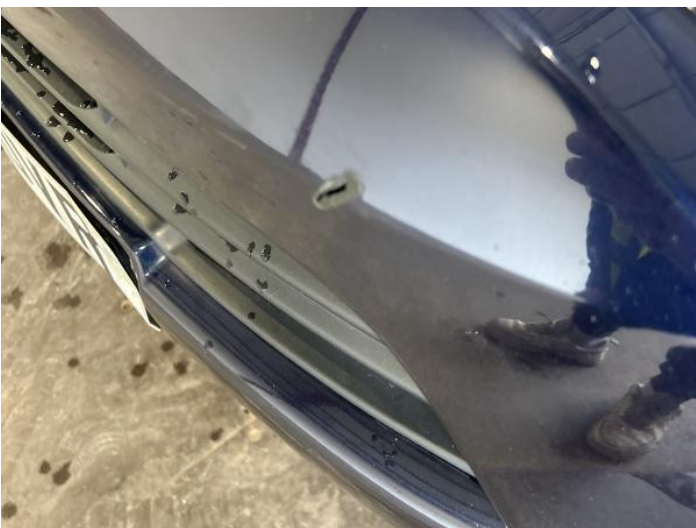
19: Bumper Front Hole UpTo 25mm