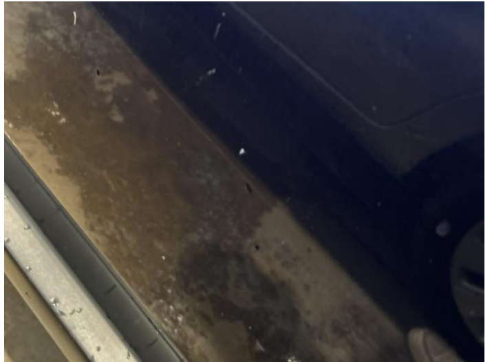
16: Door nsf Chipped 1 To 5