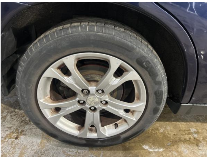
7: Wheel osr Scratched Up To 50mm