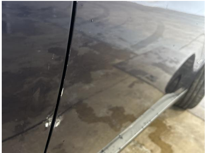
2: Door osf Chipped Edge Chip