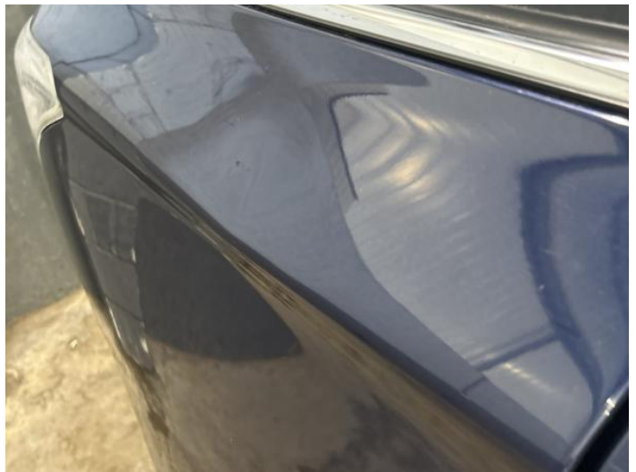
6: Qtr Panel osr Dented Over 30mm