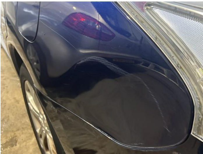
11: Qtr Panel nsr Dented With Paint Damage