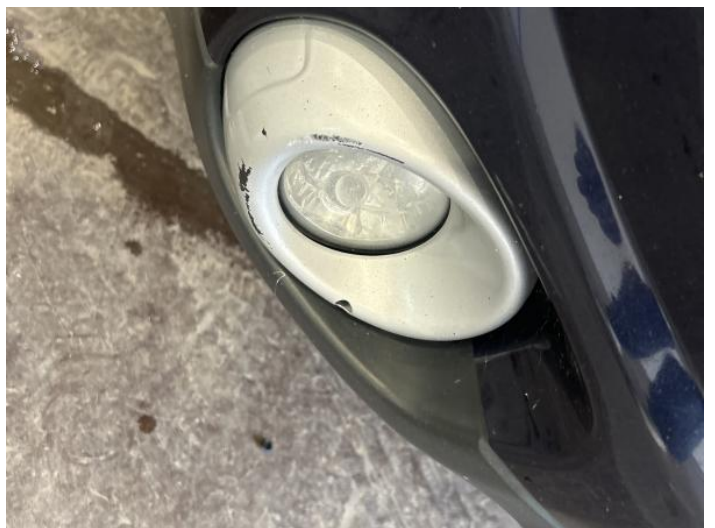
20: Other N/A N/A