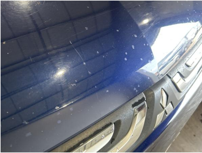
21: Bonnet Chipped Multiple Chips