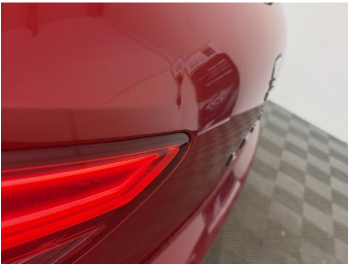
5: Tailgate Dented Over 30mm