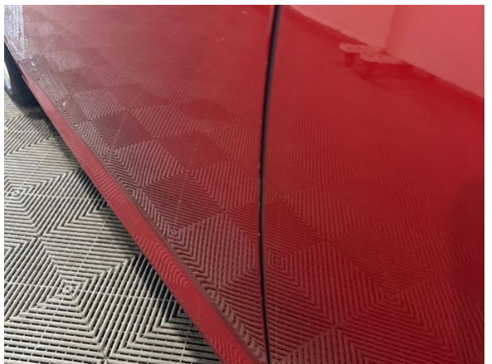
8: Door nsf Chipped Edge Chip