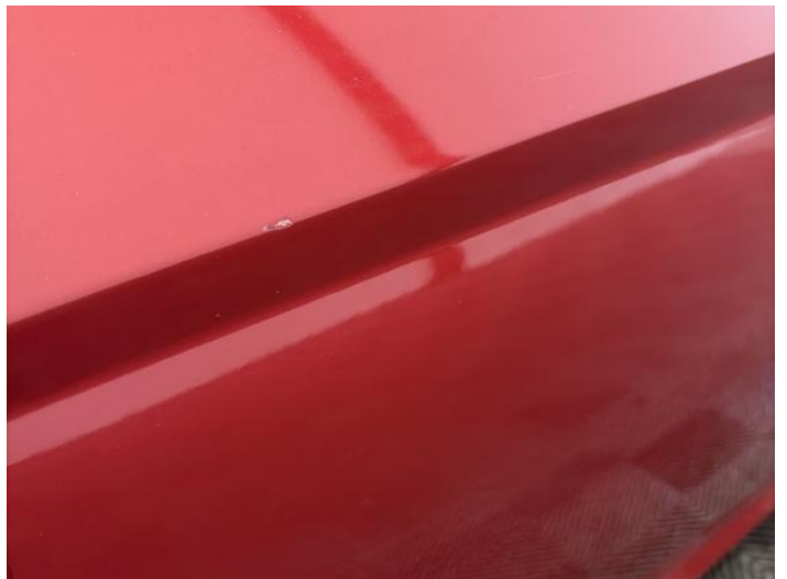
2: Door osf Chipped 1 To 5