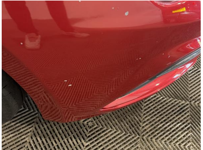
10: Bumper Front Chipped Multiple Chips