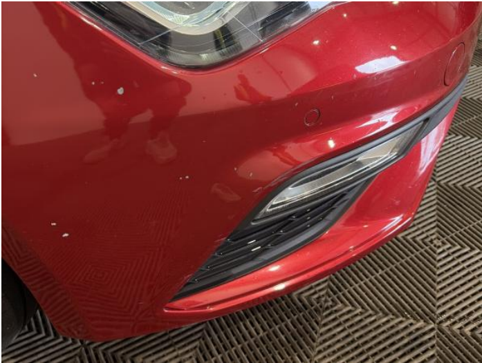
9: Bumper Front Scratched 25 to 100mm Thru Paint