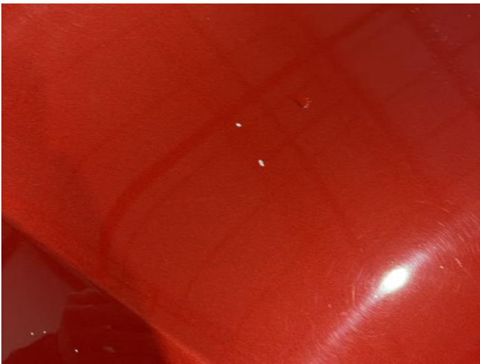
11: Bonnet Chipped 1 To 5