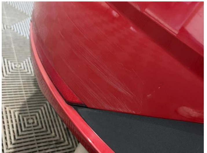
6: Bumper Rear Scratched 25 to 100mm Thru Paint