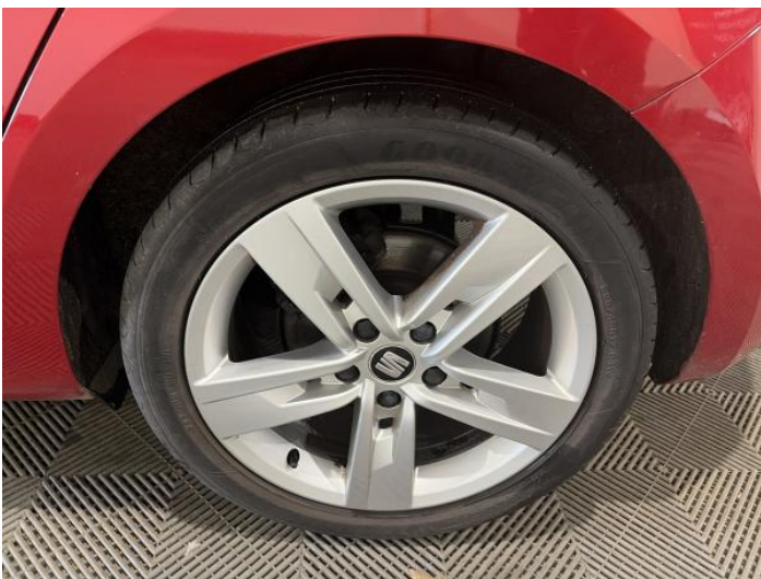
7: Wheel nsr Scratched Up To 50mm