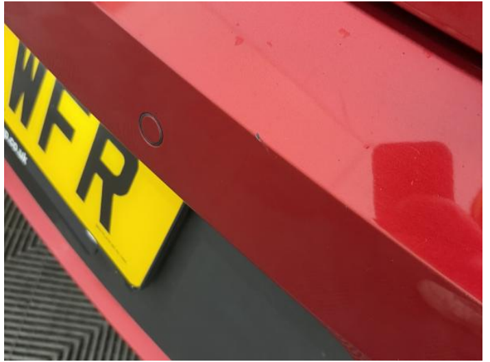
4: Bumper Rear Chipped 1 To 5