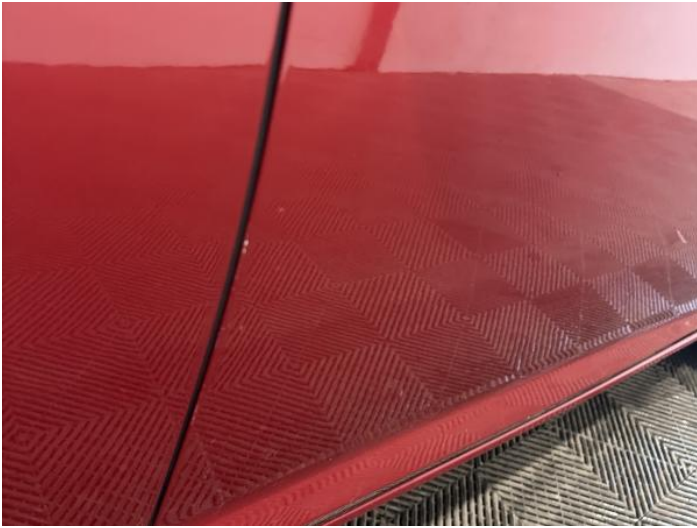
3: Door osf Chipped Edge Chip