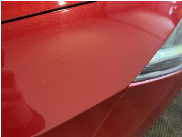
1: Wing osf Chipped 1 To 5