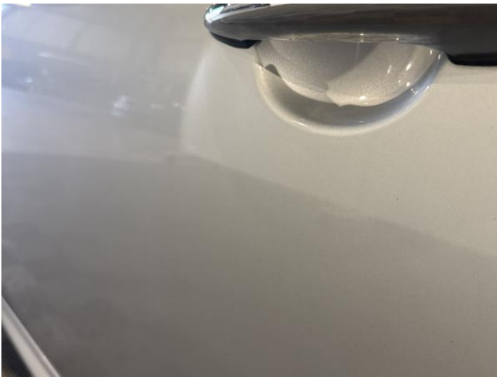
5: Door nsf Chipped 1 To 5