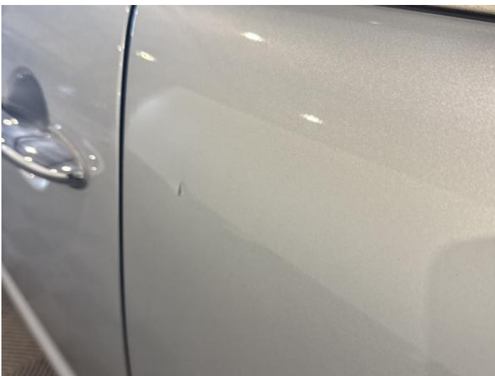
7: Qtr Panel nsr Dented Between 10mm + 30mm