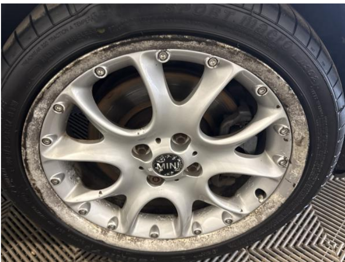
13: Wheel osf Scratched Over 50mm