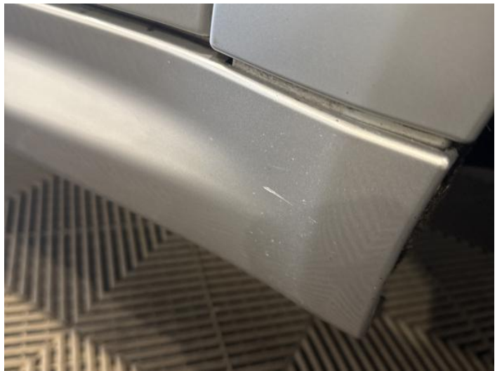
6: Sill Panel Trim ns Scratched (Painted) UpTo 25mm Thru Paint