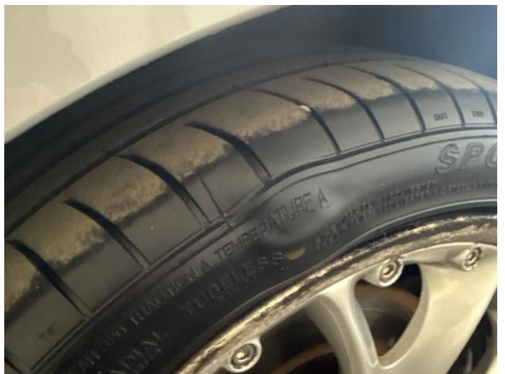
14: Tyre osf Damaged Replace