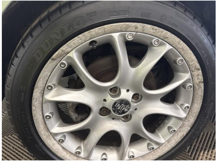
10: Wheel osr Scratched Over 50mm