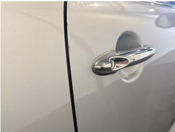
11: Door osf Chipped Edge Chip