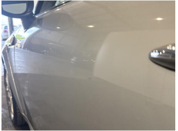
4: Door nsf Dented Over 30mm