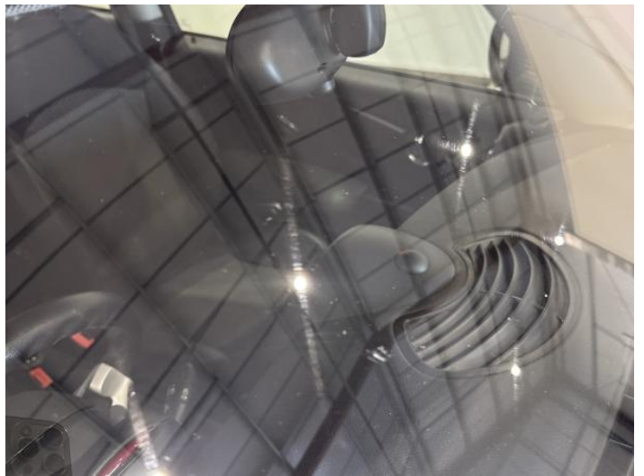
12: Screen Front Chipped UpTo 10mm