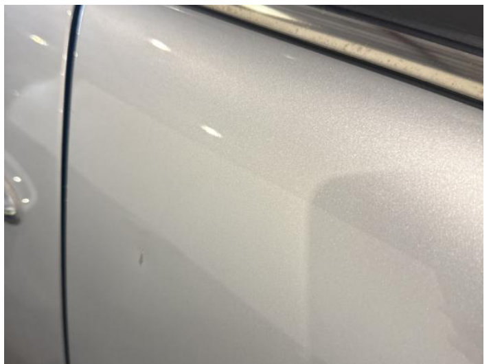
8: Qtr Panel nsr Chipped 1 To 5