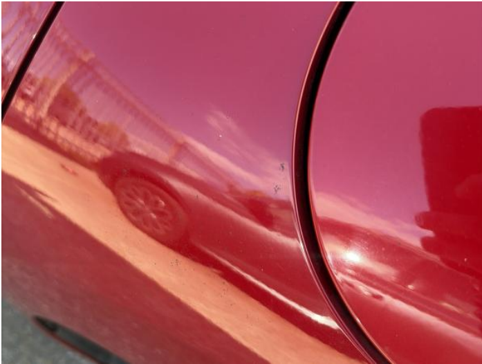
3: Qtr Panel nsr Chipped 1 To 5