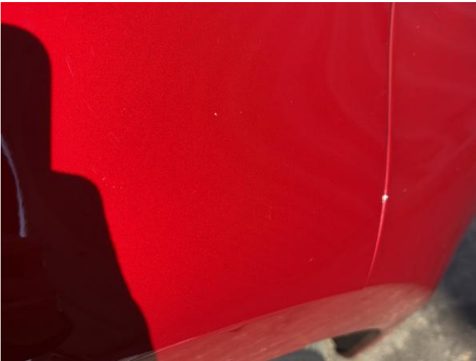
1: Wing osf Chipped 1 To 5