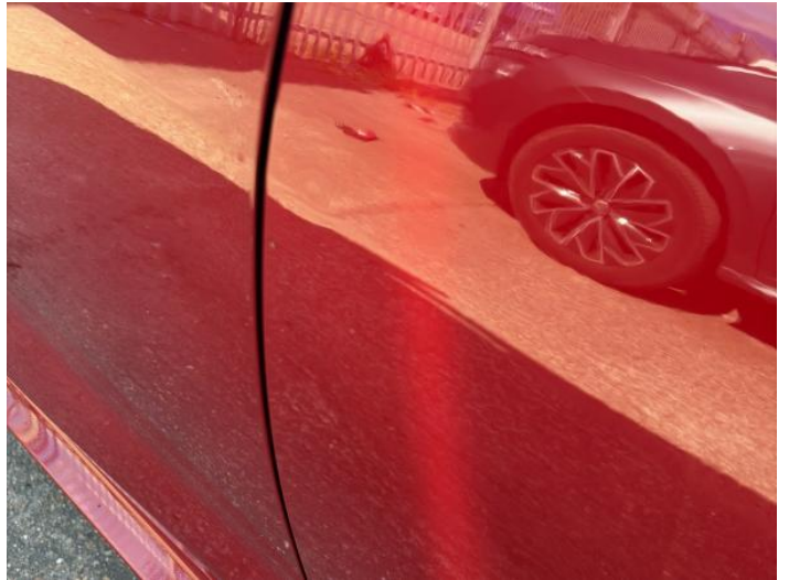
4: Door nsr Dented Between 10mm + 30mm