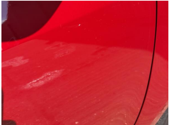
2: Door osf Chipped 1 To 5