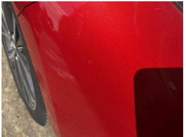
6: Bumper Front Chipped Multiple Chips