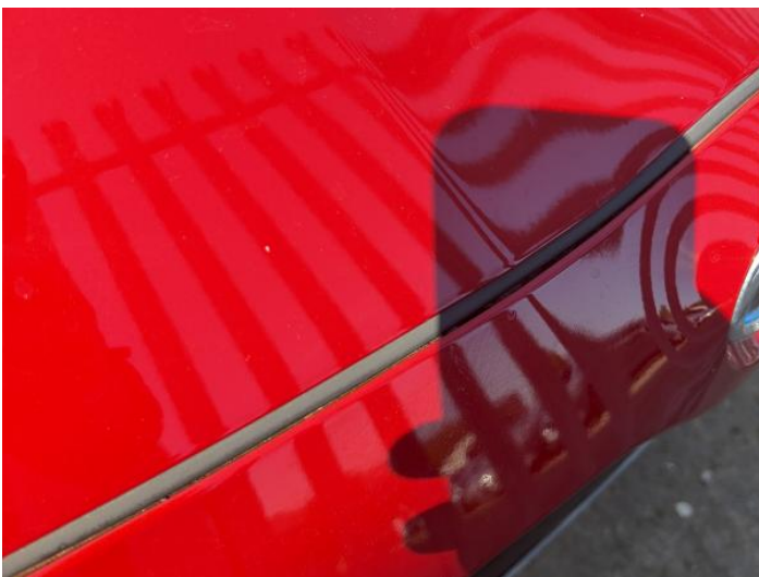
7: Bonnet Chipped 1 To 5