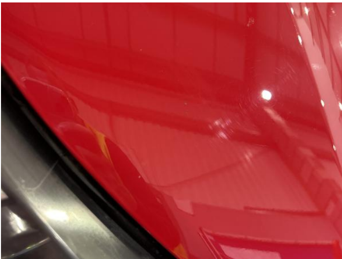
11: Bonnet Chipped 1 To 5