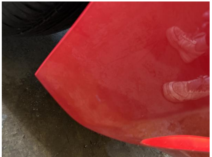
12: Bumper Front Chipped Multiple Chips