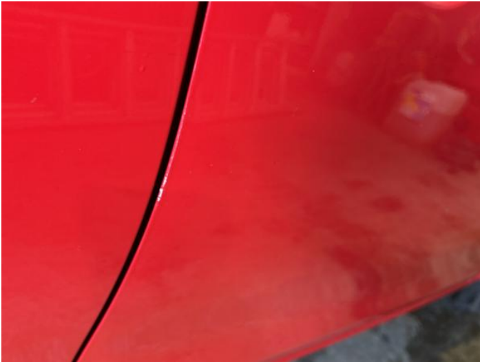
3: Door osf Chipped Edge Chip