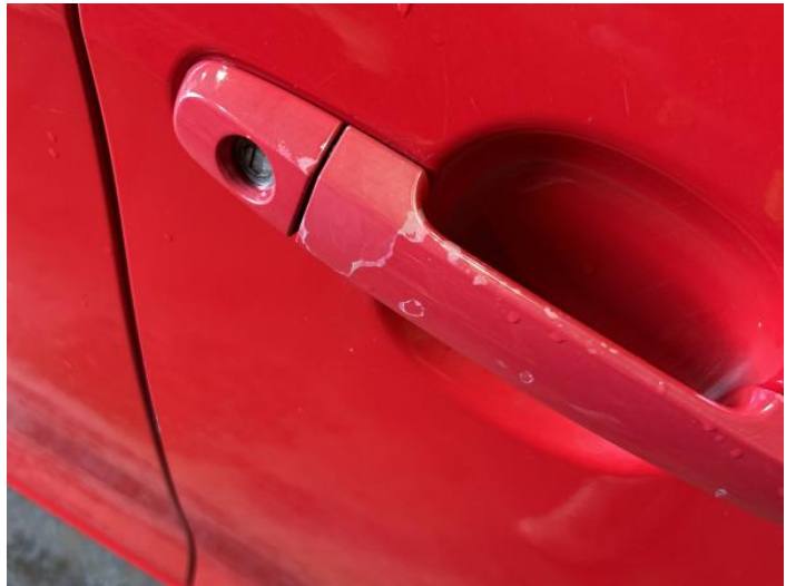
2: Other N/A N/A