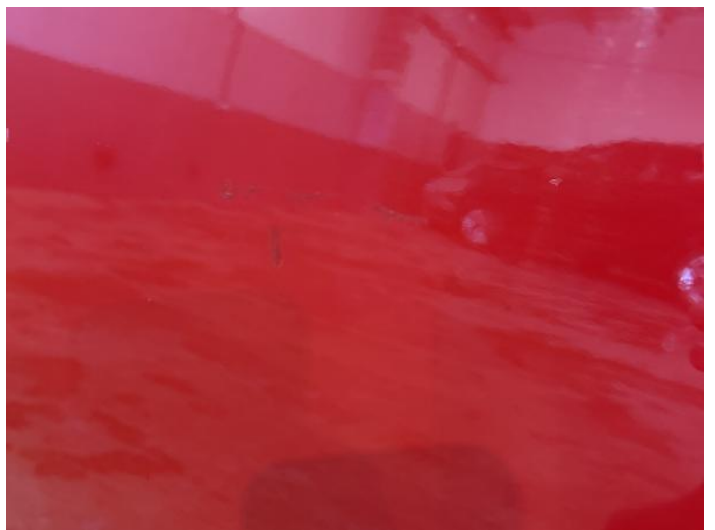
8: Door nsr Scratched Over 25mm Thru Paint