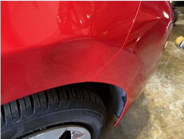
1: Wing of Dented Over 30mm