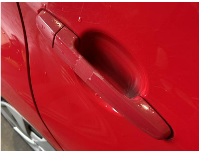
13: Other N/A N/A