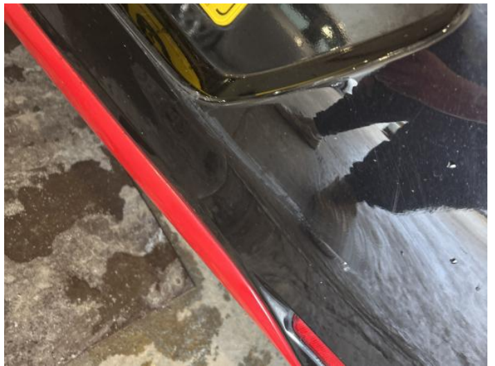
6: Bumper Rear Moulding Scratched (Painted) Over 25mm Thru Paint