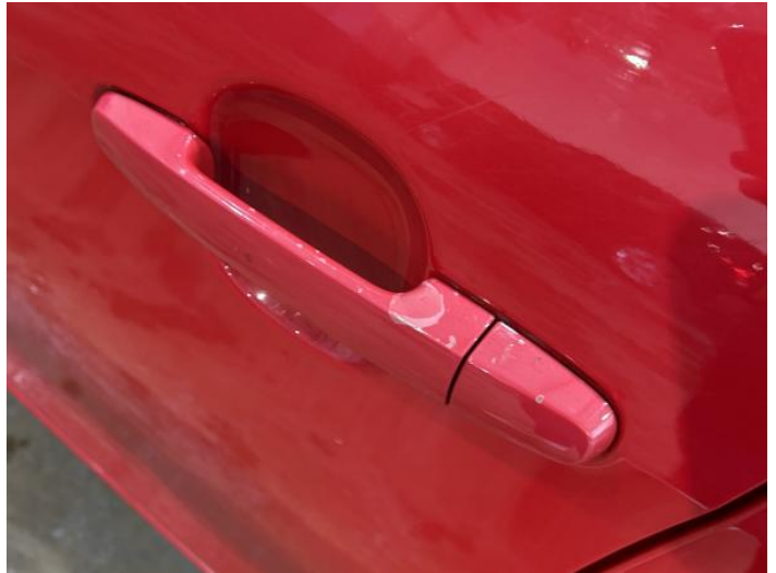
10: Other N/A N/A