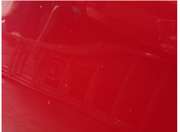
4: Door osr Scratched Over 25mm Thru Paint