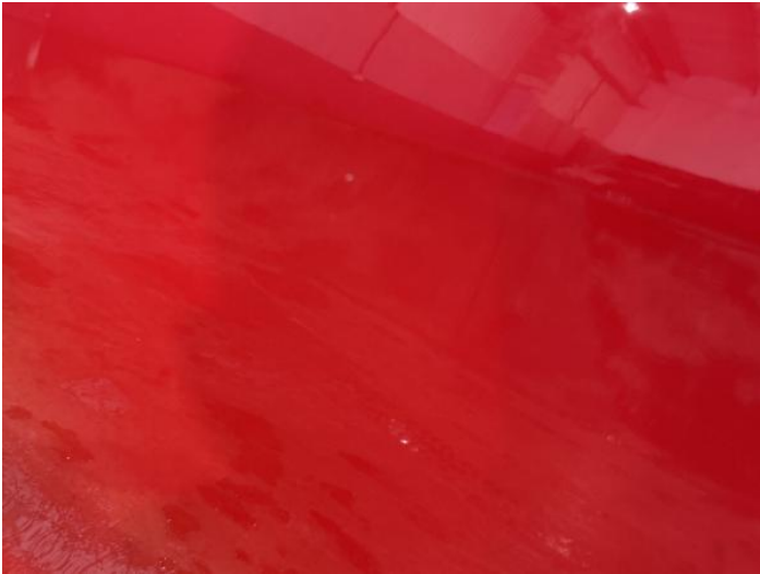
9: Door nsf Chipped 1 To 5