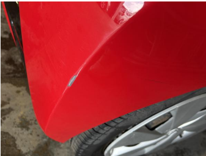
5: Bumper Rear Scratched Up To 25mm Thru Paint