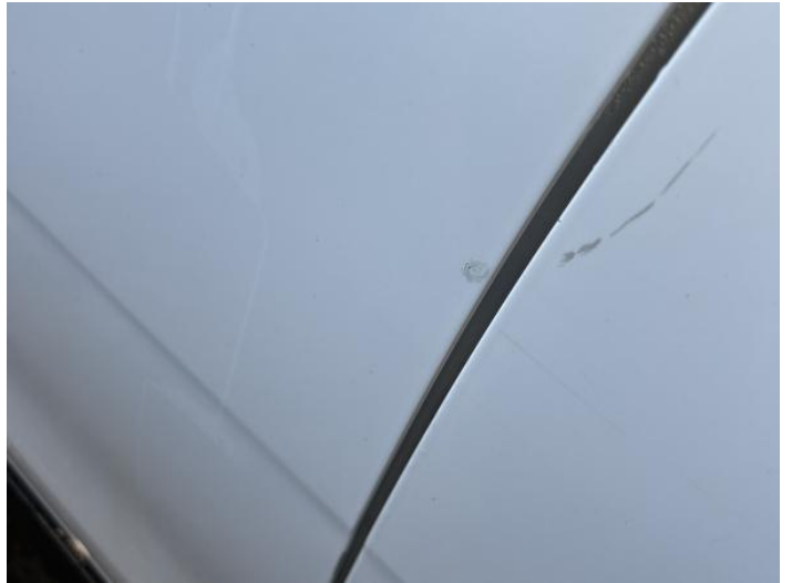
10: Door nsf Chipped 1 To 5