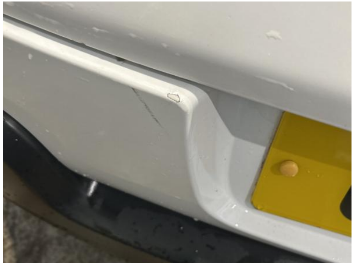
6: Bumper Rear Chipped 1 To 5