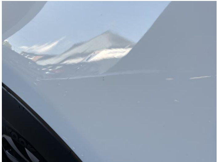
12: Wing nsf Chipped 1 To 5