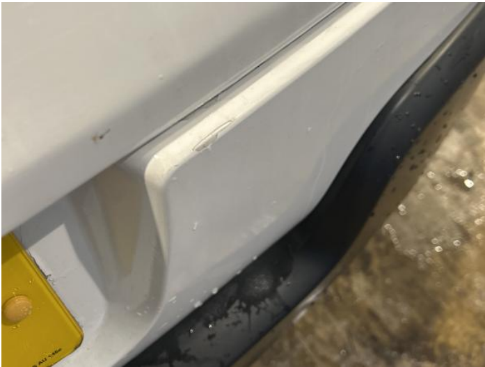
5: Bumper Rear Scratched Up To 25mm Thru Paint