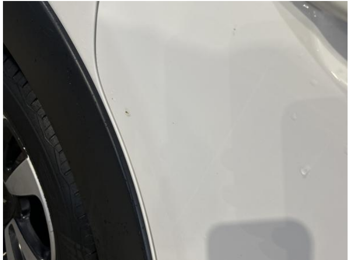
4: Door osr Chipped 1 To 5