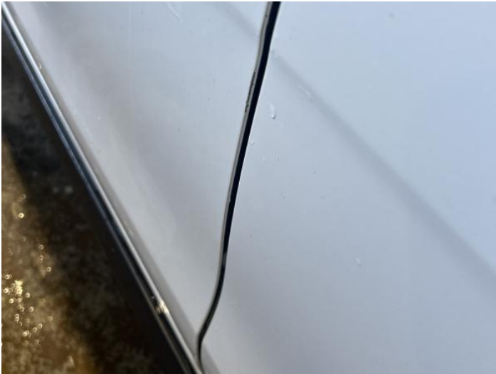
9: Door nsf Chipped Edge Chip