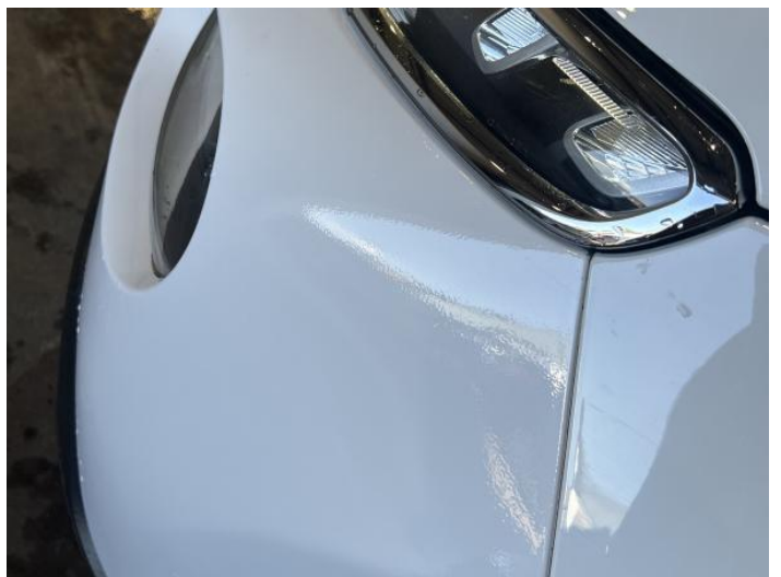
14: Bumper Front Poor Previous Repair Poor Paint