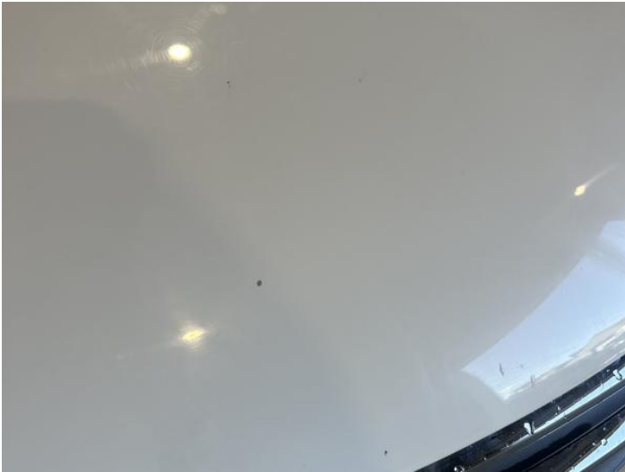
15: Bonnet Chipped 1 To 5