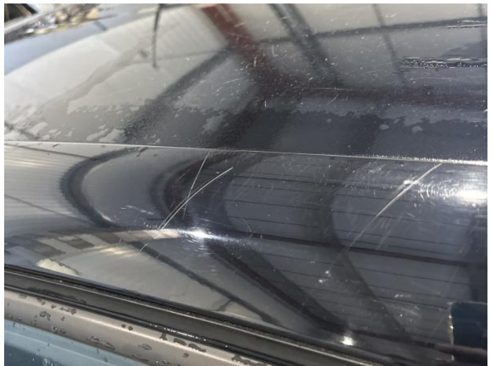
18: C Post os Scratched Over 25mm Thru Paint