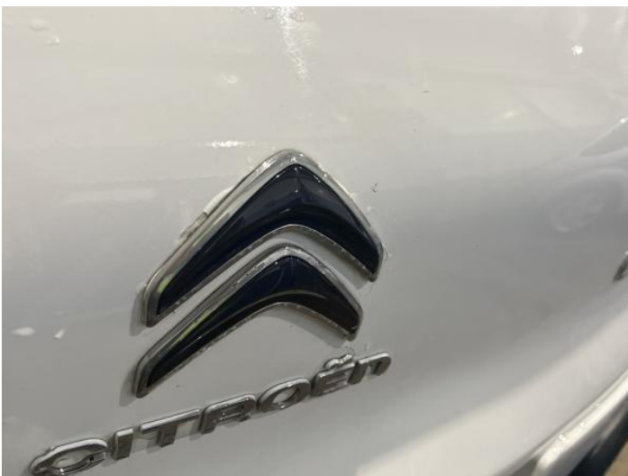
7: Tailgate Poor Previous Repair Paint Flake