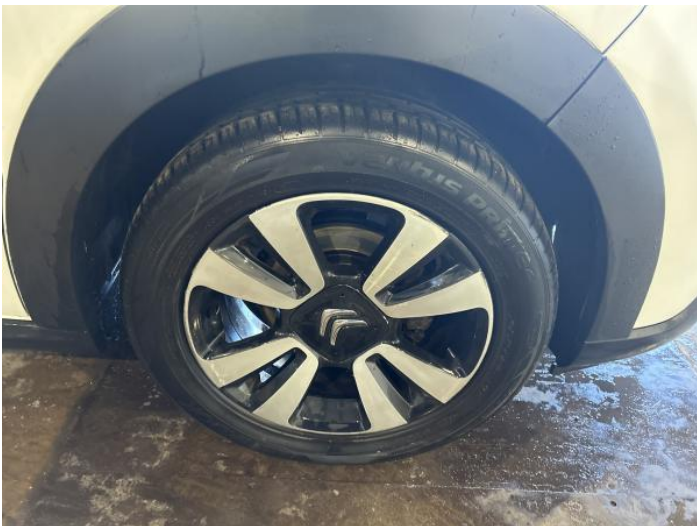
1: Wheel of Corroded Light