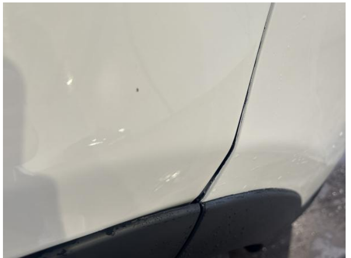
2: Wing of Chipped 1 To 5