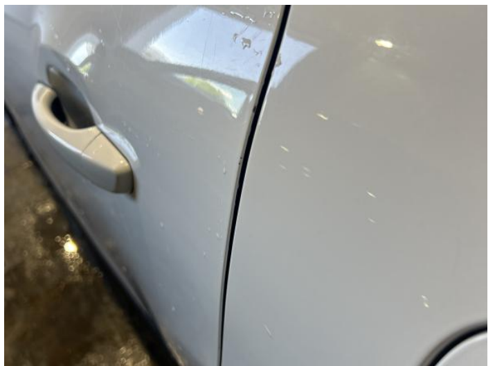
8: Door nsr Chipped Edge Chip