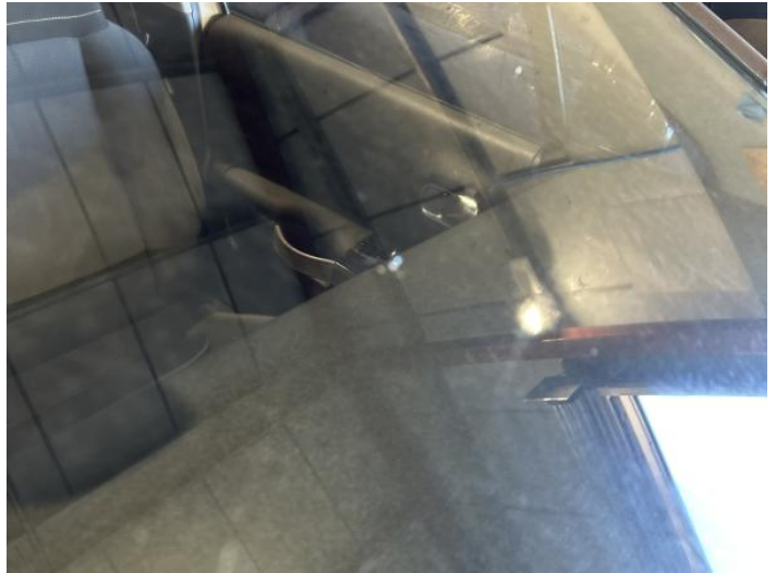
16: Screen Front Chipped UpTo 10mm