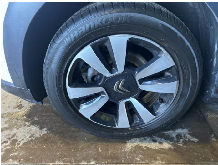
13: Wheel nsf Corroded Light