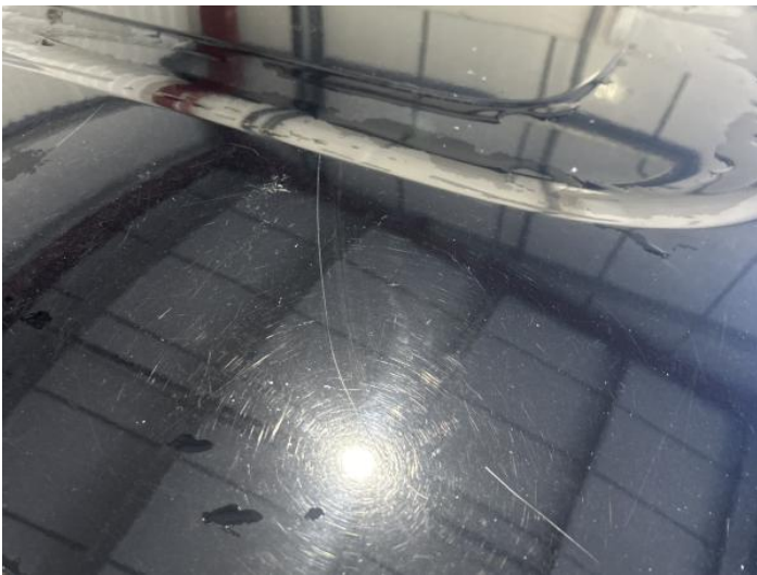
17: Roof Scratched Over 25mm Thru Paint