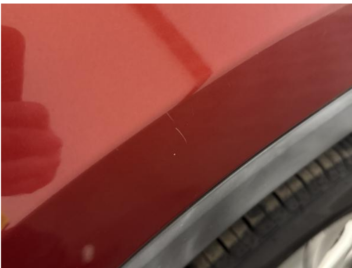
13: Wing osf Scratched UpTo 25mm Thru Paint