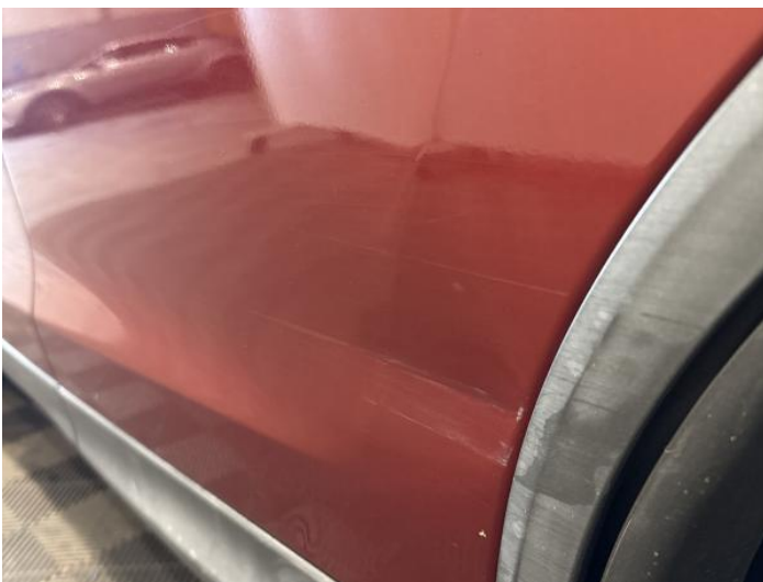
7: Door nsr Dented With Paint Damage