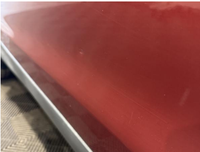
5: Door nsf Dented Between 10mm + 30mm