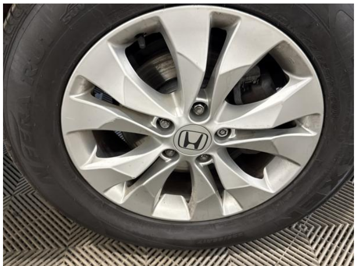
14: Wheel osf Scratched Up To 50mm