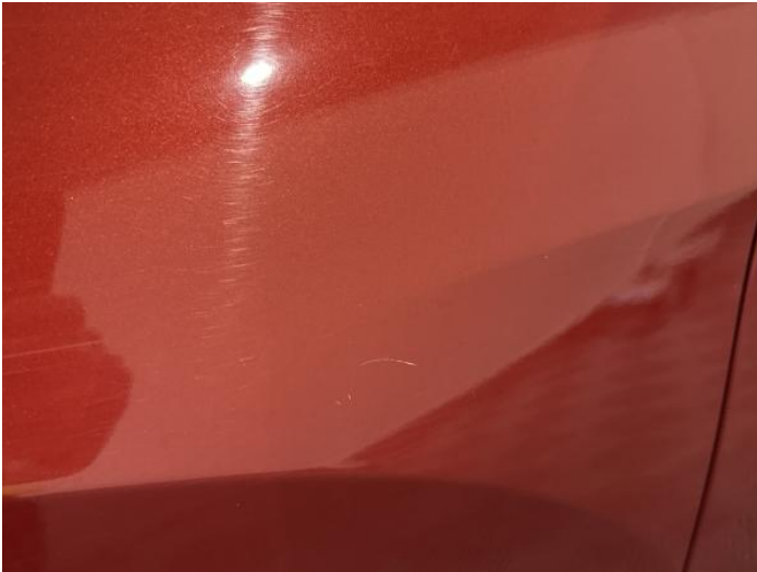
3: Wing nsf Scratched UpTo 25mm Thru Paint