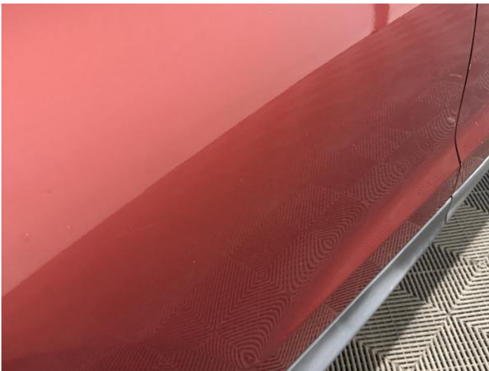
11: Door osf Scratched Over 25mm Thru Paint