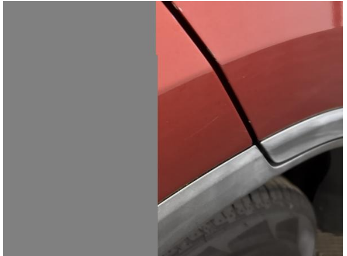
10: Qtr Panel osf Scratched UpTo 25mm Thru Paint