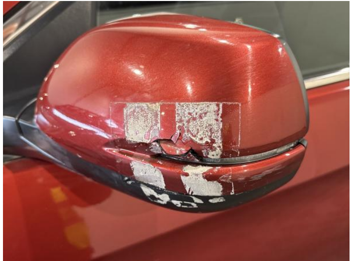
4: Door Mirror Assy nsf Broken Replace