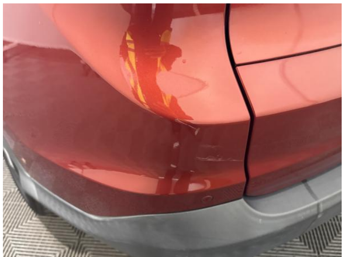
8: Bumper Rear Scratched 25 to 100mm Thru Paint