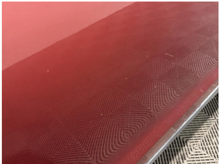
12: Door osf Chipped Multiple Chips