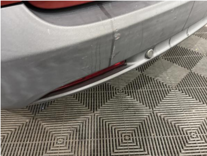
9: Bumper Rear Moulding Scuffed (Unpainted) Over 100mm