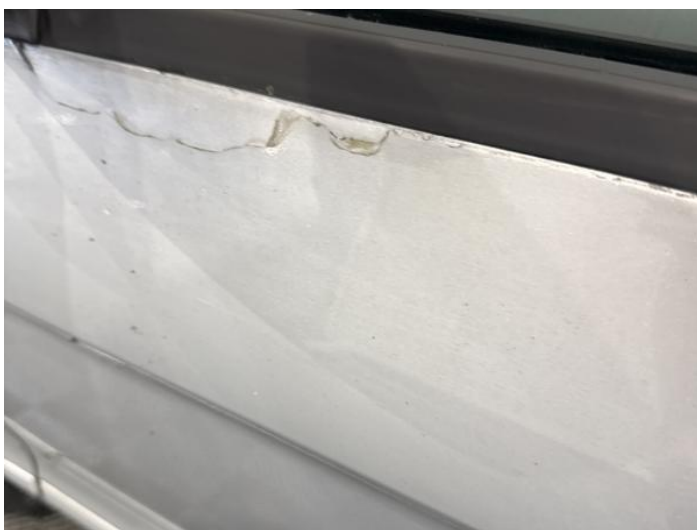
7: Door nsf Poor Previous Repair Paint Flake