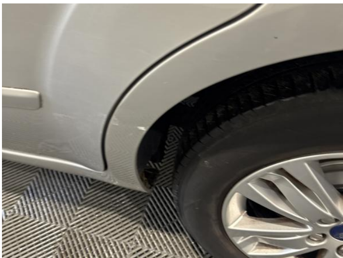
9: Qtr Panel nsr Scratched Over 25mm Thru Paint