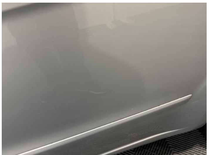
8: Door nsr Dented With Paint Damage