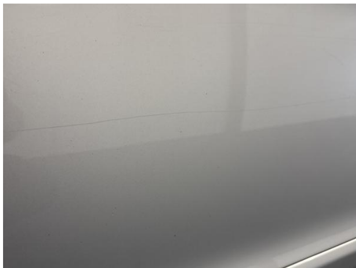
16: Door osf Scratched Over 25mm Thru Paint