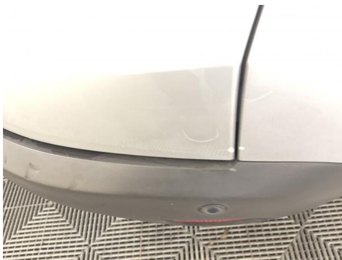
12: Boot Lid Chipped 1 To 5