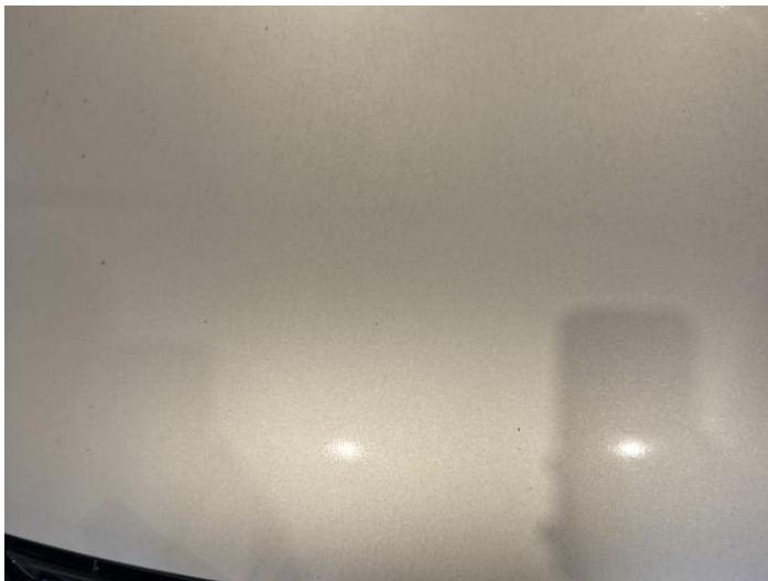
3: Bonnet Chipped 1 To 5