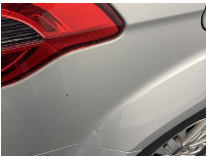
13: Qtr Panel osr Dented 2 Or Less UpTo 10mm