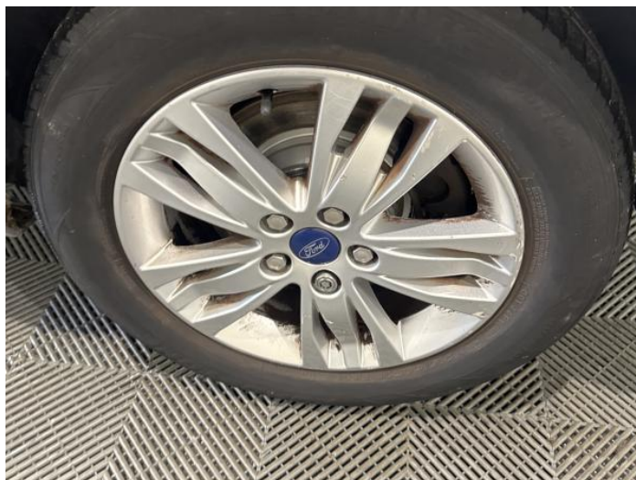
10: Wheel nsr Scratched Over 50mm