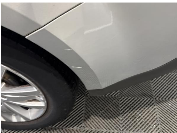
11: Bumper Rear Scratched Over 100mm Thru Paint