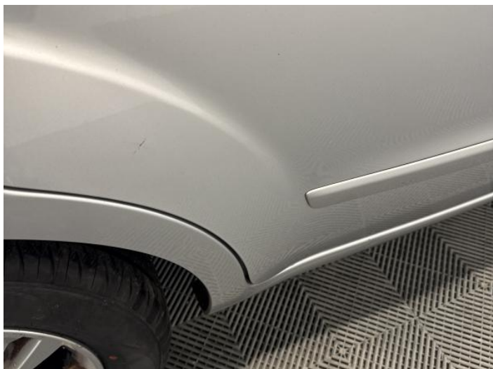
15: Door osr Scratched UpTo 25mm Thru Paint