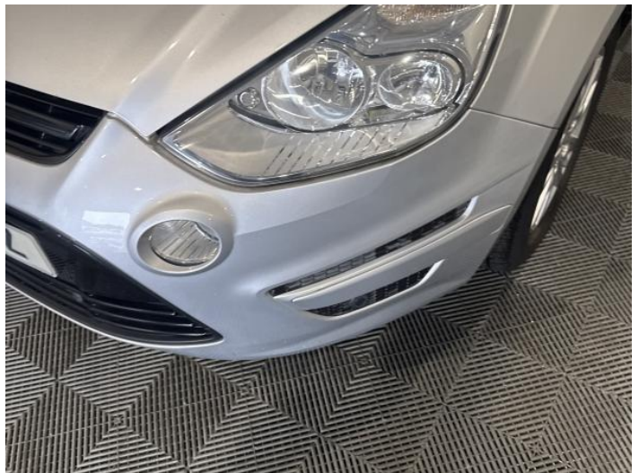
4: Bumper Front Scratched Over 100mm Thru Paint