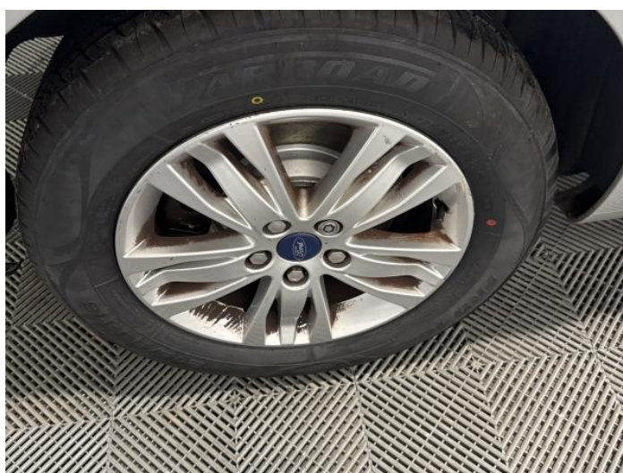
14: Wheel osr Scratched Over 50mm