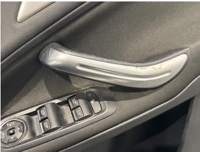
1: Handle Inner osf Damaged Replace