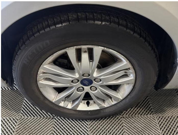
5: Wheel nsf Scratched Over 50mm