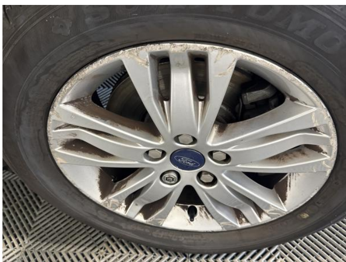
17: Wheel osf Scratched Over 50mm