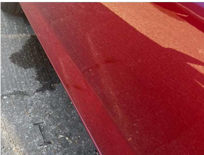
7: Door nsf Dented 2 Or Less UpTo 10mm