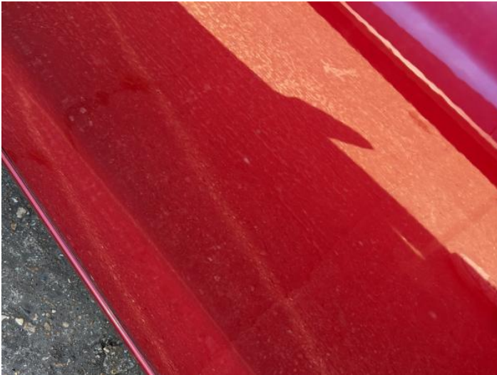
3: Door nsf Chipped 1 To 5