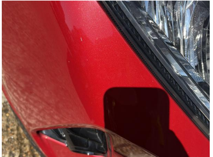
4: Bumper Front Chipped 1 To 5