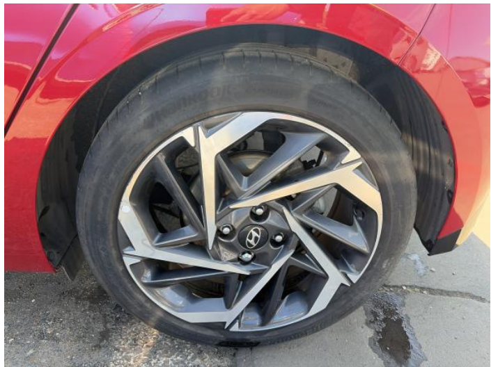
2: Wheel nsr Scratched Up To 50mm