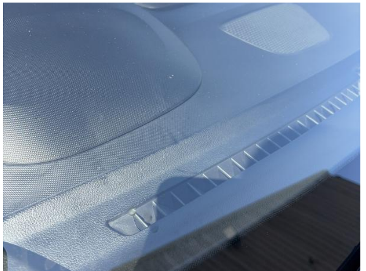
6: Screen Front Chipped UpTo 10mm