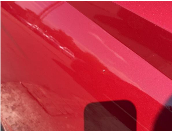
1: Door osr Chipped 1 To 5