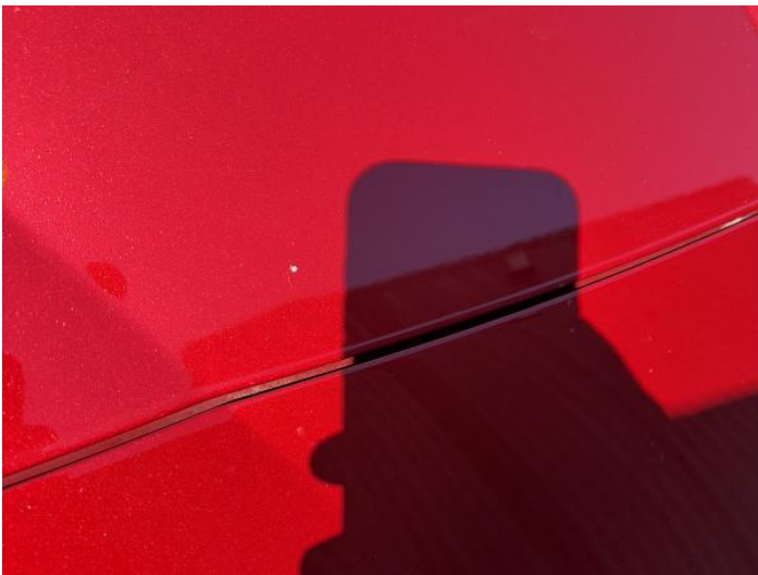
5: Bonnet Chipped 1 To 5