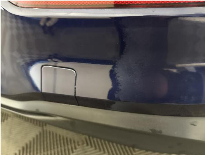
9: Bumper Rear Poor Previous Repair Poor Paint