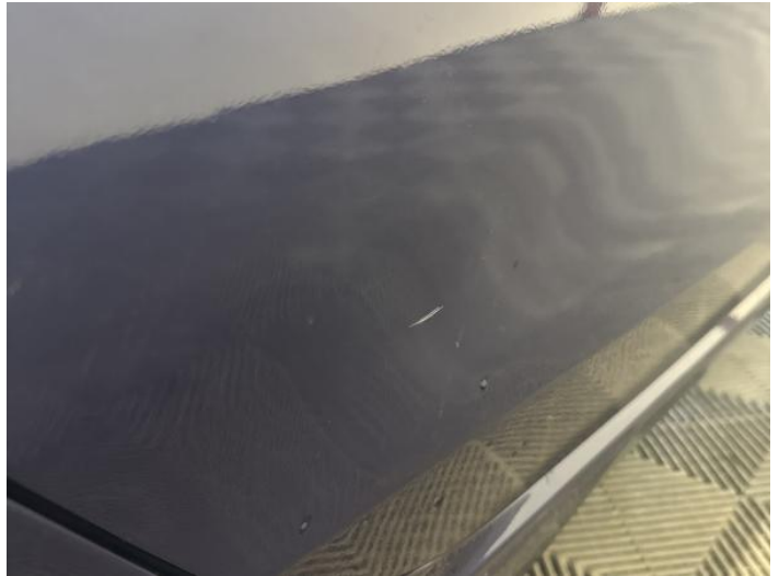
10: Door osr Scratched UpTo 25mm Thru Paint