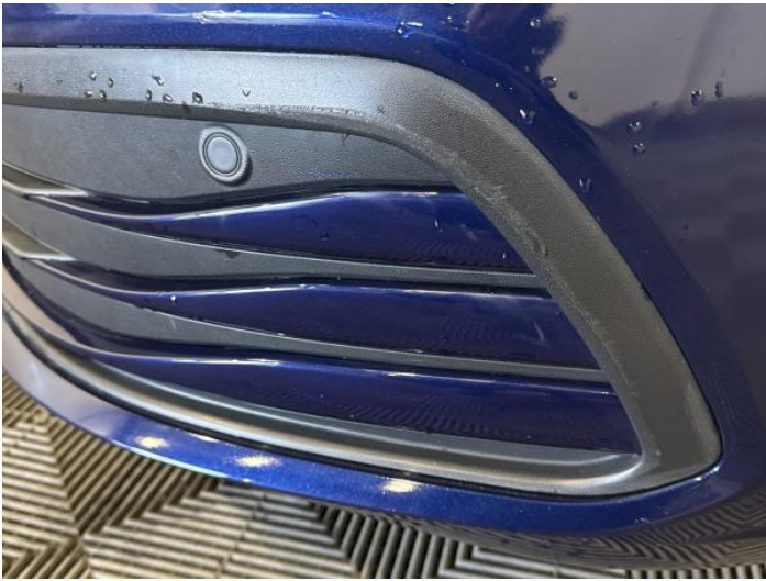
5: Bumper Front Moulding Scuffed (Unpainted) UpTo 100mm