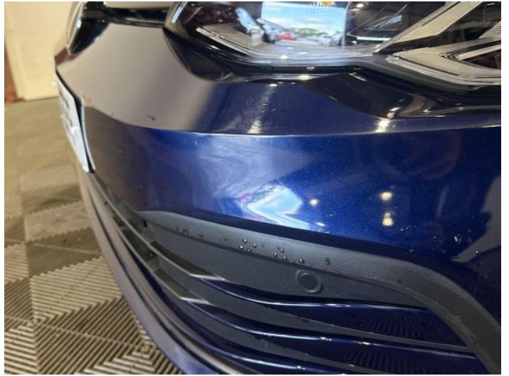
4: Bumper Front Poor Previous Repair Paint Flake