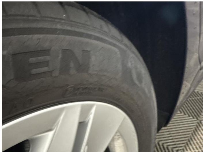
2: Tyre osr Damaged Replace