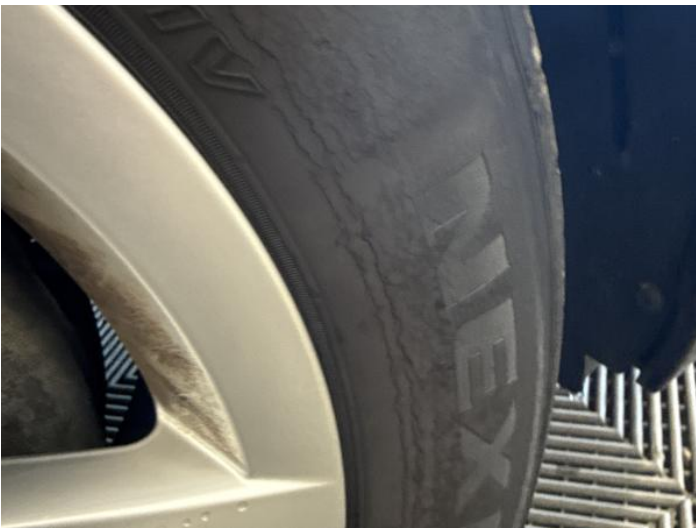
1: Tyre osf Damaged Replace