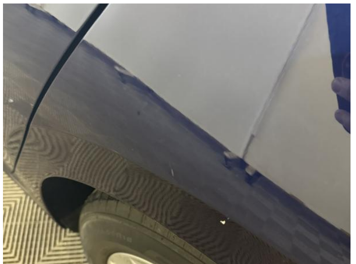
8: Qtr Panel nsr Chipped 1 To 5