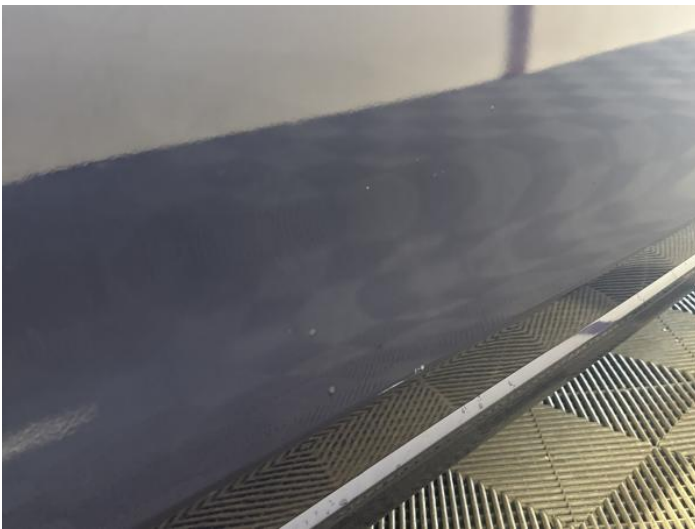
11: Door osf Scratched Over 25mm Thru Paint