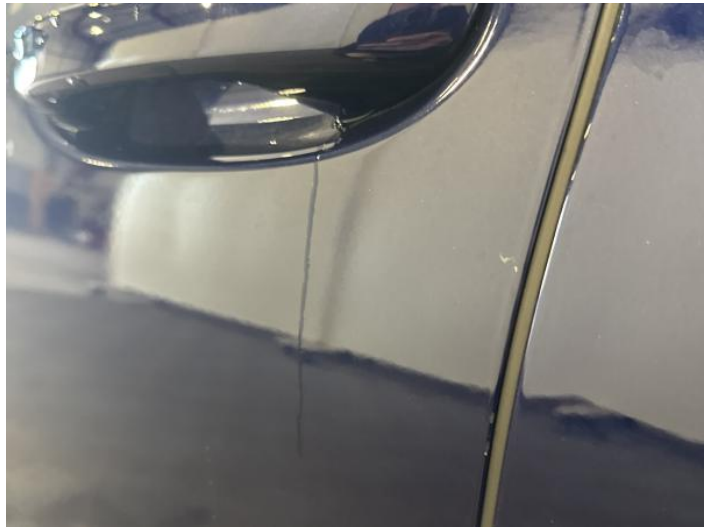
6: Door nsf Chipped 1 To 5