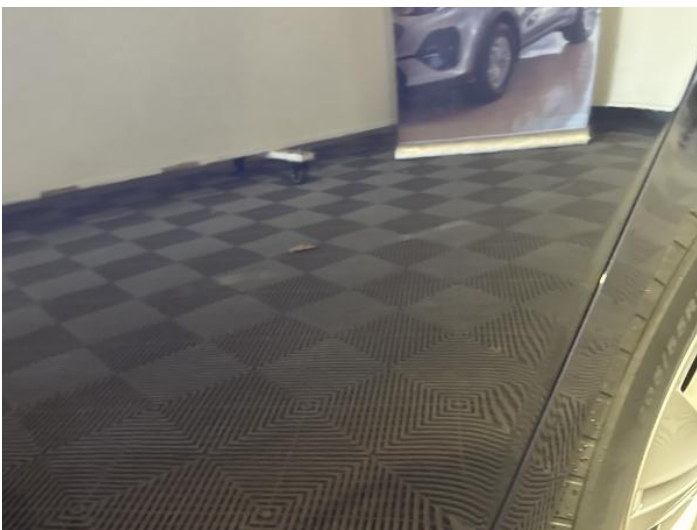
7: Door nsr Scratched Over 25mm Thru Paint