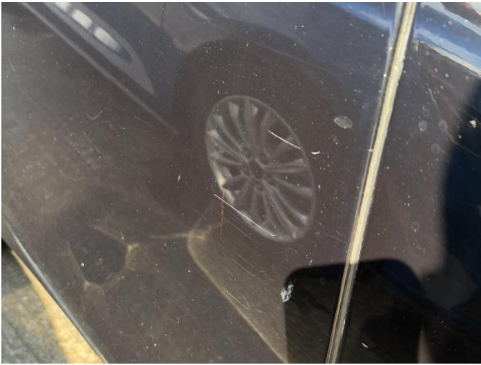
5: Door osr Scratched Over 25mm Thru Paint