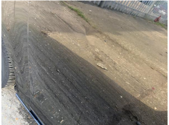
16: Door nsf Dented With Paint Damage