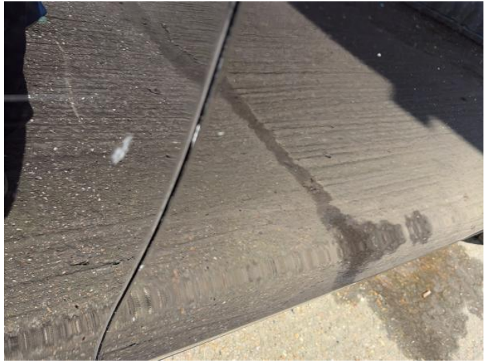
4: Door osf Chipped Edge Chip