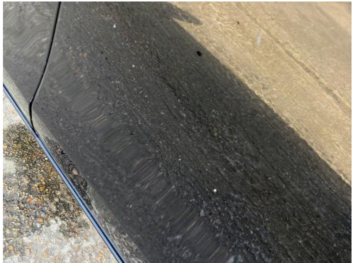
12: Door nsr Chipped 1 To 5