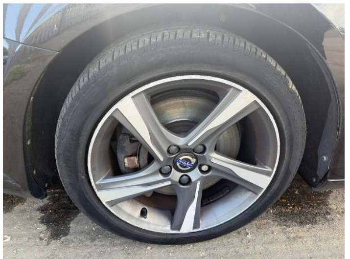
14: Wheel nsf Scratched Over 50mm