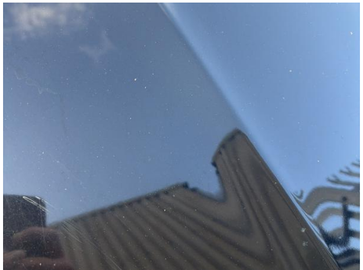
18: Bonnet Chipped 1 To 5