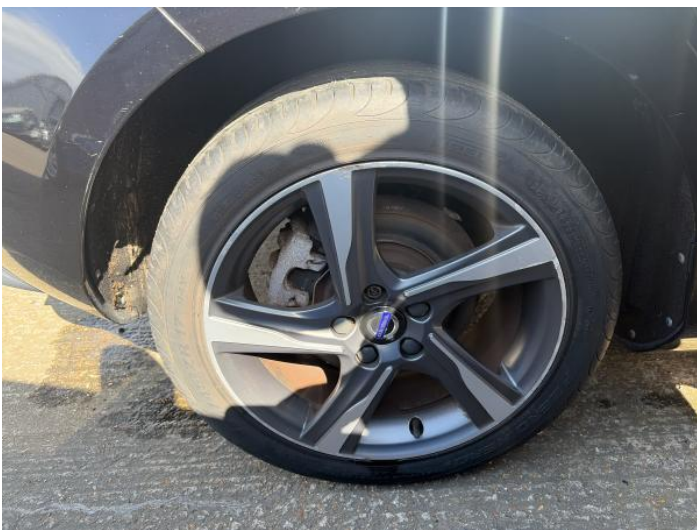
7: Wheel osr Corroded Light