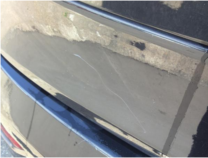
9: Tailgate Scratched Over 25mm Thru Paint