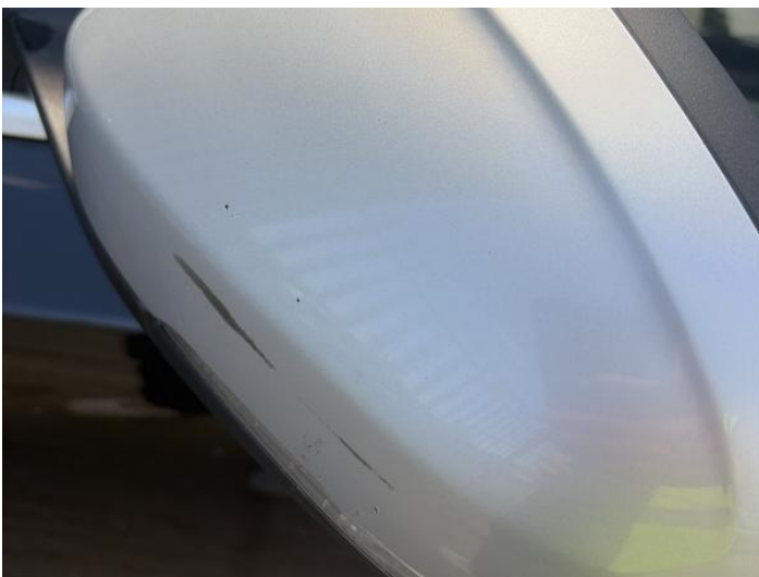
13: Door Mirror Assy nsf Scratched (Painted) Up To 25mm Thru Paint