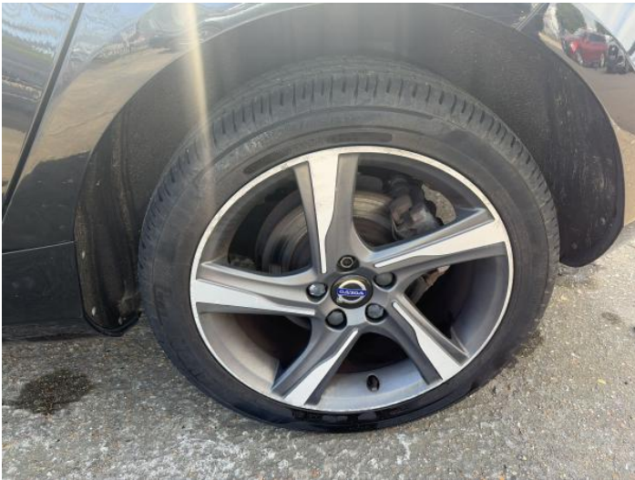
11: Wheel nsr Corroded Light