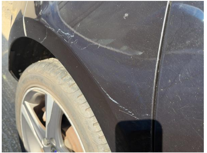
6: Qtr Panel osr Scratched Over 25mm Thru Paint