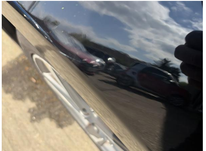
2: Wing of Scratched Up To 25mm Thru Paint