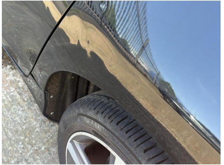
10: Qtr Panel nsr Dented Over 30mm