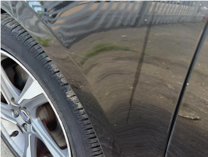
15: Wing nsf Scratched Over 25mm Thru Paint