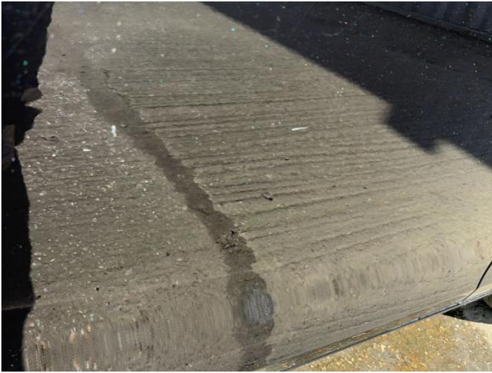
3: Door osf Chipped 1 To 5