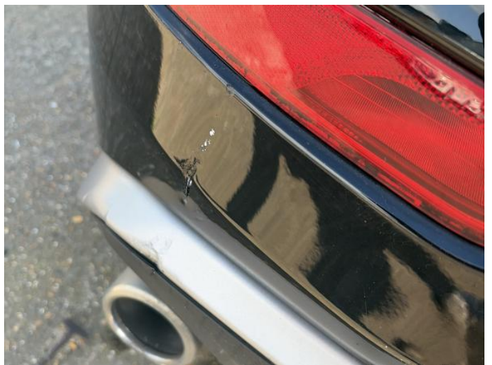
8: Bumper Rear Dented With Paint Damage