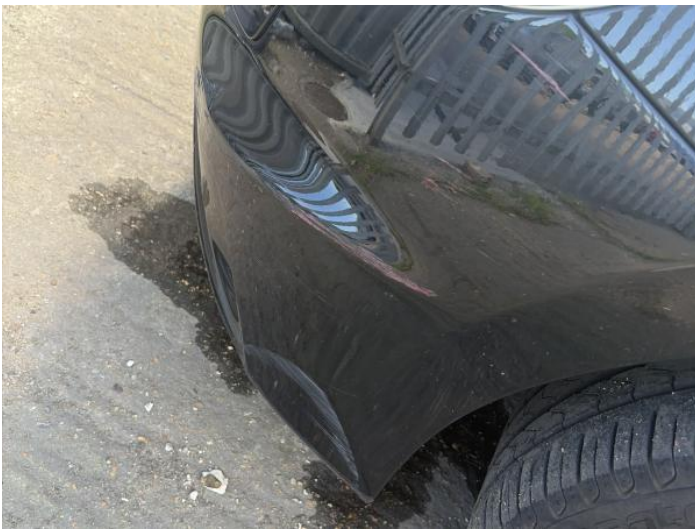
17: Bumper Front Scratched Over 100mm Thru Paint