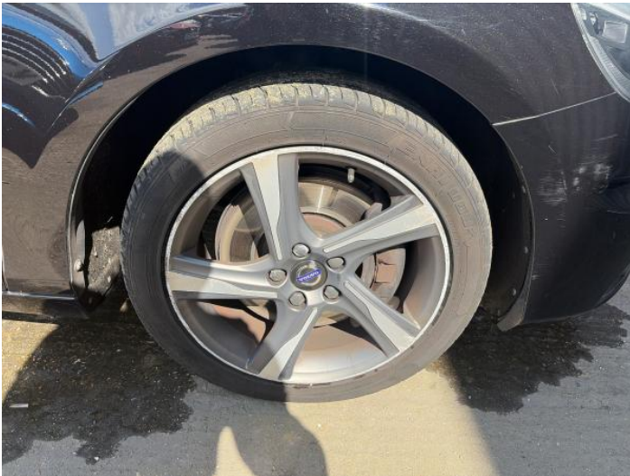
1: Wheel of Scratched Over 50mm