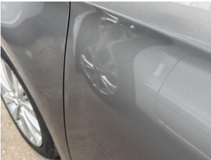
5: Door nsf Dented Over 30mm