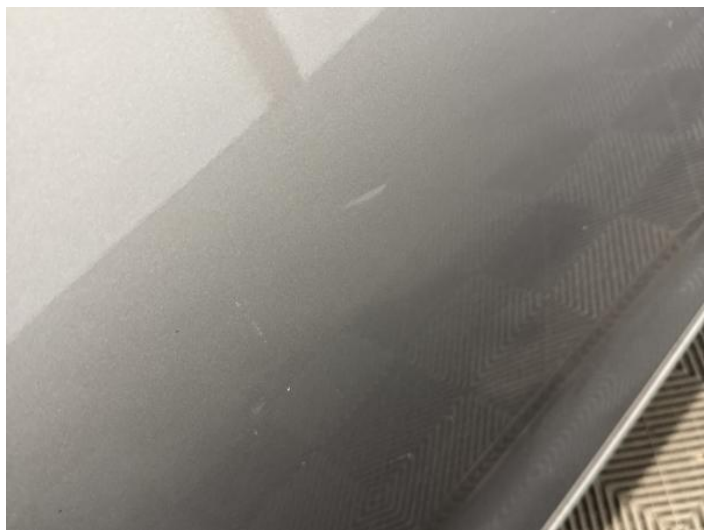
14: Door osf Scratched Up To 25mm Thru Paint