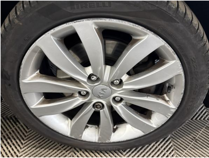
15: Wheel of Scratched Over 50mm