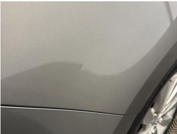
11: Qtr Panel osr Chipped 1 To 5