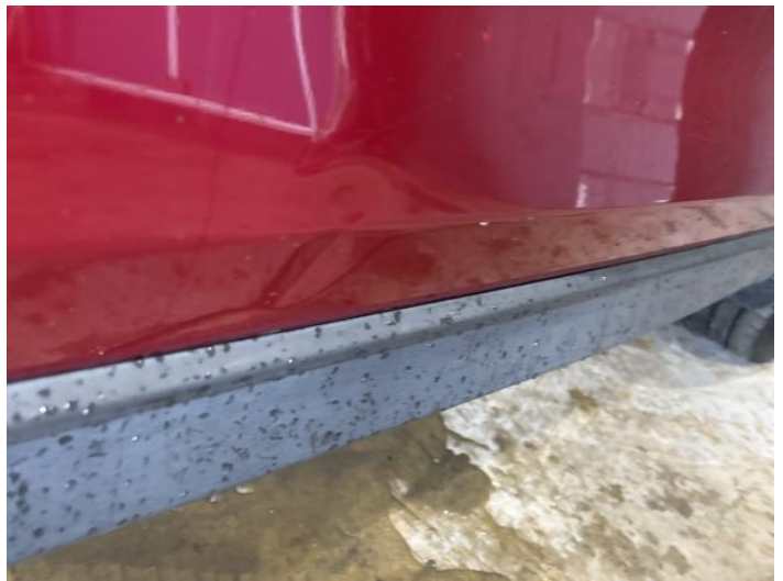
12: Door osf Dented Over 30mm