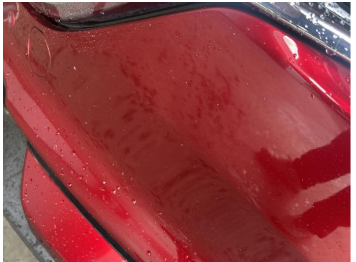
8: Bumper Front Chipped Multiple Chips