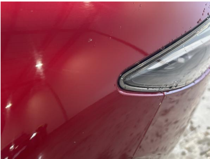
1: Wing osf Chipped 1 To 5