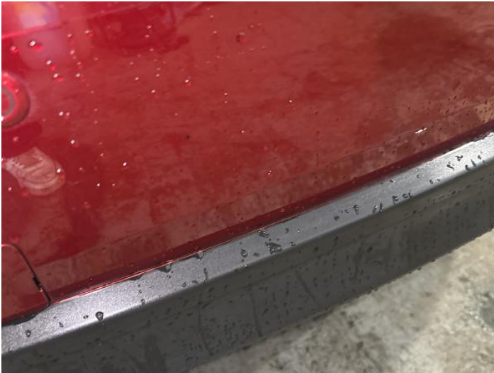
3: Bumper Rear Chipped 1 To 5