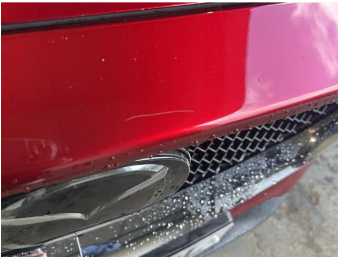
11: Bumper Front Scratched 25 to 100mm Thru Paint