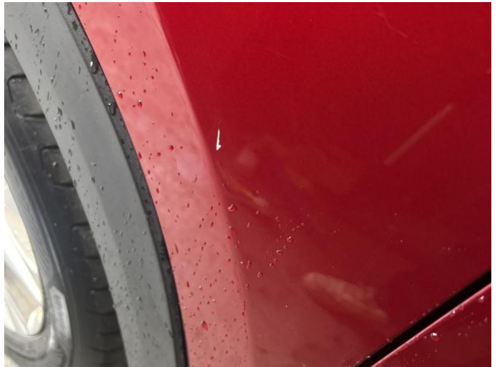
6: Wing nsf Chipped 1 To 5