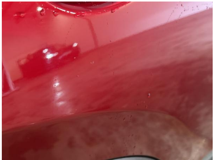
2: Door osr Chipped 1 To 5