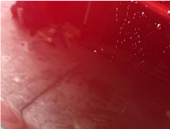
5: Door nsf Chipped 1 To 5