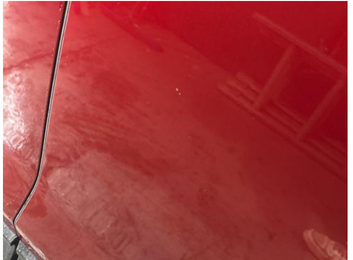
4: Door nsr Chipped 1 To 5