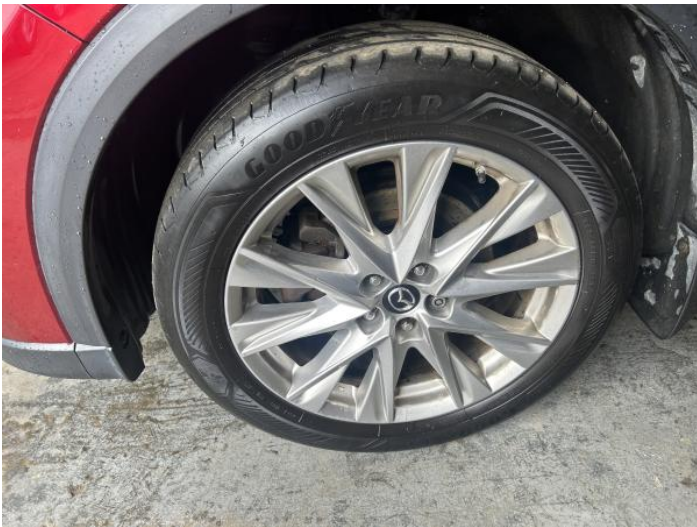
7: Wheel nsf Scratched Up To 50mm