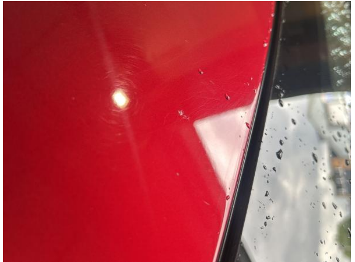
10: Roof Chipped 1 To 5