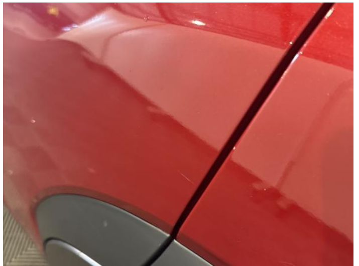
6: Door nsr Scratched UpTo 25mm Thru Paint