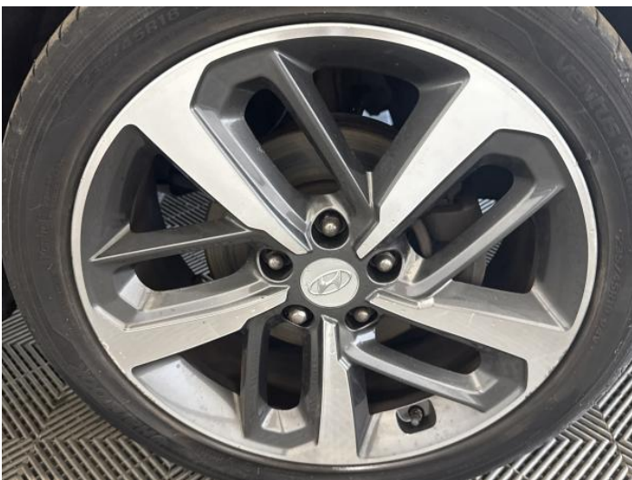
13: Wheel osf Scratched Over 50mm