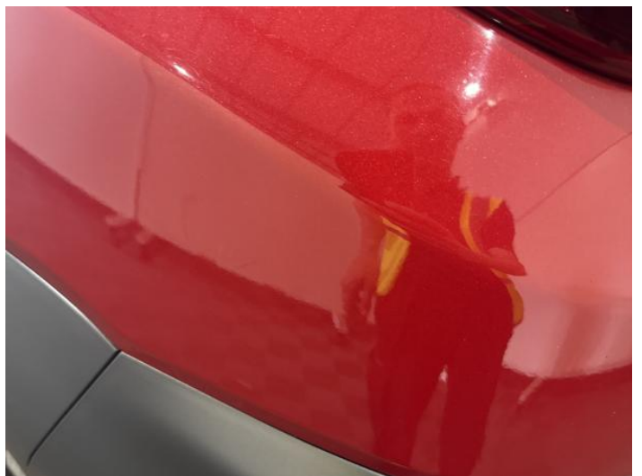
8: Qtr Panel nsr Scratched UpTo 25mm Thru Paint