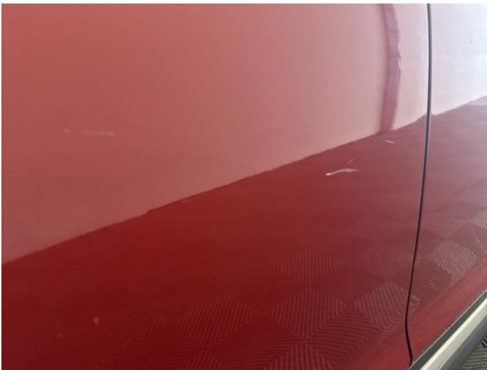
11: Door osr Scratched Over 25mm Thru Paint