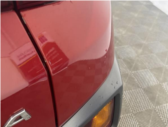
9: Qtr Panel osr Chipped 1 To 5