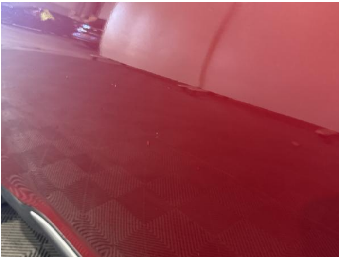
5: Door nsf Chipped 1 To 5