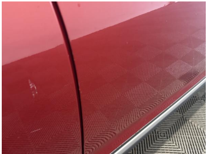
12: Door osf Chipped Edge Chip