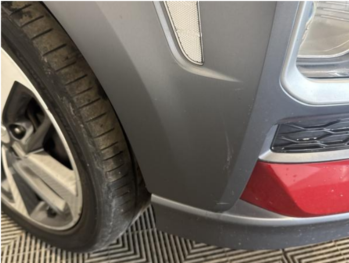
3: Bumper Front Moulding Scuffed (Unpainted) UpTo 100mm