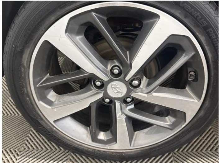
10: Wheel osr Scratched Up To 50mm