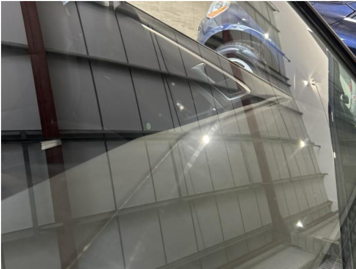
15: Screen Front Chipped Over 10mm