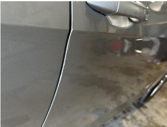
5: Door osf Chipped Edge Chip