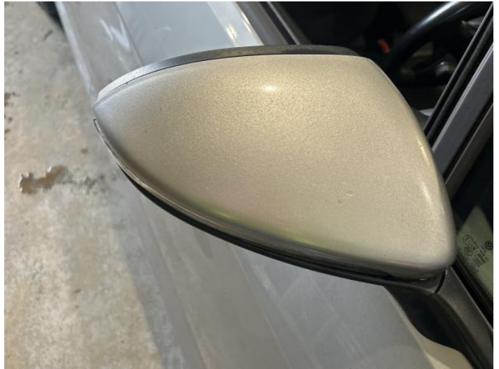
16: Door Mirror Assy osf Scratched (Painted) Over 25mm Thru Paint