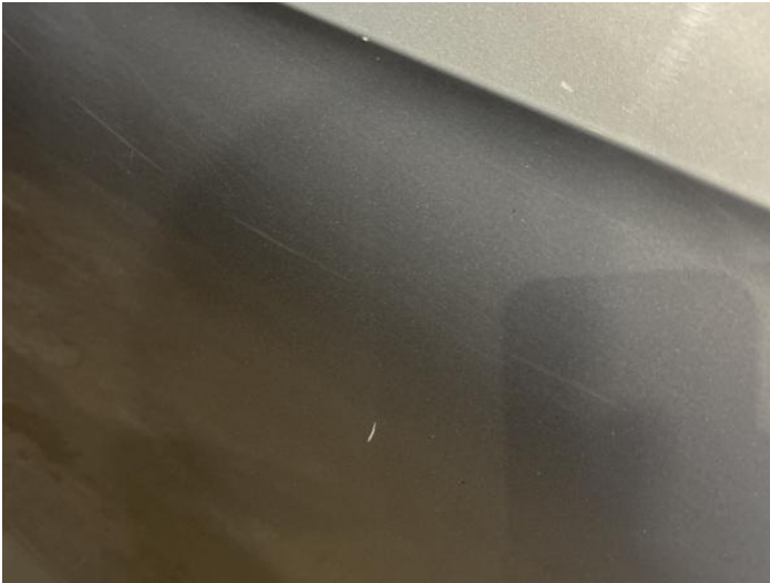
9: Door nsf Chipped 1 To 5