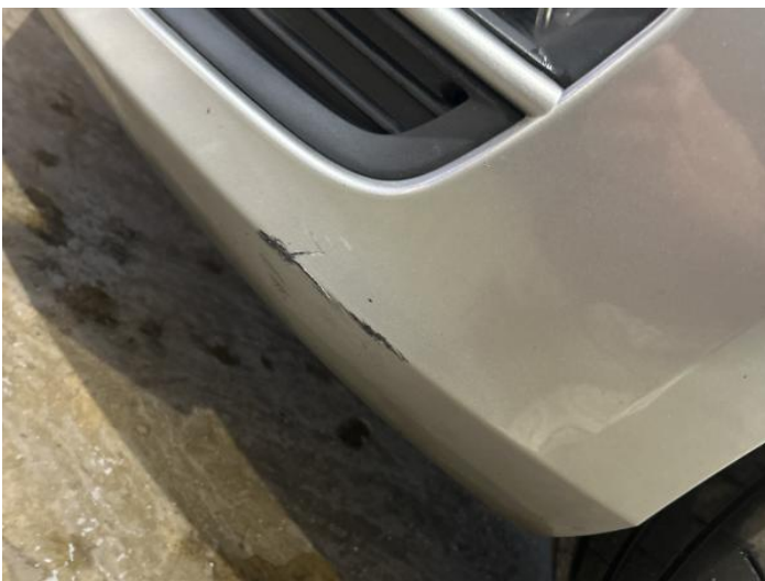
13: Bumper Front Scratched 25 to 100mm Thru Paint