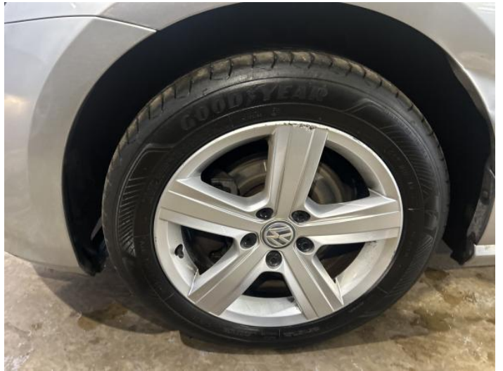
12: Wheel nsf Scratched Over 50mm