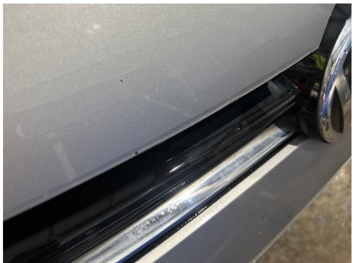
14: Bonnet Chipped 1 To 5