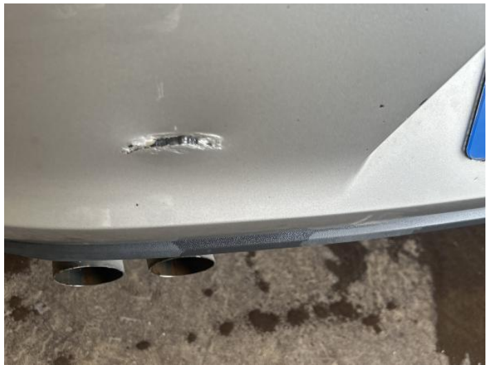
6: Bumper Rear Hole Over 25mm