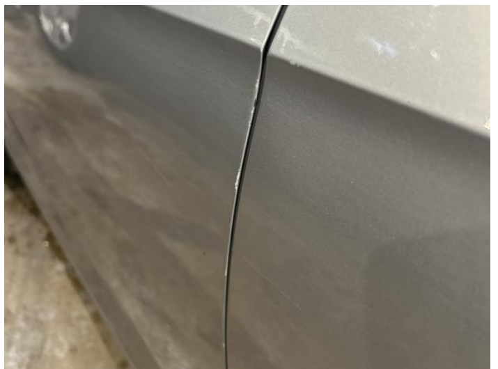
8: Door nsf Chipped Edge Chip