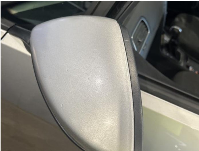
11: Door Mirror Assy nsf Scratched (Painted) Over 25mm Thru Paint