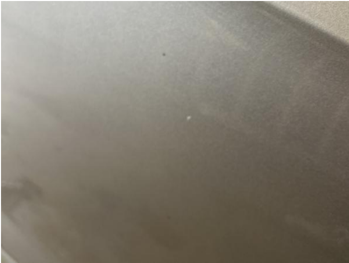
3: Door osf Chipped 1 To 5