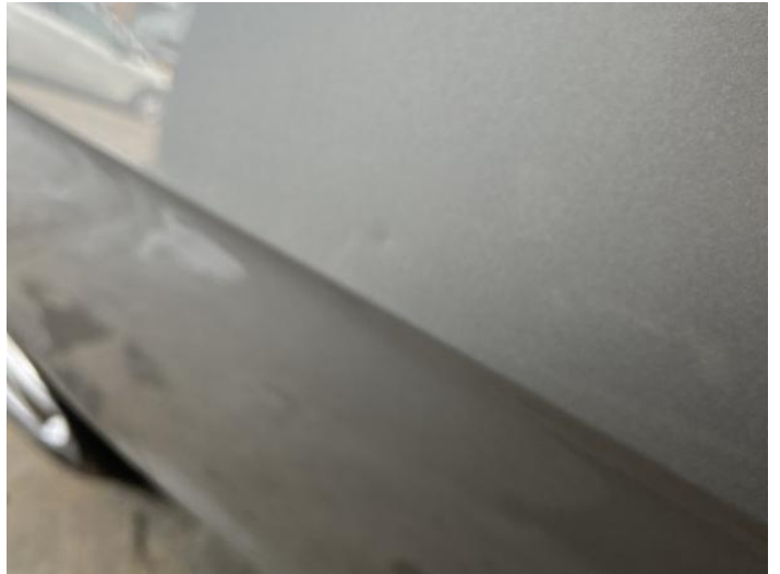
4: Door osr Dented 2 Or Less UpTo 10mm