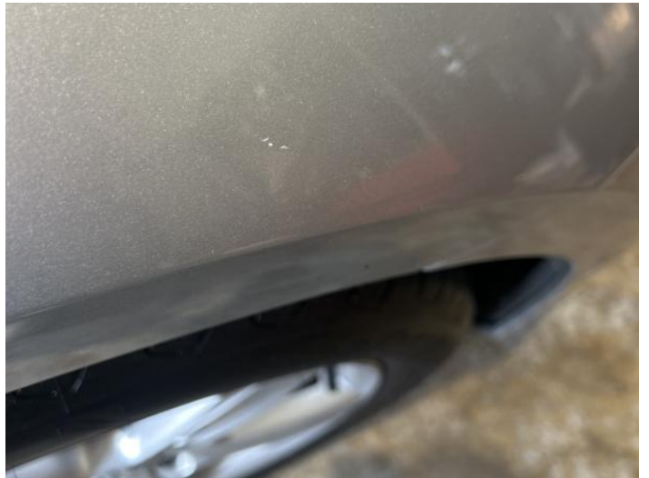
2: Wing osf Chipped 1 To 5