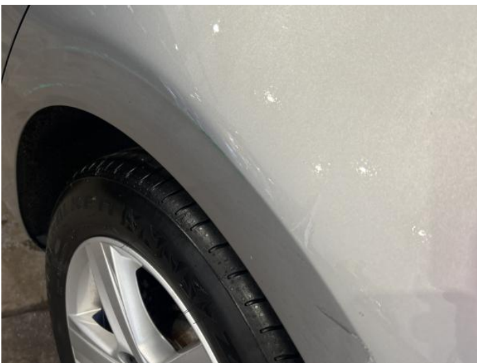
7: Qtr Panel nsr Dented With Paint Damage