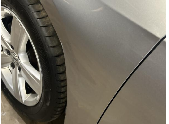
10: Wing nsf Dented With Paint Damage