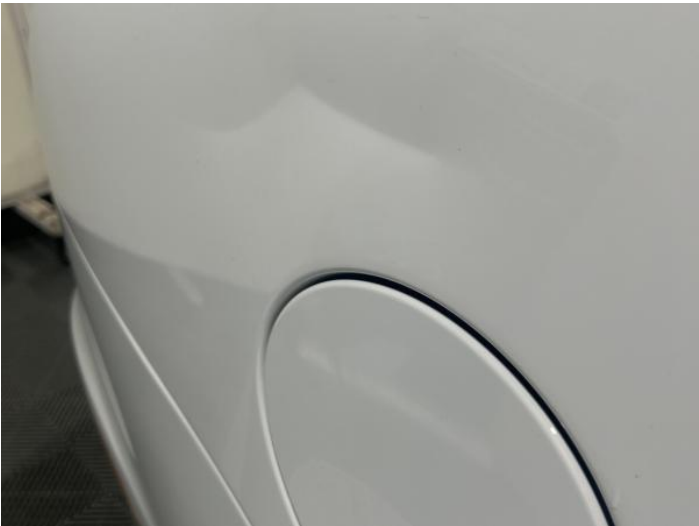
1: Qtr Panel osr Dented Over 30mm