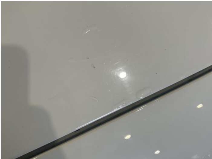
2: Bonnet Chipped 1 To 5

Carpet Condition Average Seat Condition Average