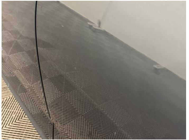
6: Door nsr Dented Between 10mm + 30mm