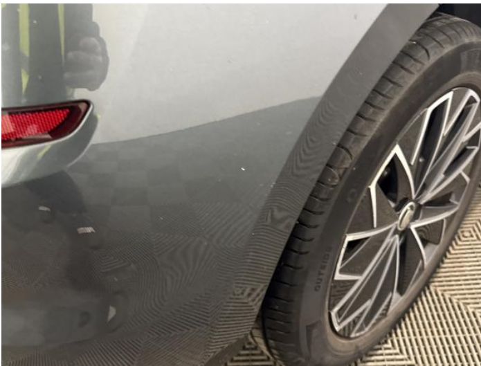
11: Bumper Rear Scratched 25 to 100mm Thru Paint