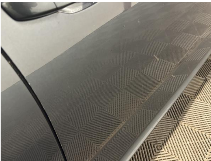
13: Door nsf Chipped Multiple Chips