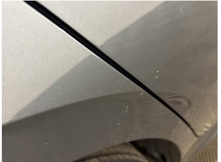
10: Qtr Panel osr Scratched UpTo 25mm Thru Paint