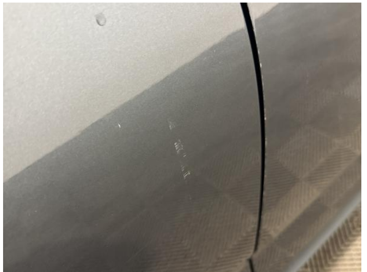
12: Door osr Scratched Over 25mm Thru Paint