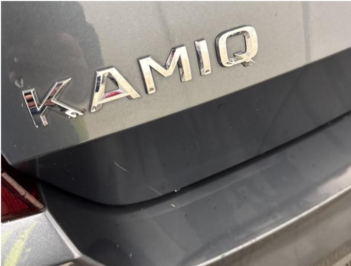
9: Tailgate Scratched Over 25mm Thru Paint