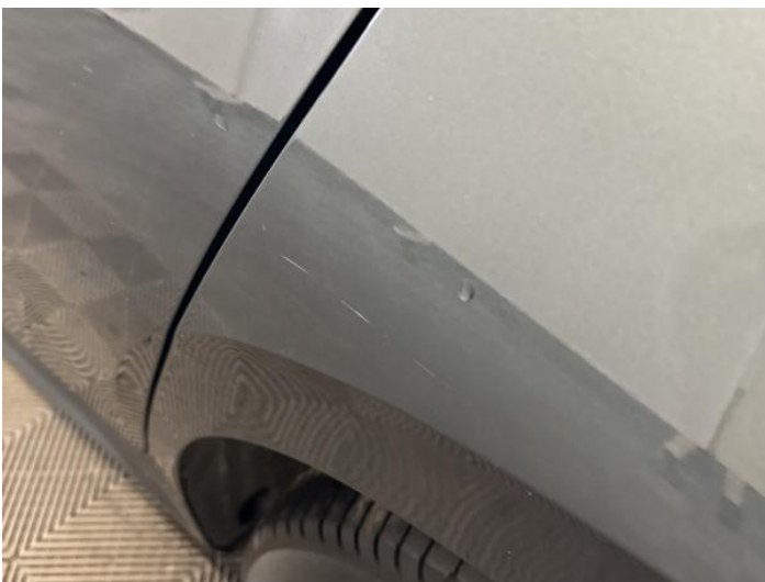
7: Qtr Panel nsr Scratched Over 25mm Thru Paint