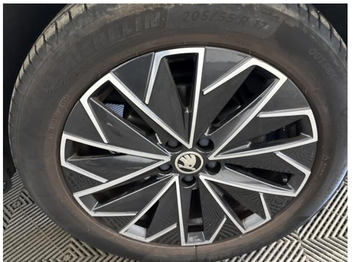
14: Wheel osf Scratched Up To 50mm