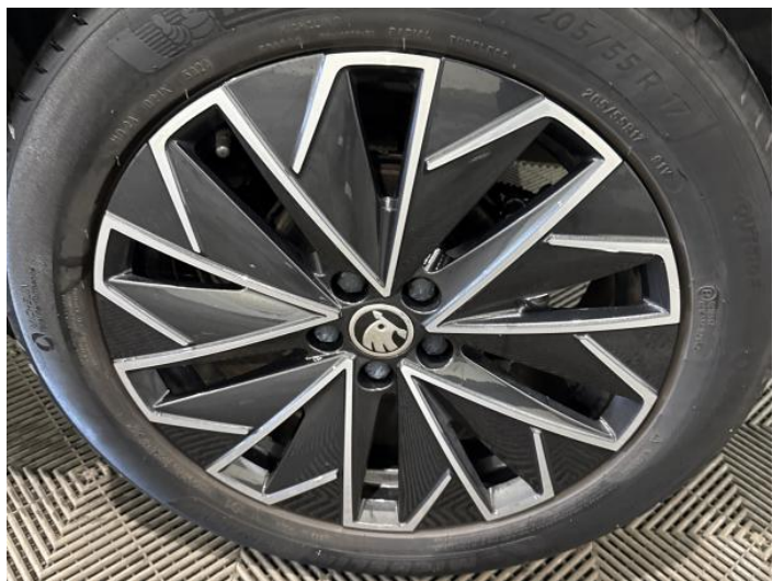
8: Wheel nsr Corroded Light