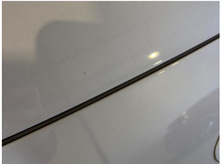
2: Bonnet Chipped 1 To 5