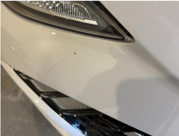
1: Bumper Front Chipped 1 To 5