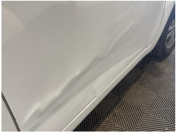
18: Door osf Dented Over 30% Of Panel