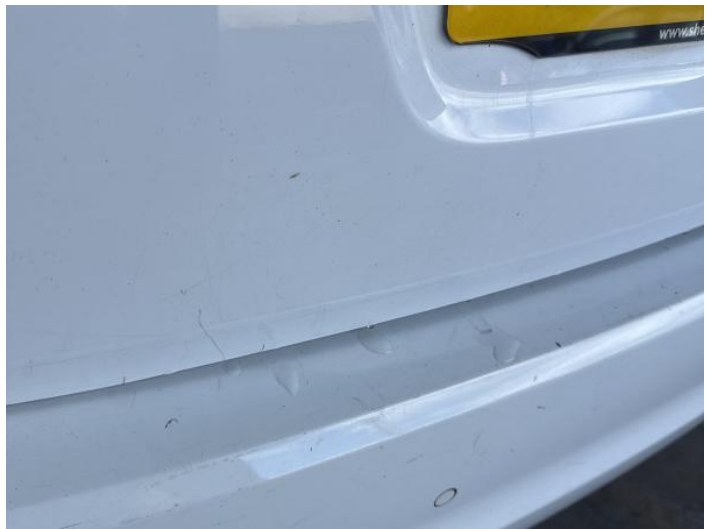
12: Tailgate Scratched Over 25mm Thru Paint