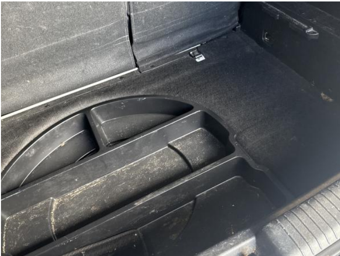
1: Other N/A N/A