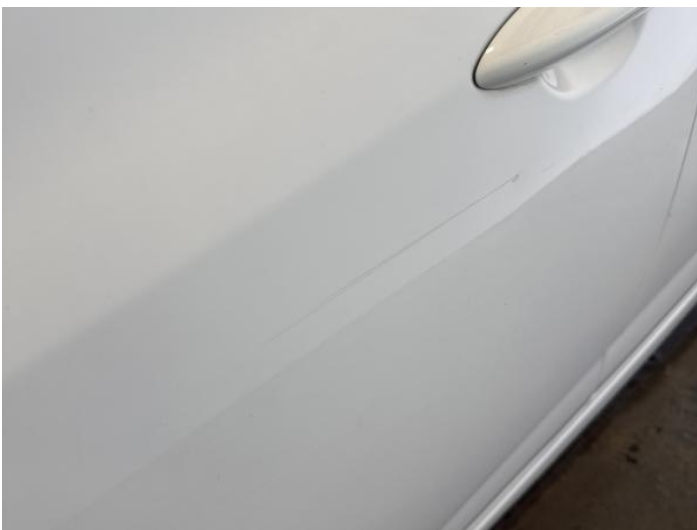
7: Door nsf Dented With Paint Damage