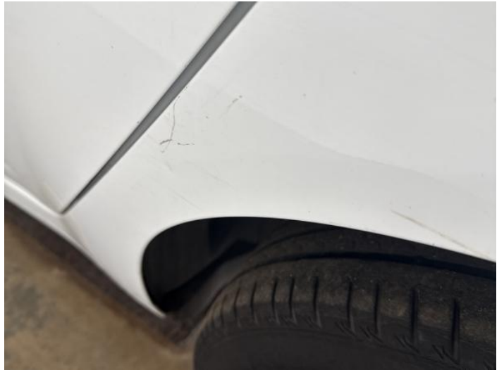
10: Qtr Panel nsr Dented Between 10mm + 30mm