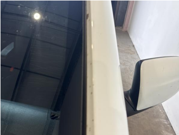
9: A Post ns Scratched Over 25mm Thru Paint