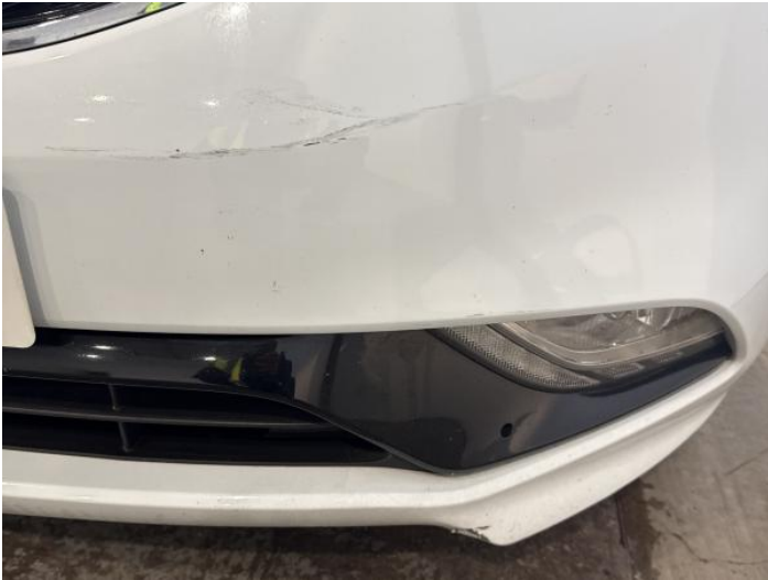
3: Bumper Front Scratched 25 to 100mm Thru Paint