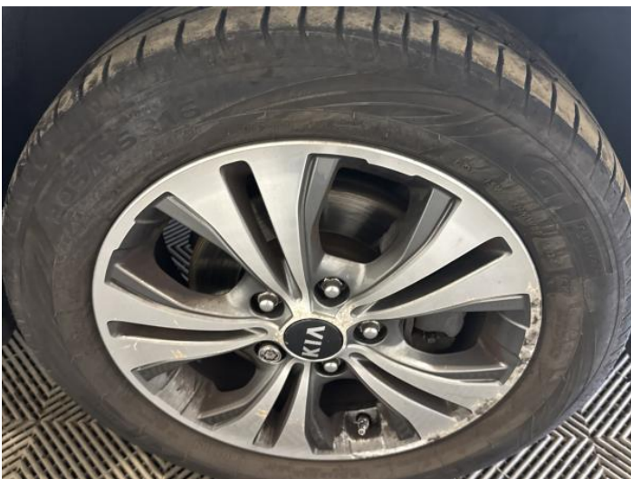
19: Wheel osf Scratched Over 50mm