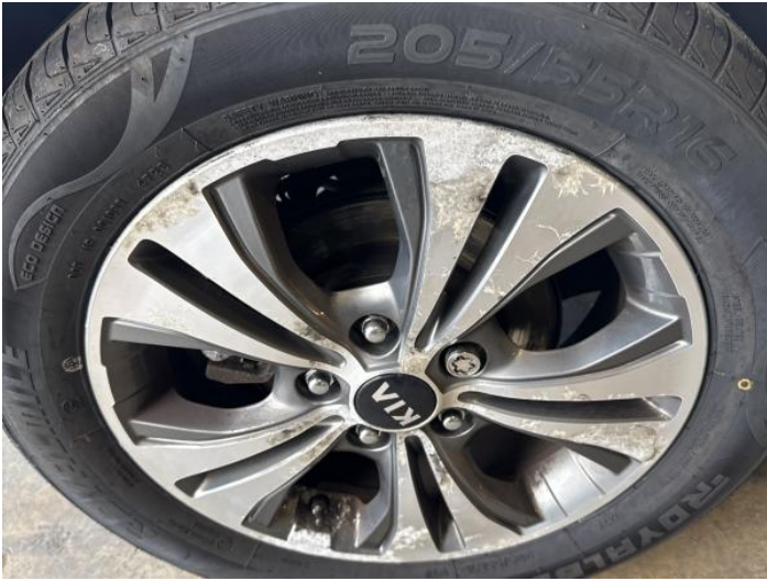
15: Wheel osr Scratched Over 50mm