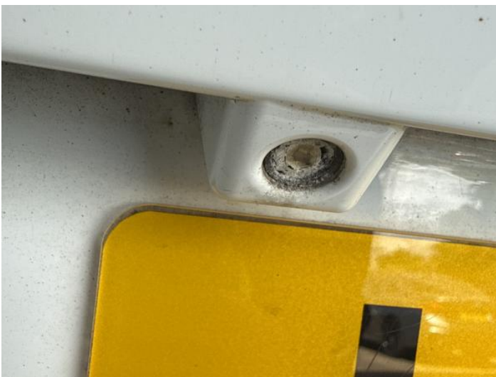
13: Other N/A N/A