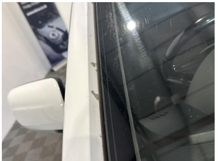
20: A Post os Scratched Over 25mm Thru Paint