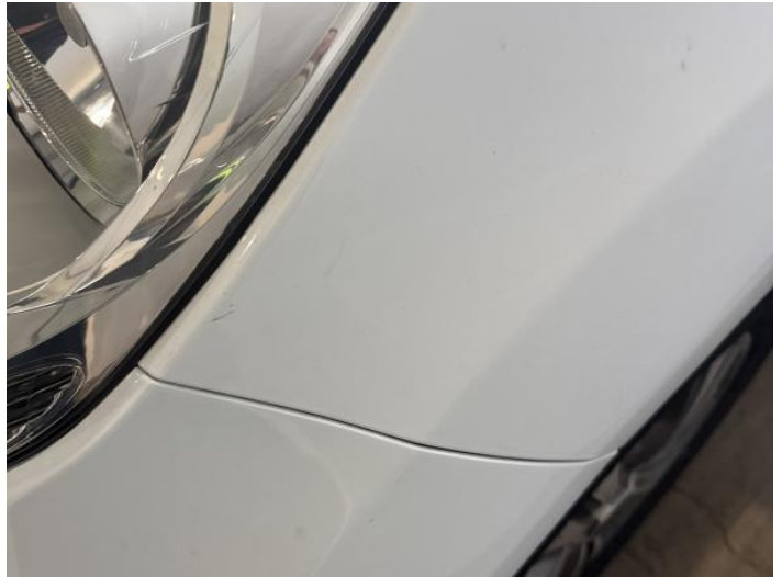
4: Wing nsf Scratched UpTo 25mm Thru Paint