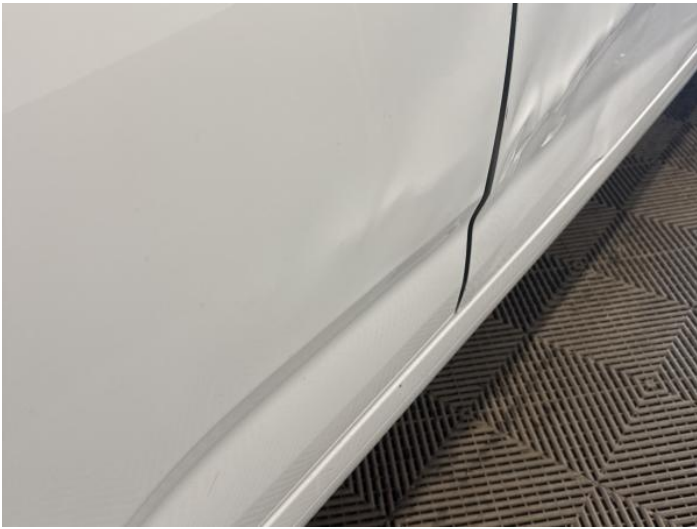
17: Door osr Dented Over 30mm