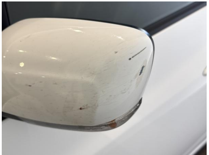
6: Door Mirror Assy nsf Scratched (Painted) Over 25mm Thru Paint