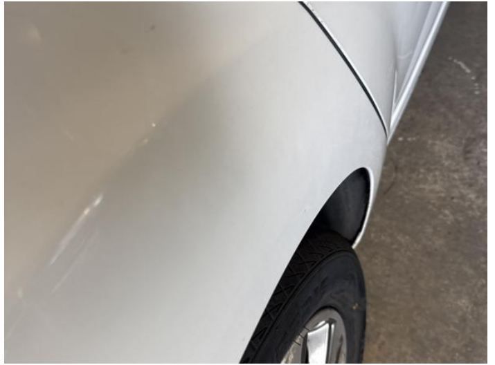
16: Qtr Panel osr Dented Over 30mm