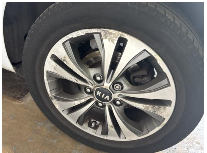
14: Wheel nsr Scratched Over 50mm