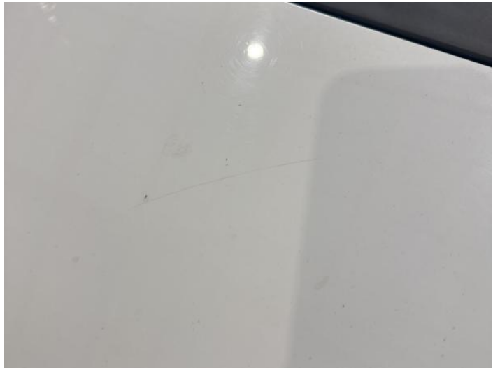
2: Bonnet Scratched Over 25mm Thru Paint