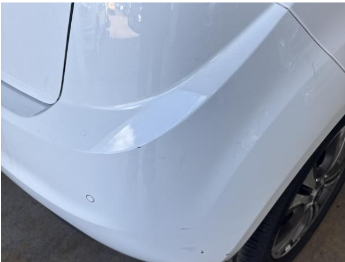
11: Bumper Rear Scratched 25 to 100mm Thru Paint