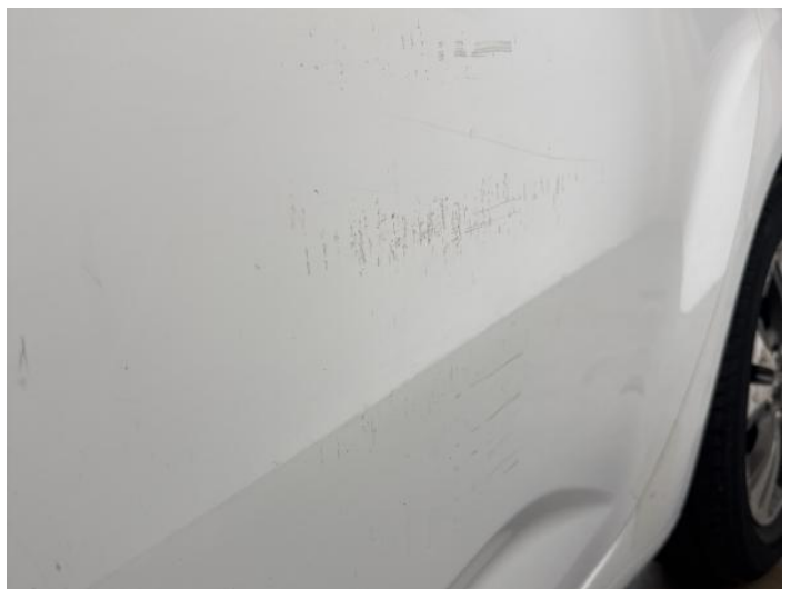
8: Door nsr Dented With Paint Damage