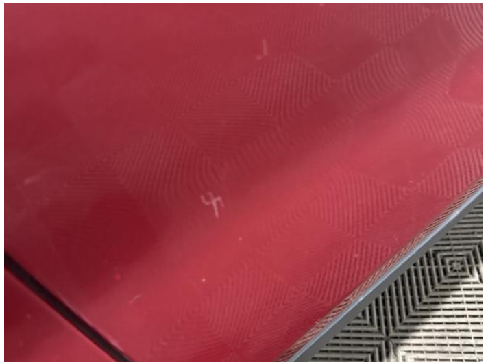
12: Door osf Scratched UpTo 25mm Thru Paint