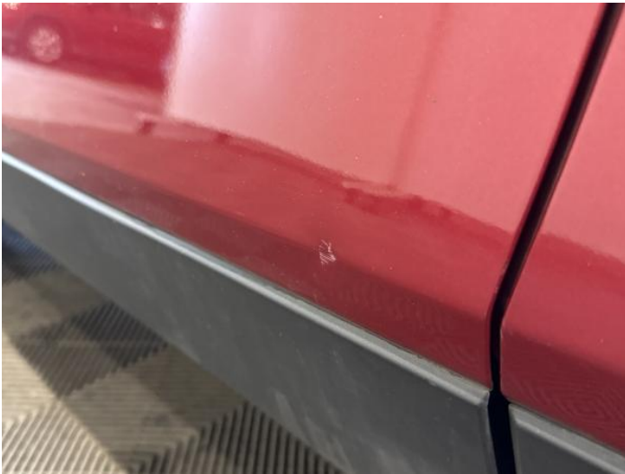
5: Door nsf Dented Between 10mm + 30mm