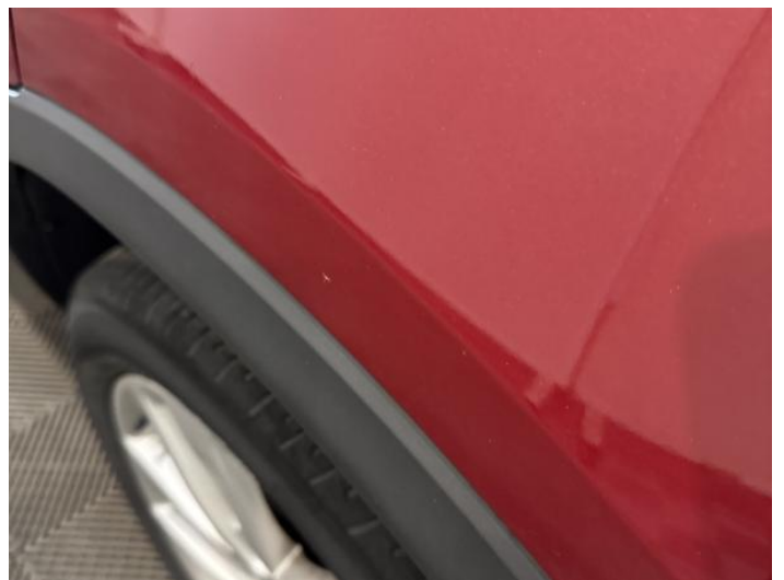
8: Qtr Panel nsr Chipped 1 To 5