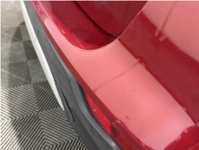
9: Bumper Rear Scratched 25 to 100mm Thru Paint