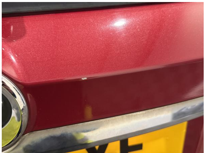
14: Tailgate Poor Previous Repair Poor Paint