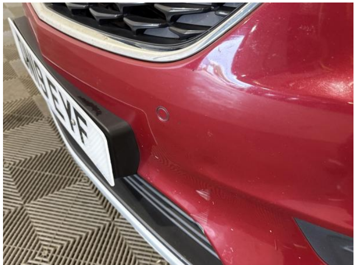
2: Bumper Front Poor Previous Repair Poor Paint