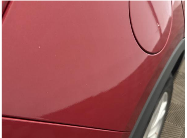
10: Qtr Panel osr Dented With Paint Damage