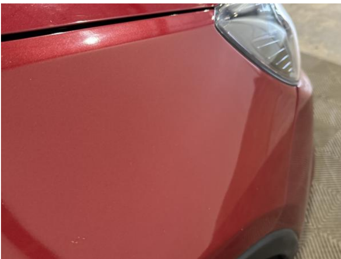
13: Wing osf Poor Previous Repair Rippled UpTo 30%