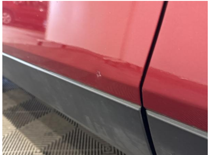
6: Door nsf Scratched Over 25mm Thru Paint