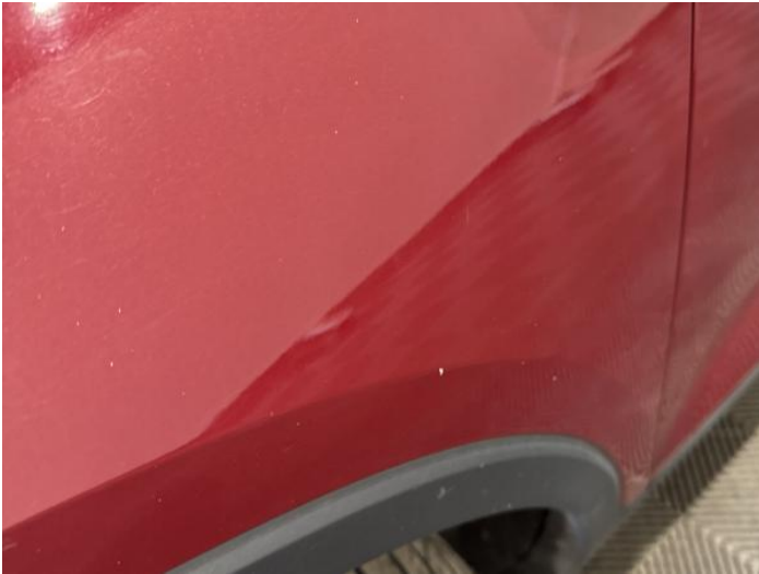
3: Wing nsf Chipped 1 To 5