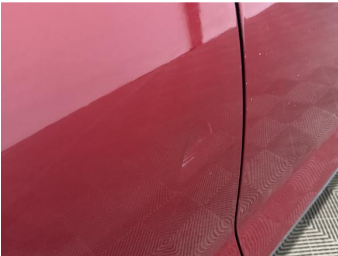
11: Door osr Dented With Paint Damage