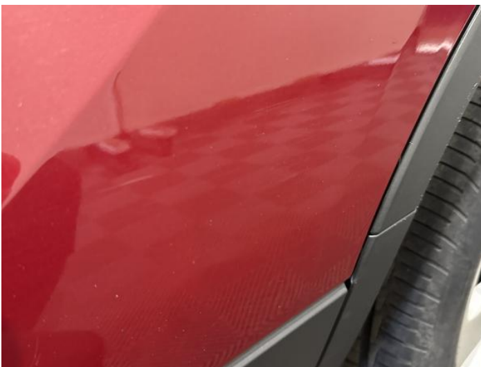
7: Door nsr Scratched Over 25mm Thru Paint