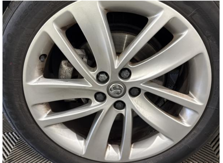
4: Wheel nsf Scratched Up To 50mm