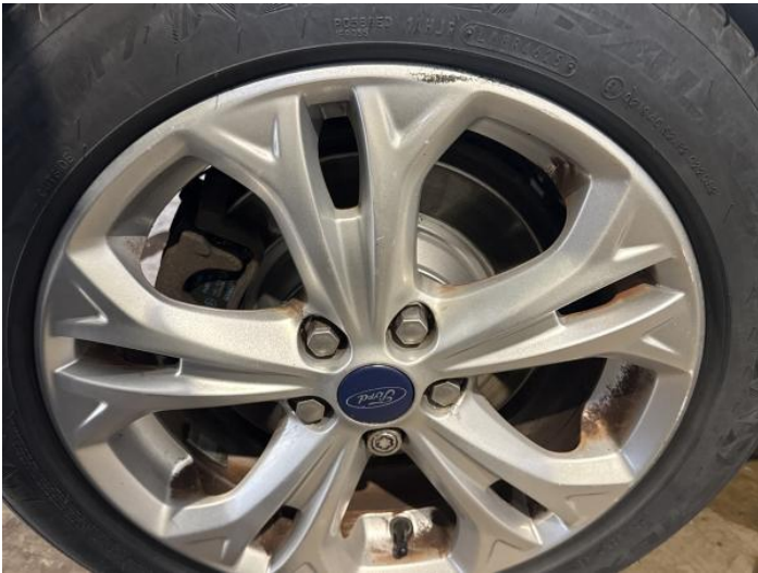
11: Wheel osr Scratched Over 50mm