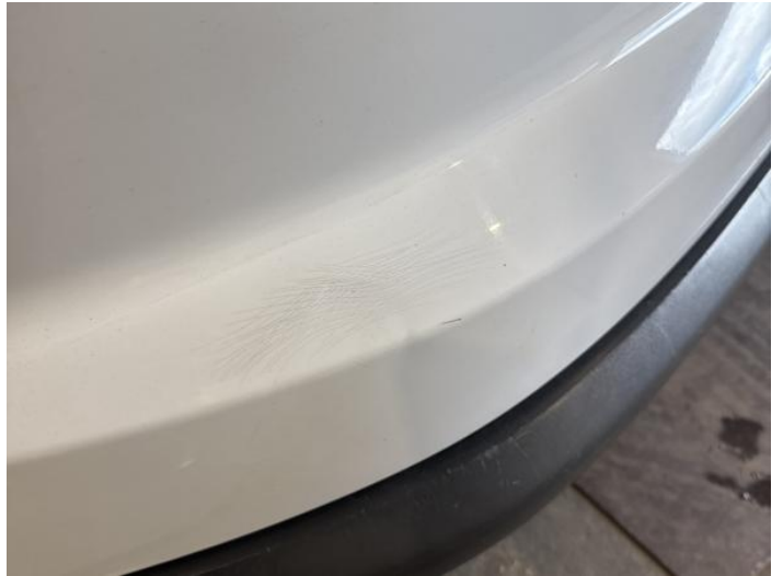
10: Tailgate Dented With Paint Damage