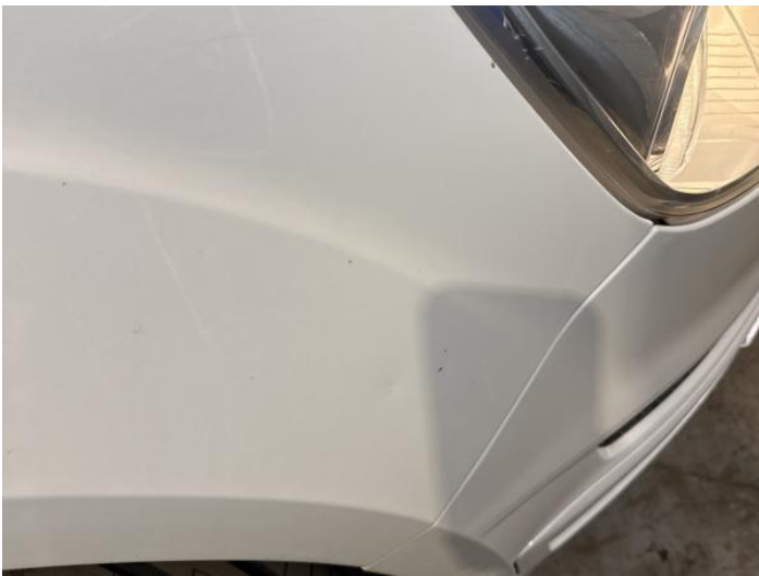
17: Wing osf Chipped 1 To 5