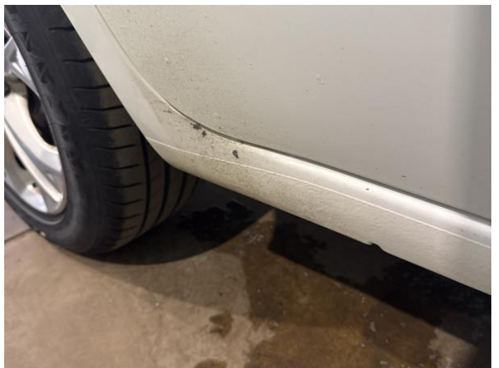
14: Sill os Chipped Over 5mm