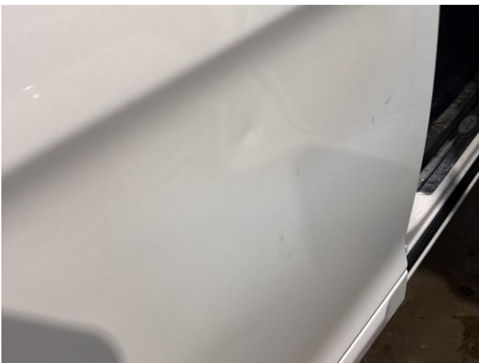
13: Door osr Dented With Paint Damage