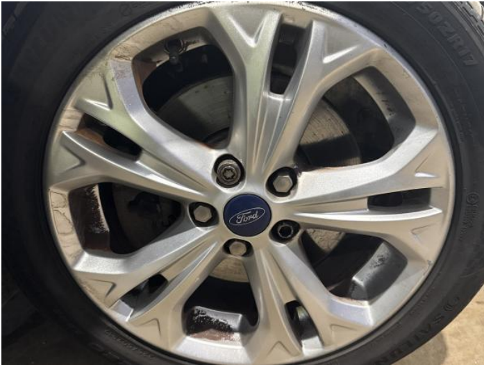
3: Wheel nsf Scratched Up To 50mm