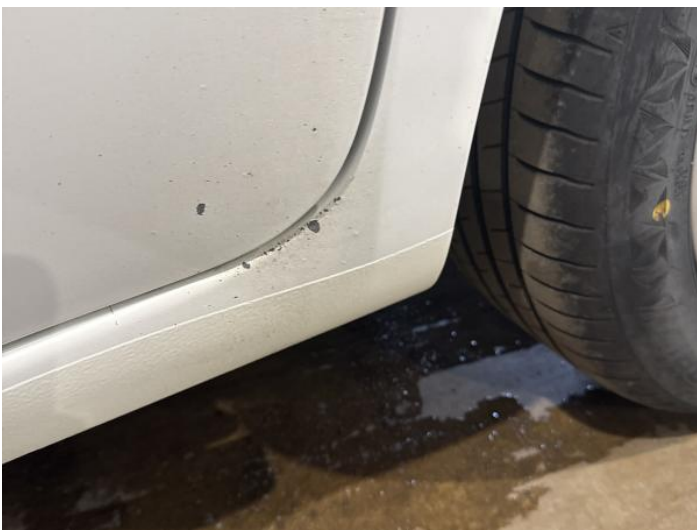
7: Qtr Panel nsr Chipped Over 5mm