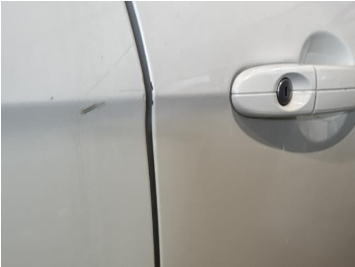
15: Door osf Chipped Edge Chip