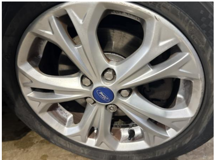
18: Wheel osf Scratched Over 50mm