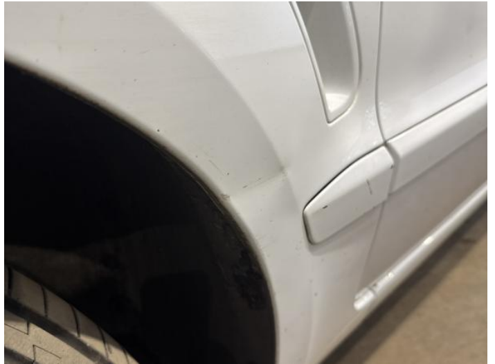
4: Wing nsf Dented With Paint Damage