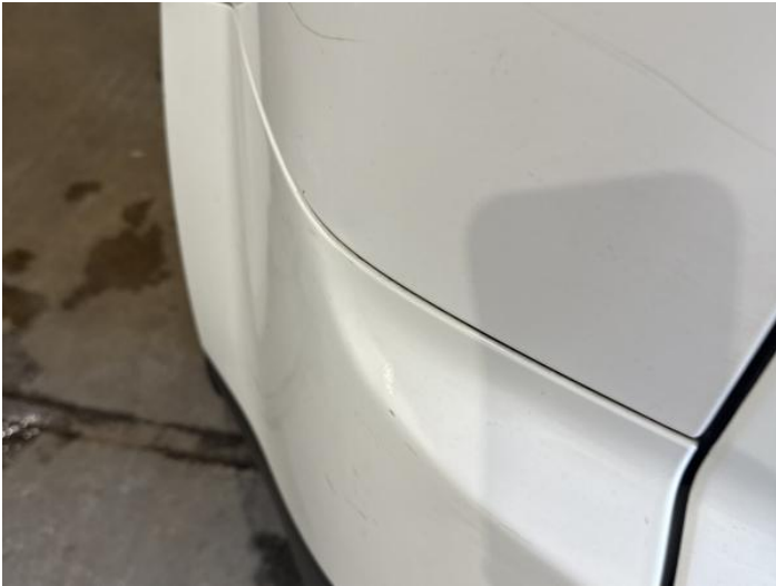
9: Bumper Rear Scratched 25 to 100mm Thru Paint