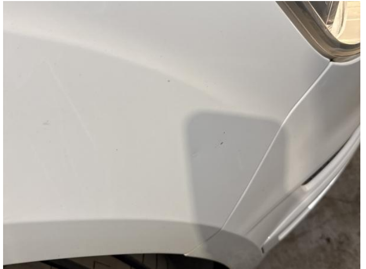
16: Wing osf Dented Between 10mm + 30mm