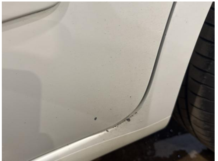
6: Door nsr Chipped Multiple Chips