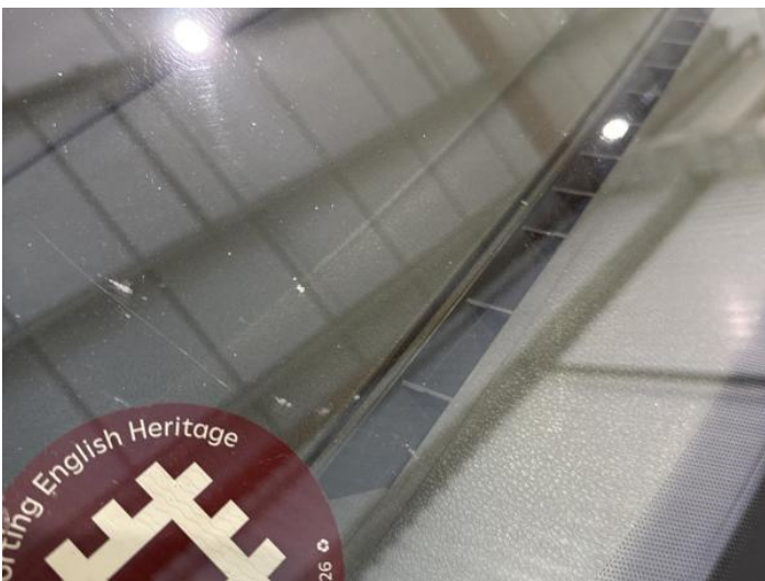
19: Screen Front Chipped Up To 10mm