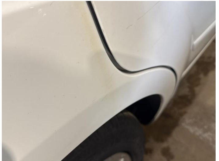
12: Qtr Panel osr Scratched UpTo 25mm Thru Paint